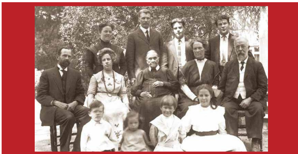
Ellen G. White (Seated in the middle) with her family at Elmhaven August 24, 1913