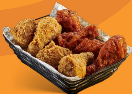
HALF AND HALF