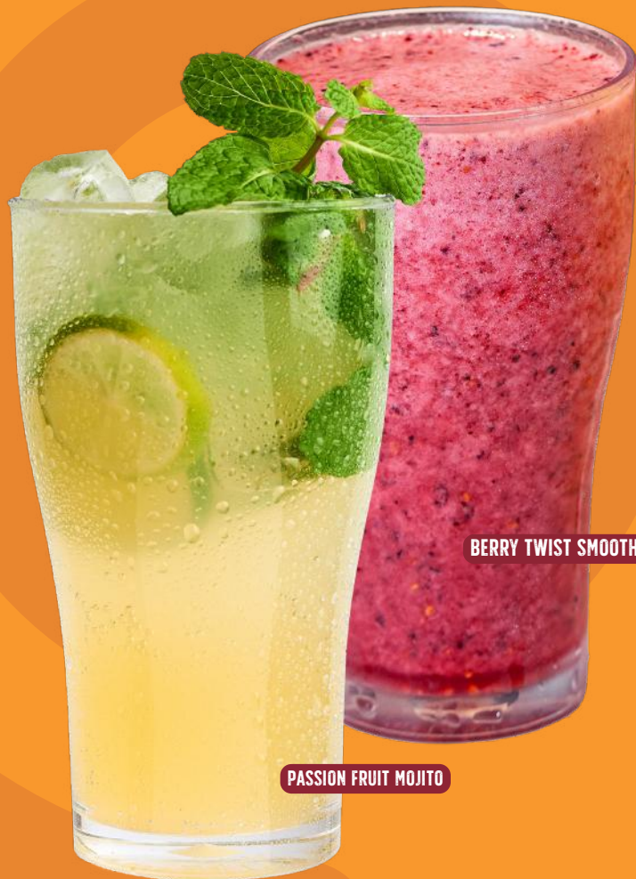
BERRY TWIST SMOOTHIE