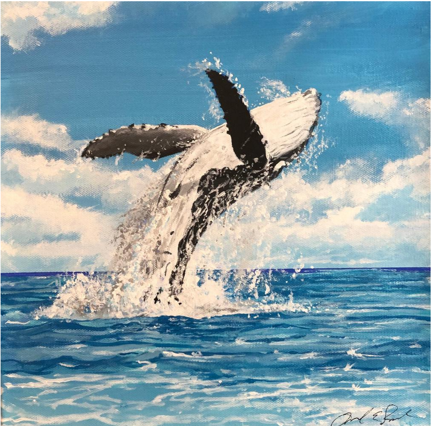
Frank Rock , Breach for the Sky , Acrylic on canvas, 12" x 12" ($150)