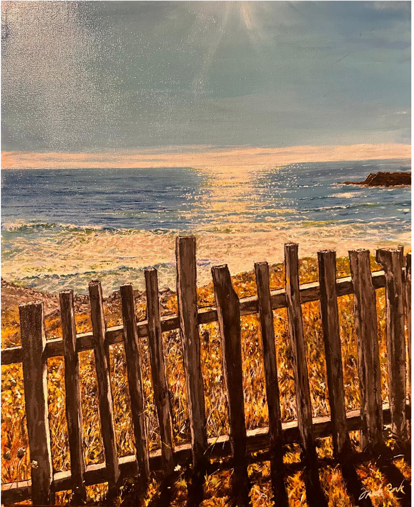
Frank Rock , Standoff , Acrylic on canvas, 16" x 20" ($350) Inspired by a photograph by Elizabeth Sosner.