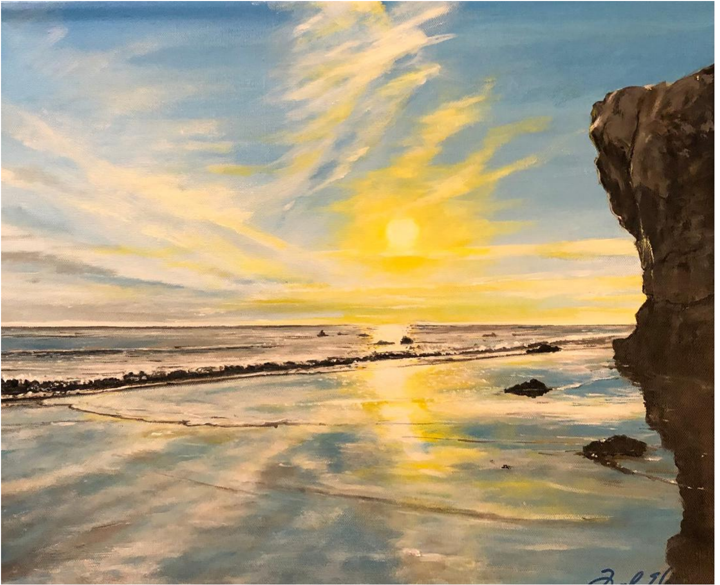
Frank Rock , Never Met A Beach I Didn't Like , Acrylic on canvas, 20" x 16" ($250) Inspired by a photograph by Marianne Shean.