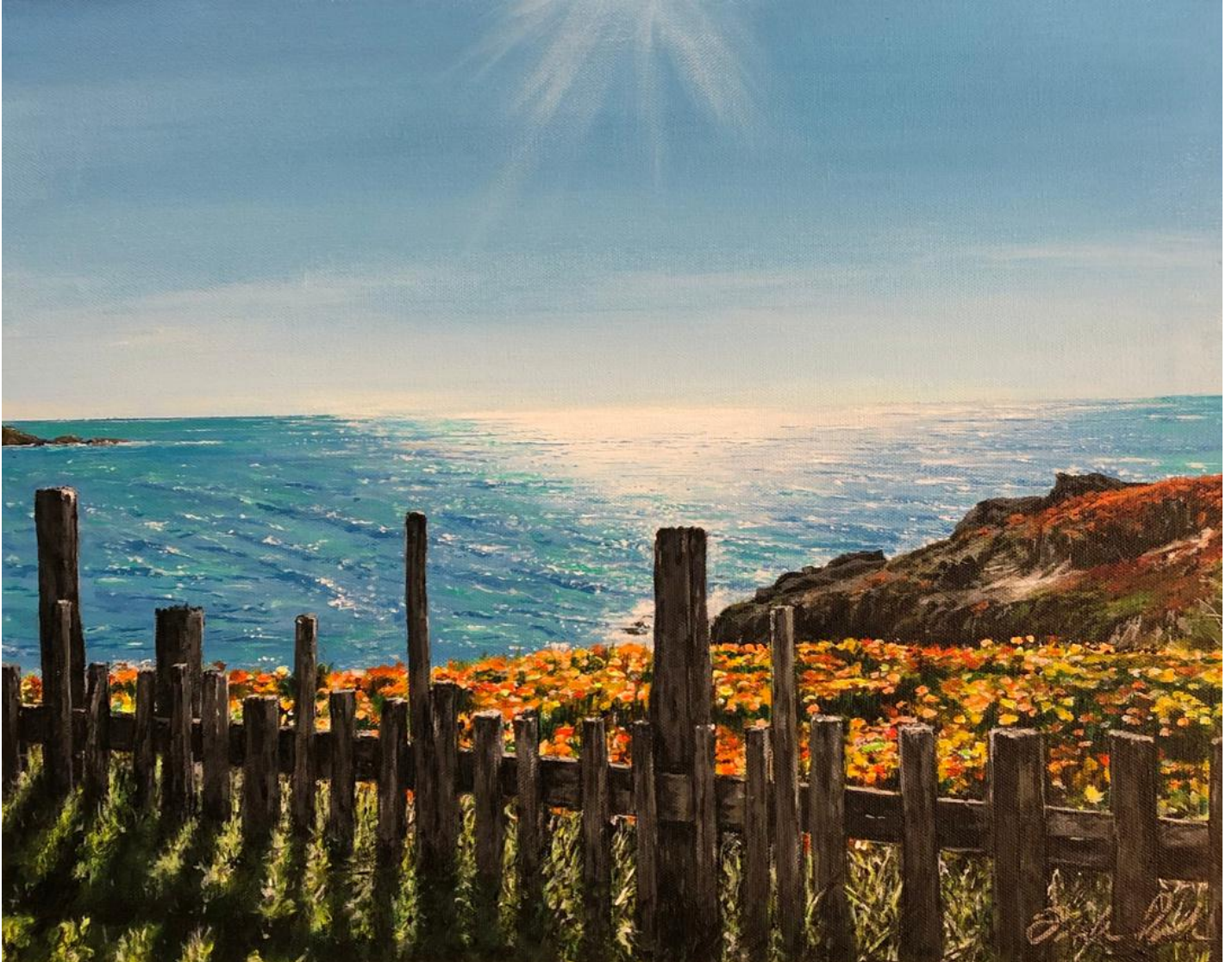
Frank Rock , Sea Ranch Solace , Acrylic on canvas, 20" x 16" ($350) Inspired by a photograph by Elizabeth Sosner.