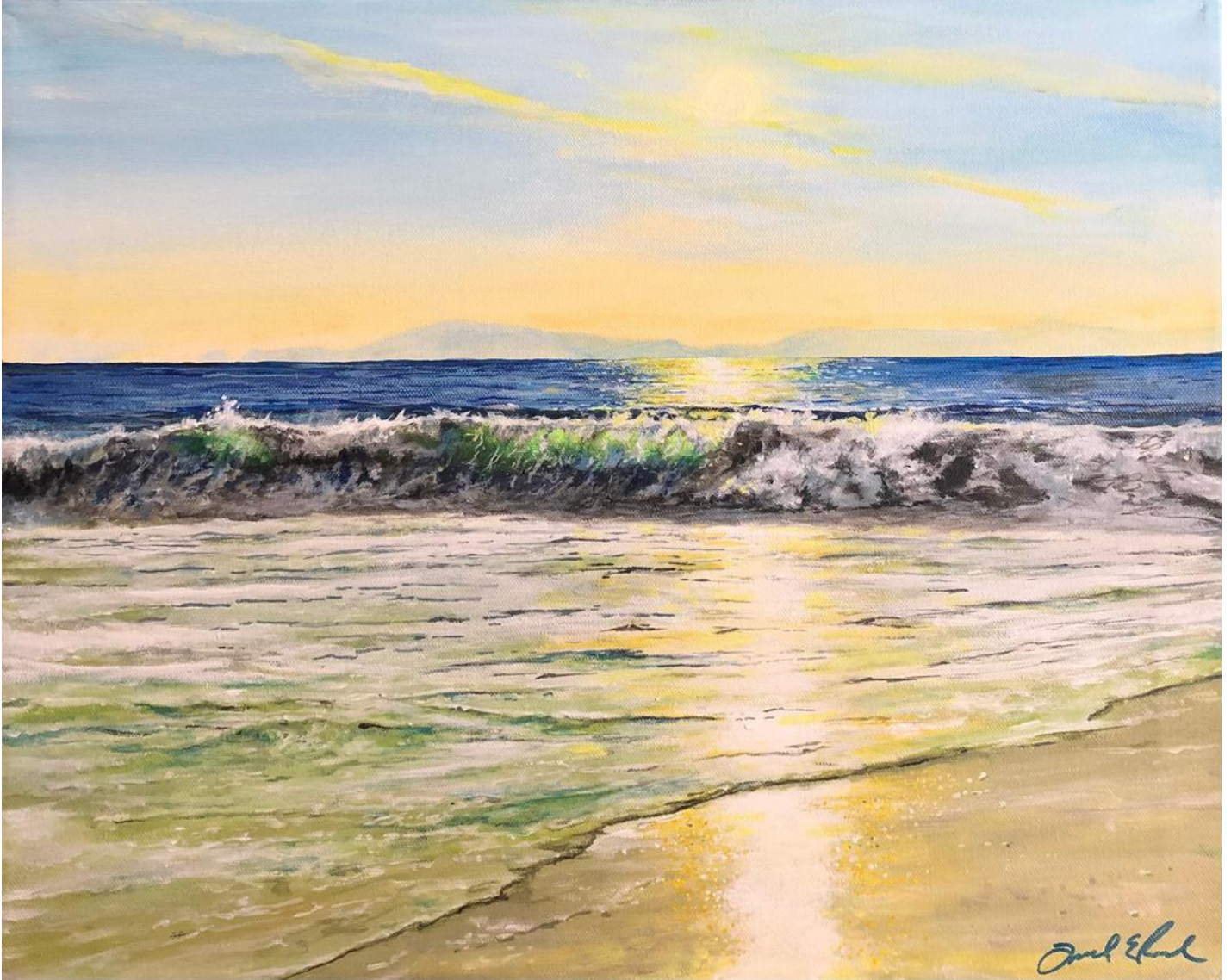
Frank Rock , Deep Breath , Acrylic on canvas, 20" x 16" ($300) Inspired by a photograph by Stephen K. Peeples.