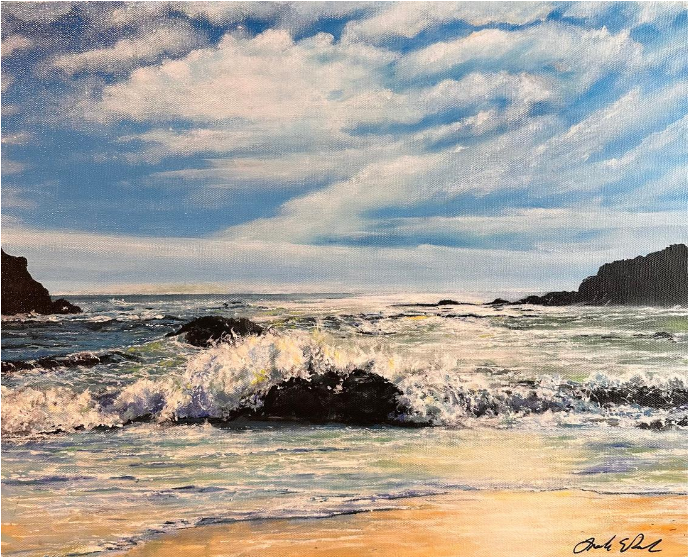
Frank Rock , Rock Show , Acrylic on canvas, 20" x 16" ($400) Inspired by a photograph by Michael Gattuso.