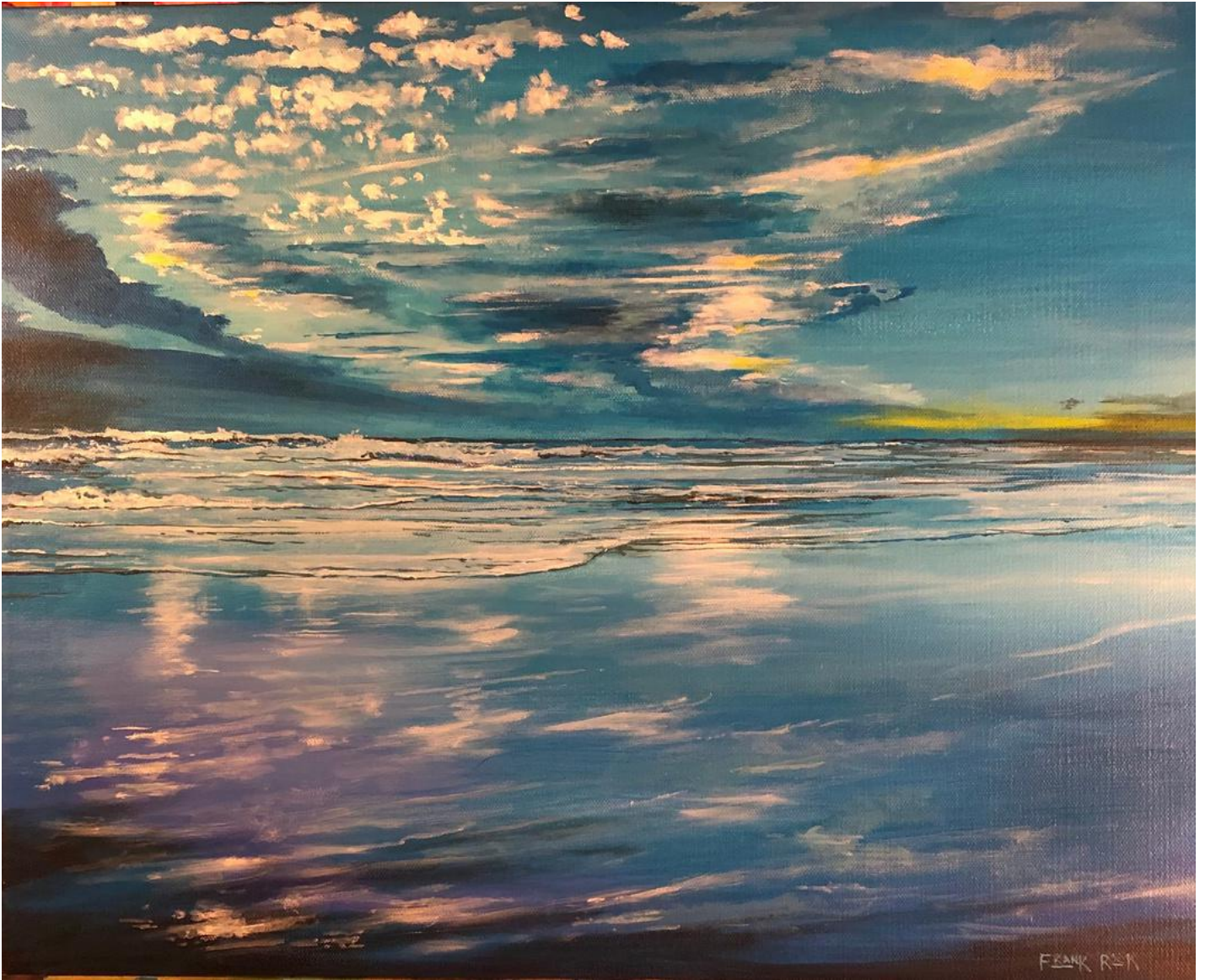
Frank Rock , Deep Blue , Acrylic on canvas, 20" x 16" ($300) Inspired by a photograph by Jeff Vincent.