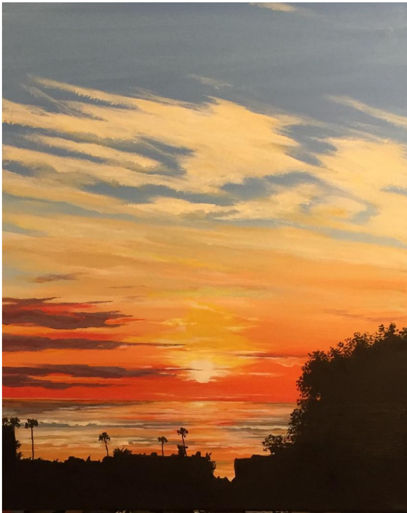
Frank Rock , Imagine , Acrylic on canvas, 16" x 20" ($150)