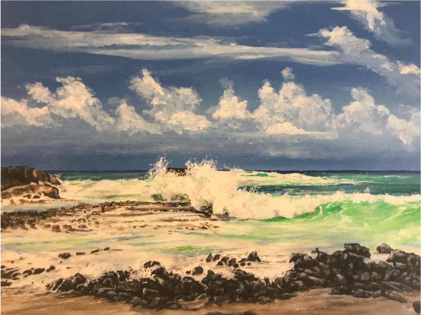
Frank Rock , Cozumel Splash , Acrylic on canvas, 24" x 20" ($500) Inspired by a photograph by Cheryl Hawkins.