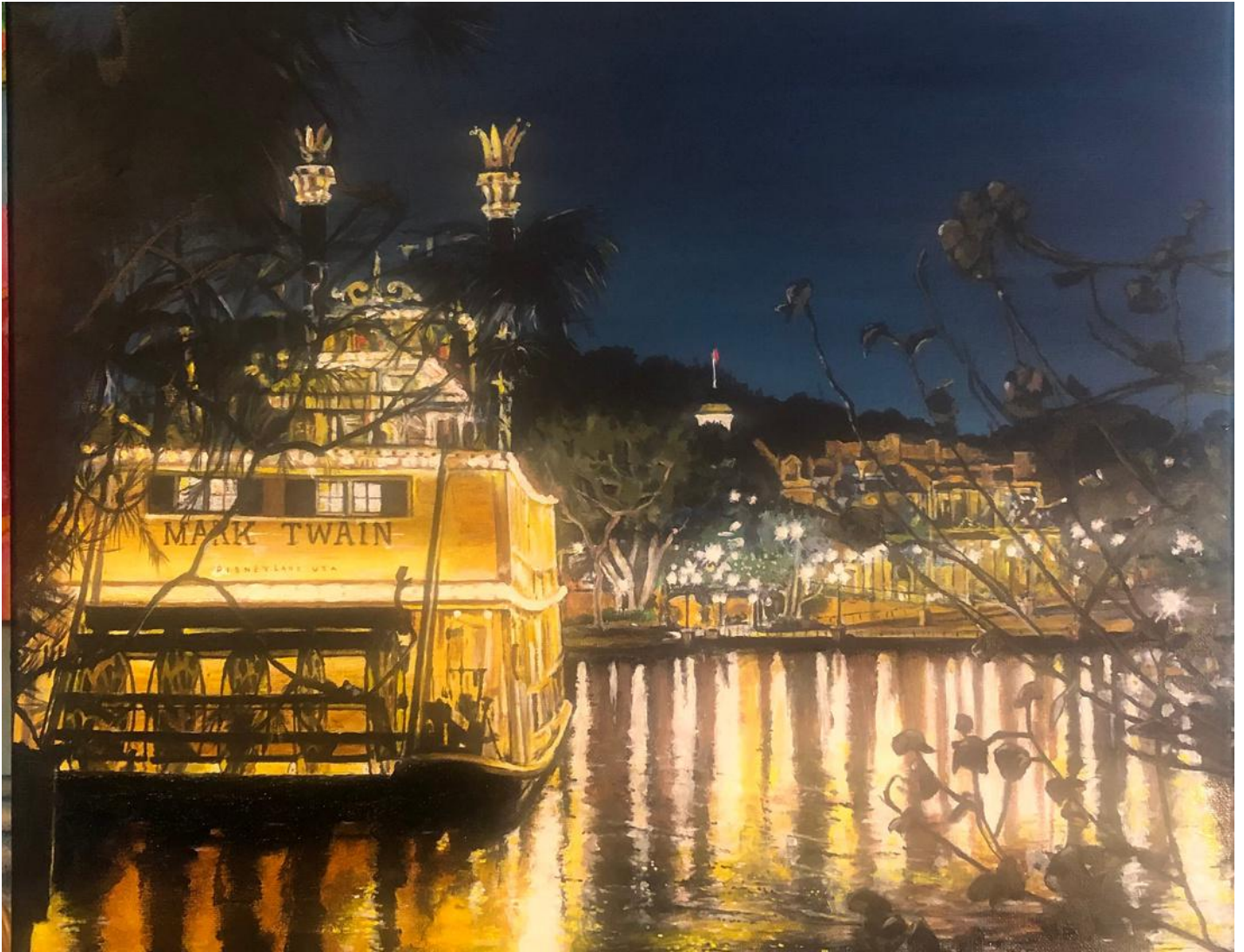
Frank Rock , Twain In the Twilight , Acrylic on canvas, 20" x 16" ($500)