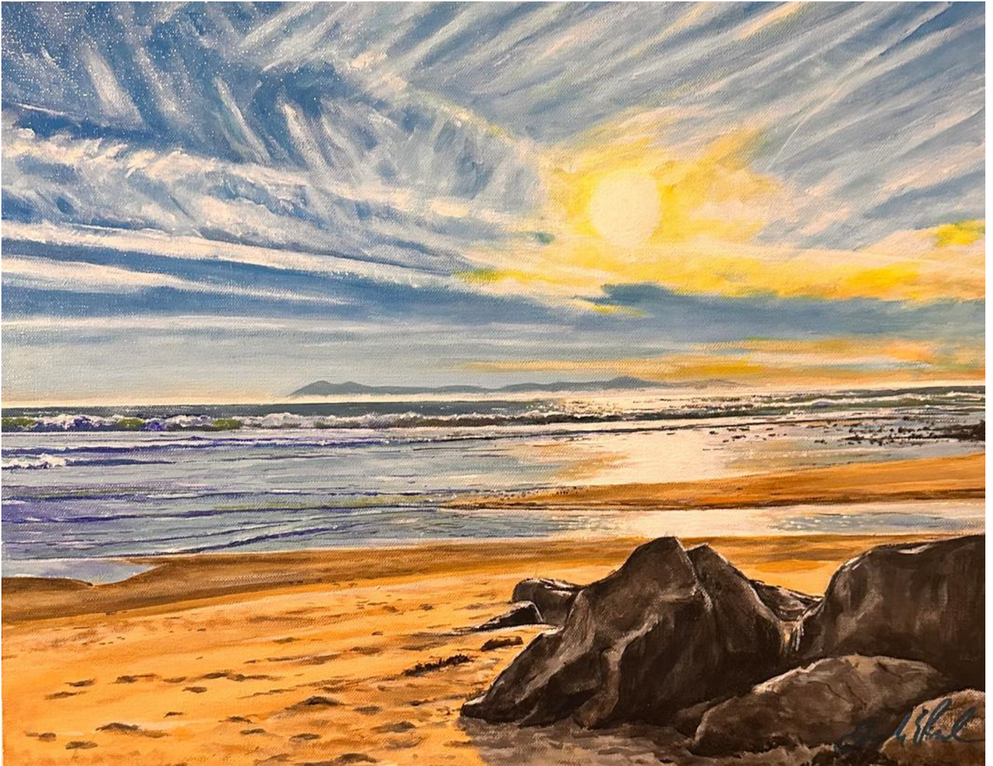
Frank Rock , Contrails and Waves , Acrylic on canvas, 20" x 16" ($300) Inspired by a photograph by Stephen K. Peebles.