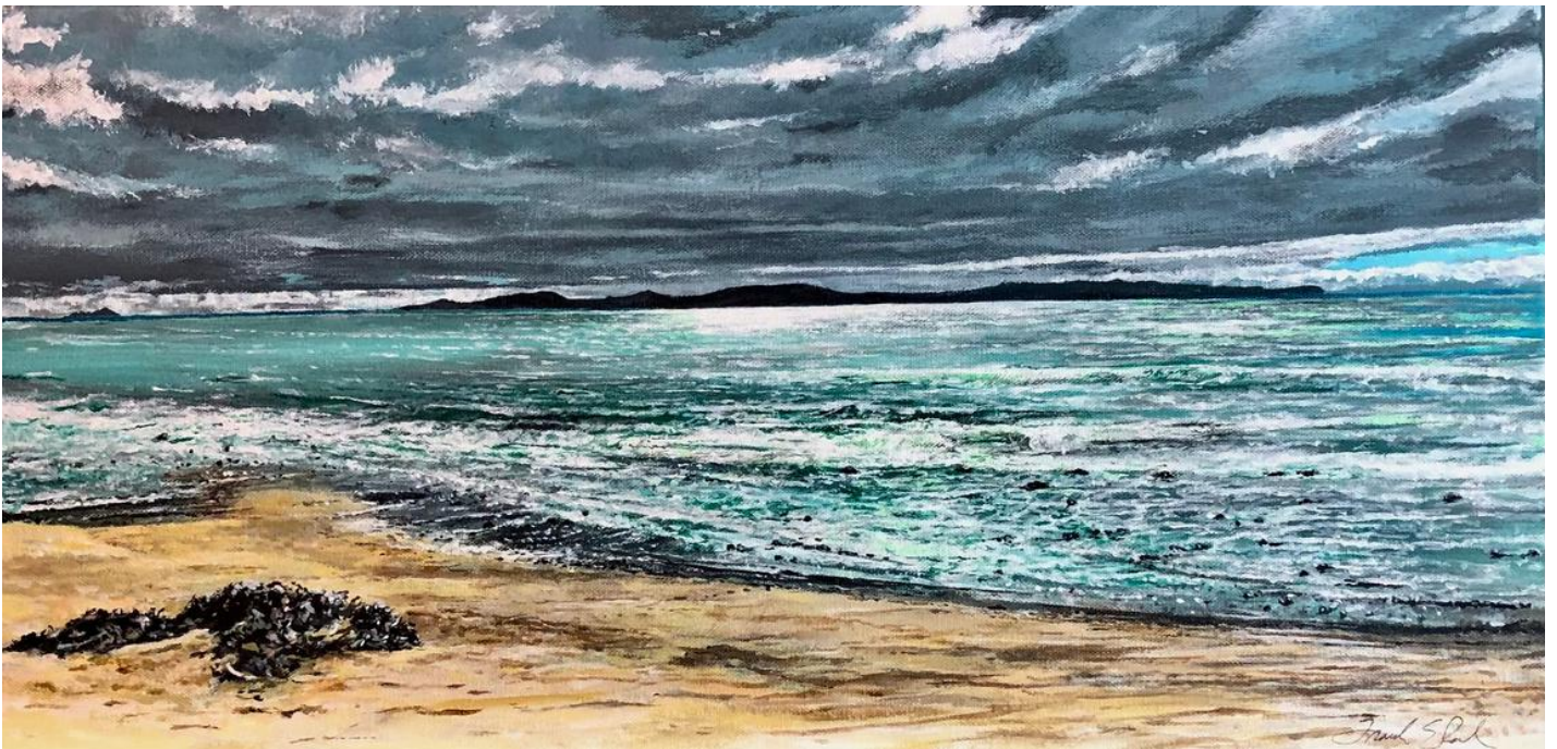
Frank Rock , Sands of Mystery , Acrylic on canvas, 24" x 12" ($200) Inspired by a photograph by Stephen K. Peeples.