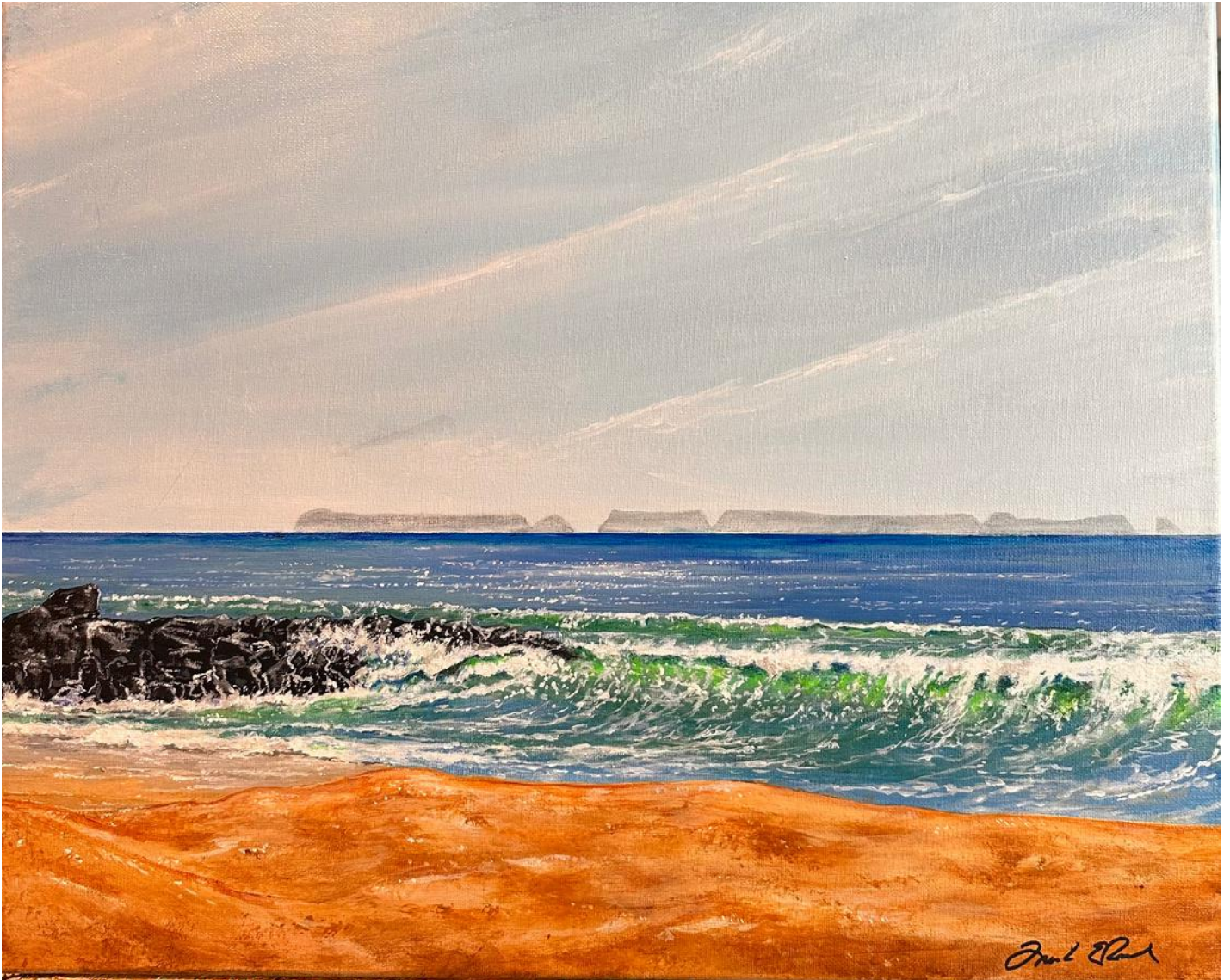
Frank Rock , Anacapa , Acrylic on canvas, 20" x 16" ($300)