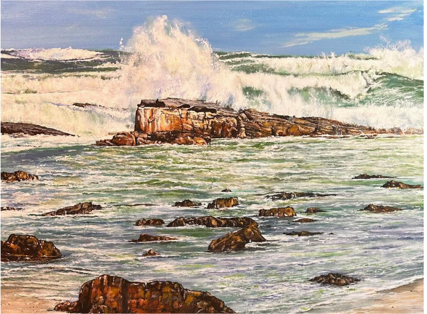
Frank Rock , Turbulence , Acrylic on canvas, 24" x 18" ($500) Inspired by a photograph by Cheryl Hawkins.