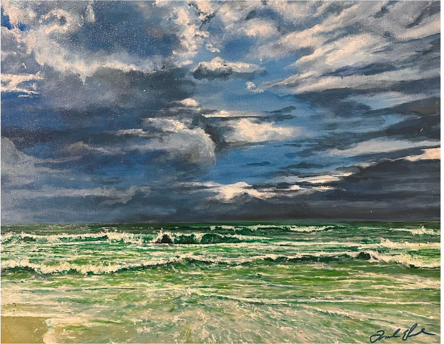
Frank Rock , Pensacola Pause , Acrylic on canvas, 20" x 16" ($300) Inspired by a photograph by Lori D'Itri.