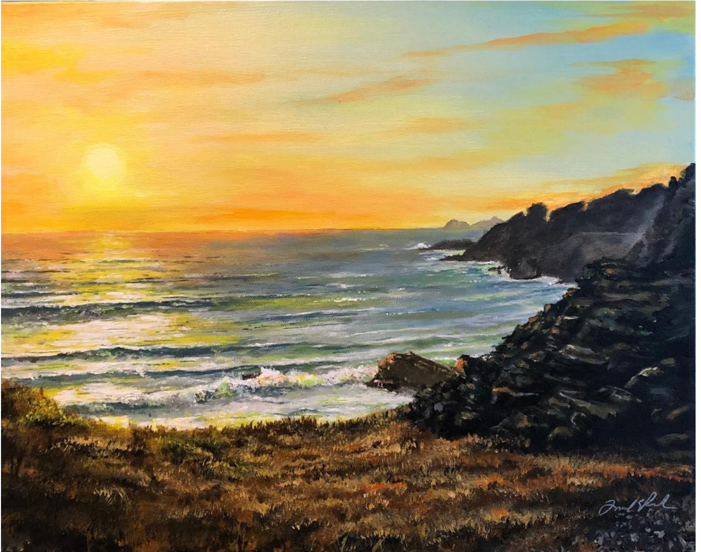
Frank Rock , Moody Bay , Acrylic on canvas, 20" x 16" ($400) Inspired by a photograph by Elizabeth Sosner.