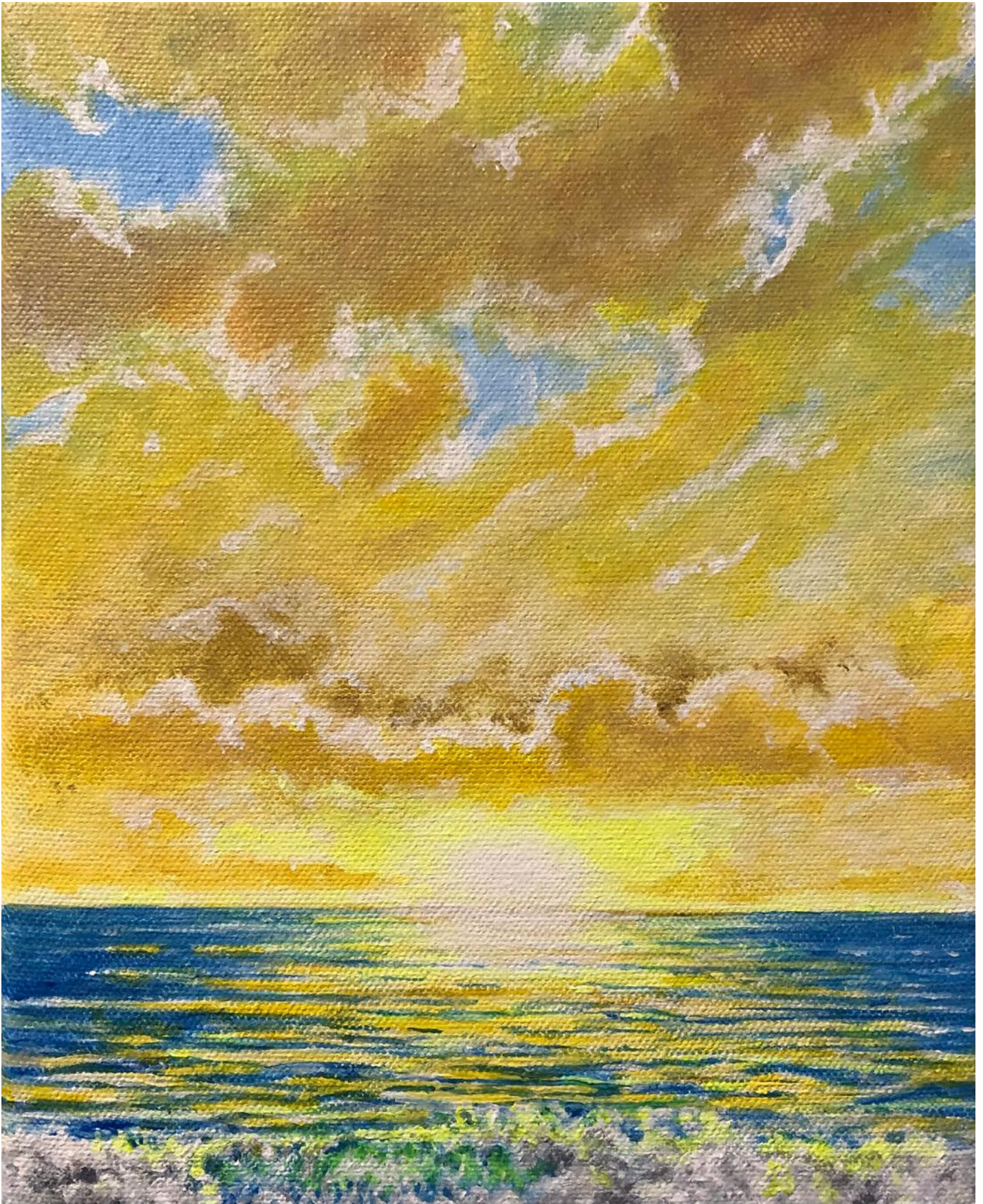
Frank Rock , Godspeed, Captain , Acrylic on canvas, 8" x 10" ($100)