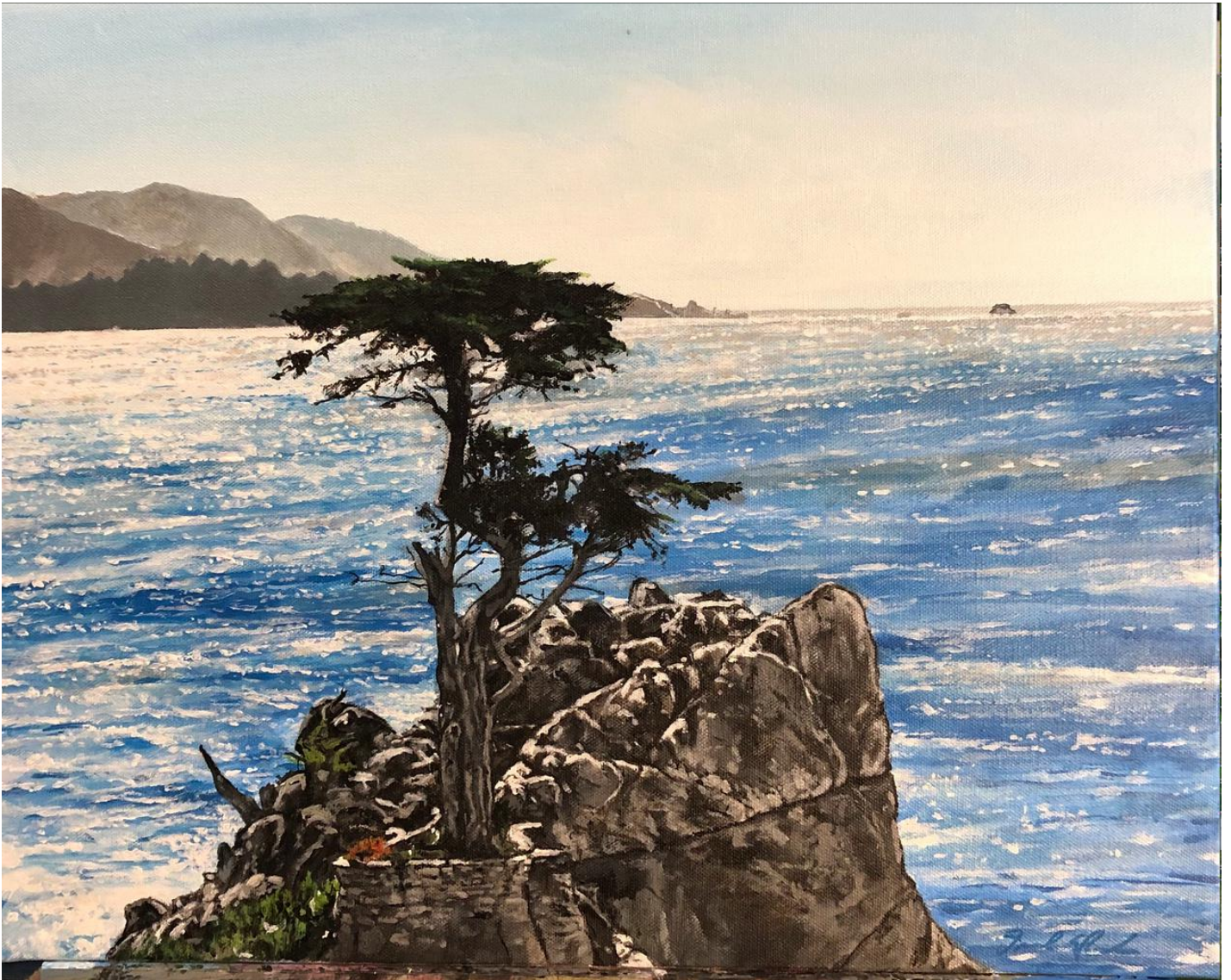
Frank Rock , Cypress Sentinel , Acrylic on canvas, 20" x 16" ($400) Inspired by a photograph by Janet McAnany.