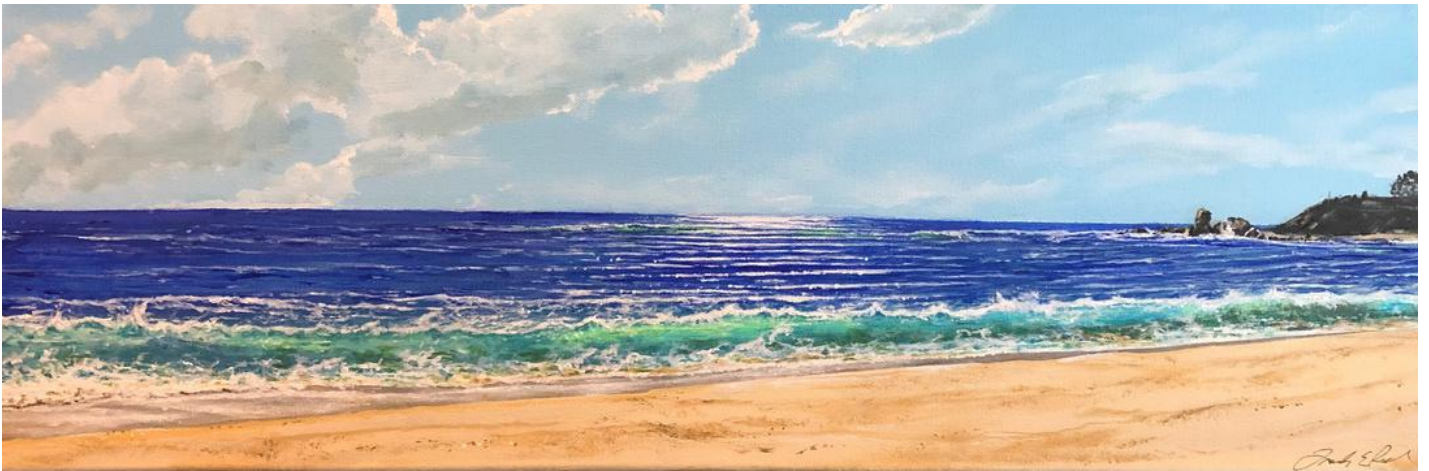
Frank Rock , Diamonds in the Surf , Acrylic on canvas, 30" x 10" ($250)