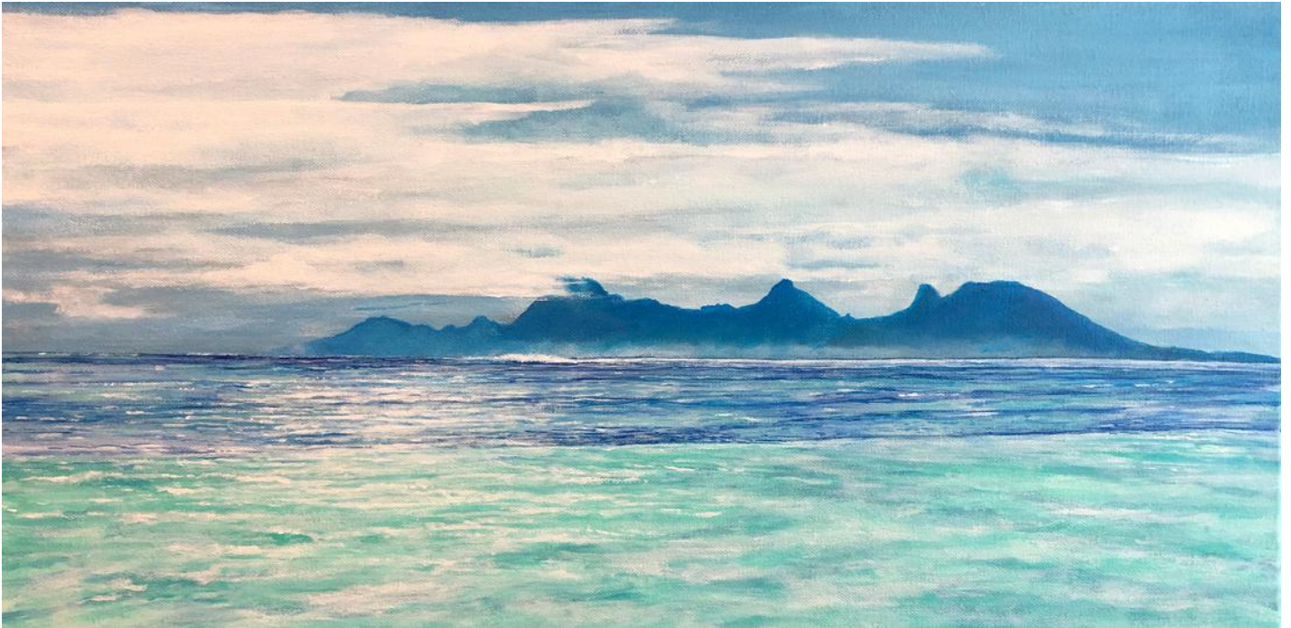
Frank Rock , Fiji Morning , Acrylic on canvas, 24" x 12" ($200) Inspired by a photograph by Elizabeth Sosner.