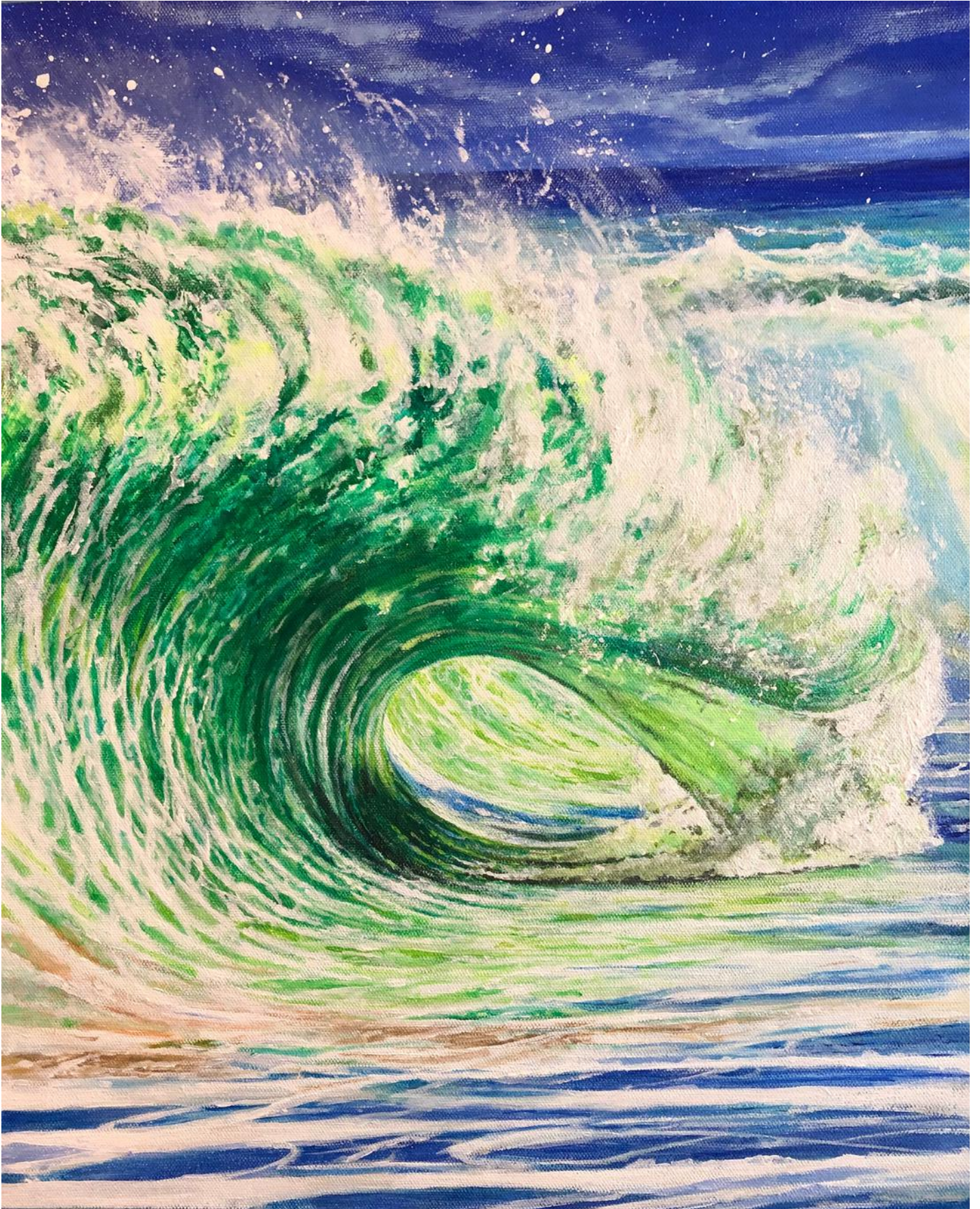
Frank Rock , Cowabunga! , Acrylic on canvas, 16" x 20" ($250)