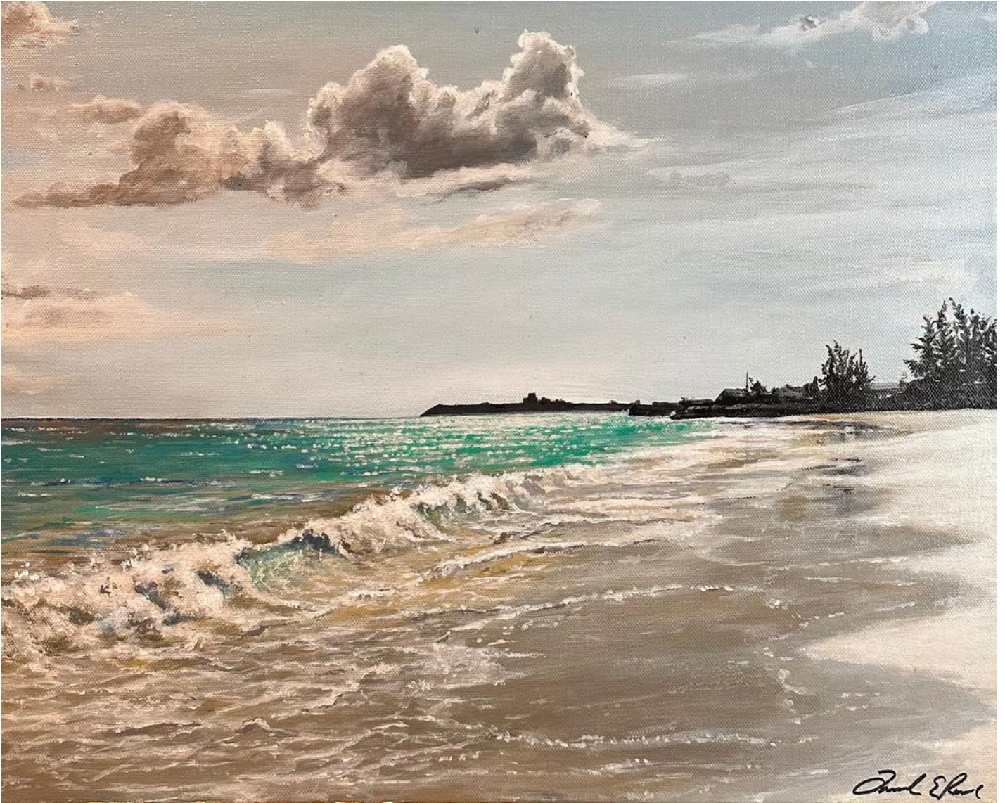
Frank Rock , Pirates' Cove , Acrylic on canvas, 20" x 16" ($300)