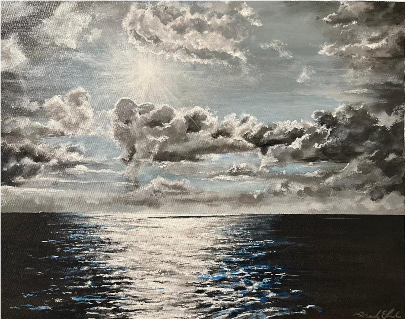
Frank Rock , We'll Meet Tomorrow , Acrylic on canvas, 20" x 16" ($150)