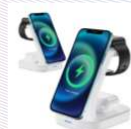
3n1 Wireless charging station – 74 AED (x300 count) Total 22,200 AED + 5% vat