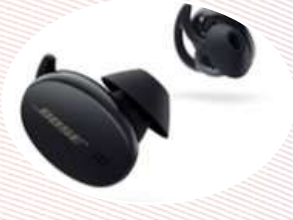
Bose Sports Earbuds