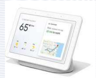
Google Home Hub Nest