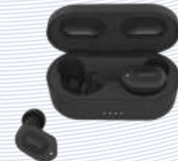
Belkin Wireless Earbuds- 105 AED (x300 count) Total 31,500 AED + 5% vat