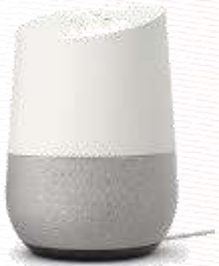
Google Home Speaker - 150 AED (x300 count) Total 45,000 AED + 5% vat