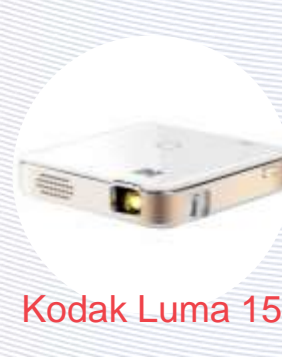
Kodak Luma 150