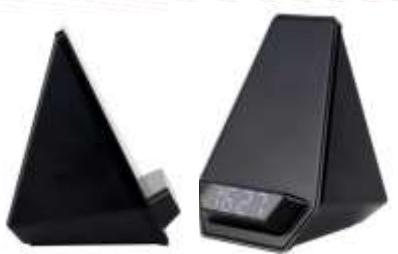
Clock Speaker & Wireless Charger- 64 AED (x300 count) Total 19,200 AED + 5% vat