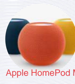
Apple HomePod Mini

*Please note that all products are to be purchased by you and sent to THN office prior to the event