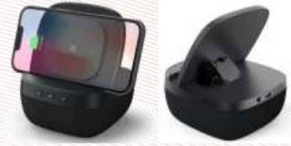
Wireless Charging Speaker- 95 AED (x300 count) Total 28,500 AED + 5% vat