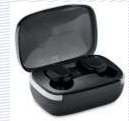
5.0 Tru Wireless Earbuds - 42 AED (x300 count) Total 12,600 AED + 5% vat