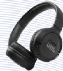
JBL Wireless Headphones - 133 AED (x300 count) Total 39,900 AED + 5% vat