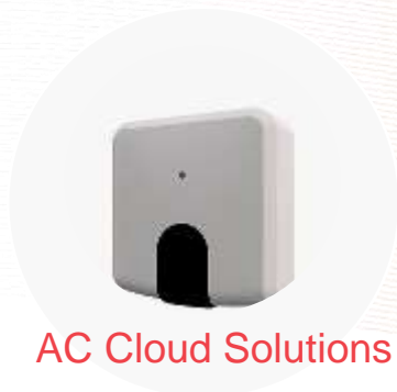
AC Cloud Solutions