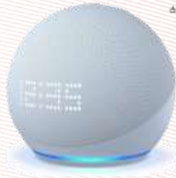
Amazon Echo Dot 5 th Gen- 280 AED (x300 count) Total 84,000 AED + 5% vat