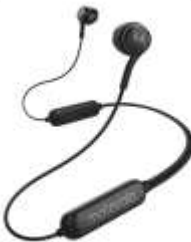
Wireless BT Earphones