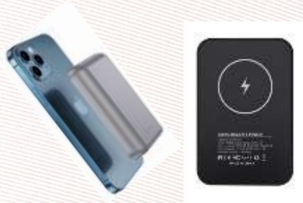
MagSafe Power bank- 57 AED (x300 count) Total 17,100 AED + 5% vat