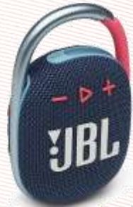
JBL GO 3 Portable Speaker - 125 AED (x300 count) Total 37,500 AED + 5% vat