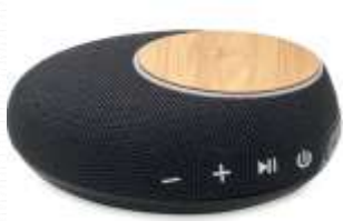
5.0 Wireless Speaker with wireless charger - 128 AED (x300 count) Total 38,400 AED + 5% vat