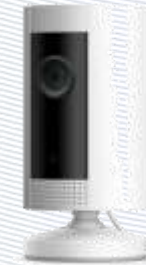
Amazon Ring Indoor Camera- 130 AED (x300 count) Total 39,000 AED + 5% vat