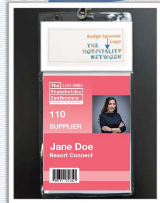
Sponsored Badge Example