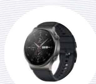
Watch GT 2