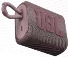
JBL Clip 4 Speaker - 172 AED (x300 count) Total 51,600 AED + 5% vat