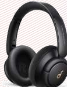
Soundcore ANC Headphones – 179 AED (x300 count) Total 53,700AED + 5% vat