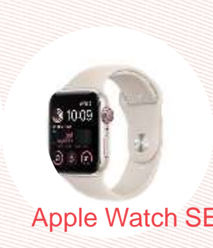
Apple Watch SE