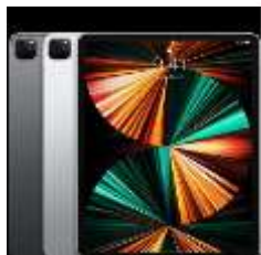
iPad Pro 12.9 inch

Below are some samples of the TSC2022 Raffle prizes sponsored by participating suppliers