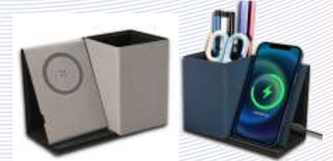
MagSafe Charger Stand - 70 AED (x300 count) Total 21,000 AED + 5% vat