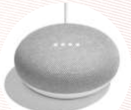
Google Home Nest Mini