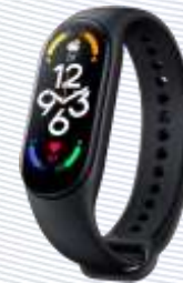
Redmi Smart Band 7- 105 AED (x300 count) Total 31,500 AED + 5% vat