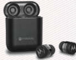
Motorola Buds 120 - 115 AED (x300 count) Total 34,500 AED + 5% vat