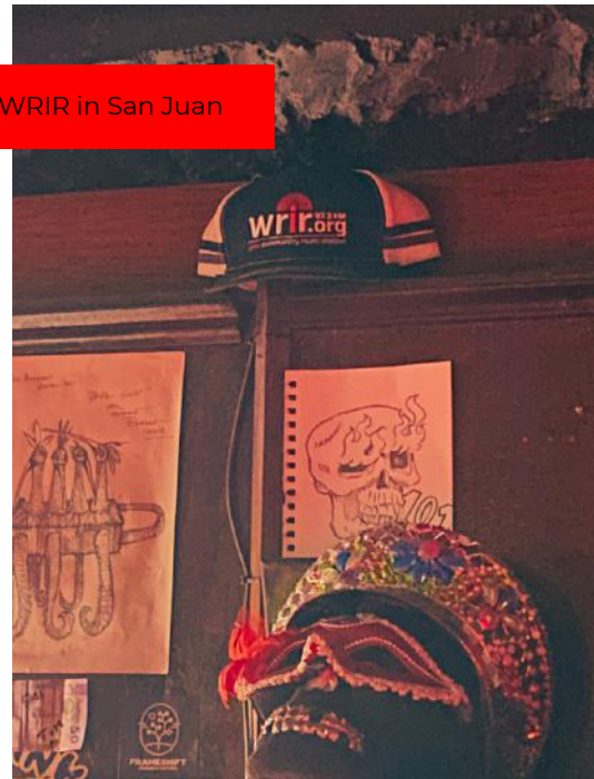
WRIR in San Juan