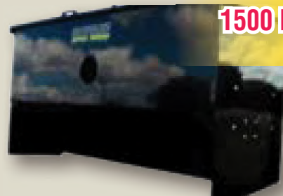
2024 Crownline Feeder Available In 3 Sizes 1,000 Lb., 1,500 Lb., 2,000 Lb.

$2,542 1500 Lb. Manual Chute $3,215 1500 Lb. Auto Chute