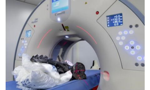
Uncovering the secret lives of dinosaurs