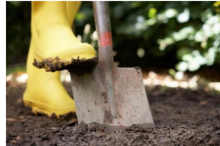
The Tiny Forests enchanting communities