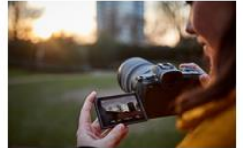
Student Development Programme