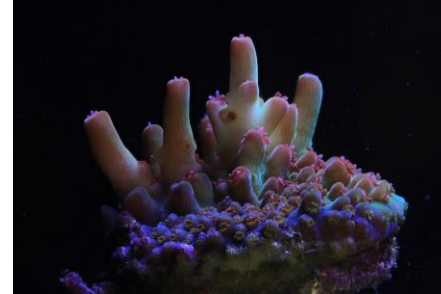
From commuter town to coral reef

Discover how our technology is used to inspire change with incredible stories from across the world.