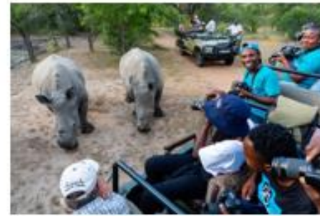
Young People Programme

We help to prepare people from a wide range of backgrounds across EMEA for the future by using our products, expertise and partnerships to empower them and help them grow.