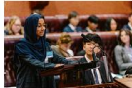
Canon Young Champion of the Year Award