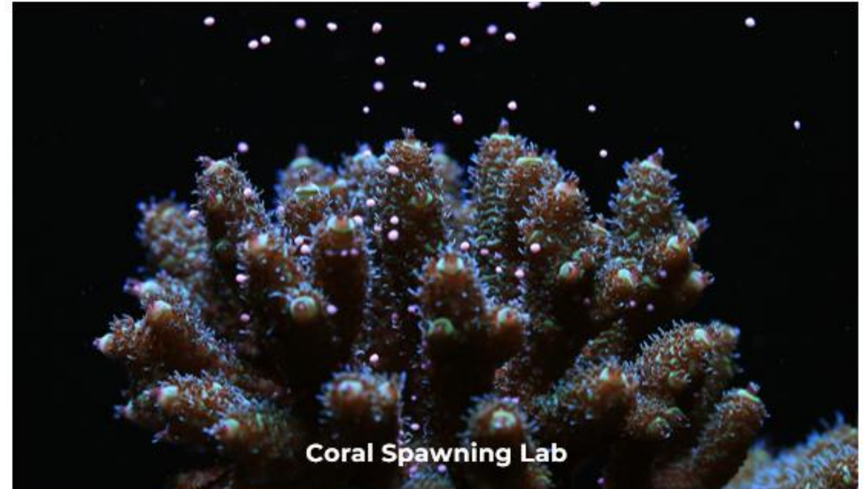
Coral Spawning Lab