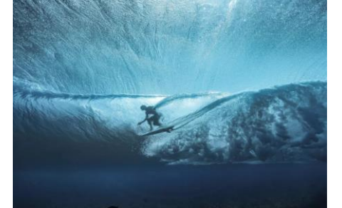
Let there be...Life