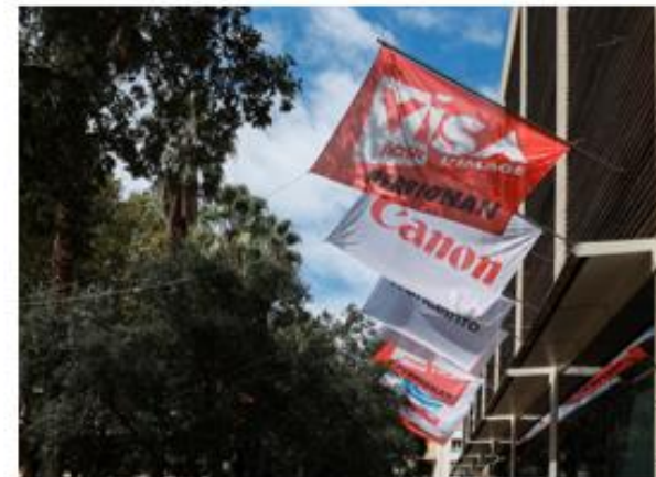
Visa pour l'image