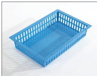
Baskets are available in 2 depths: 200 or 100mm.