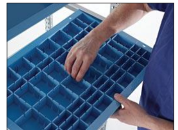
Baskets and trays can be subdivided as required.

For further information on Moresecure products, please contact your local distributor: