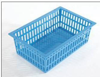
Solid base provides protection against spilled liquids and particles.

Trays are capable of withstanding temperatures of up to 85°C and can accommodate a maximum load of 20kgs.