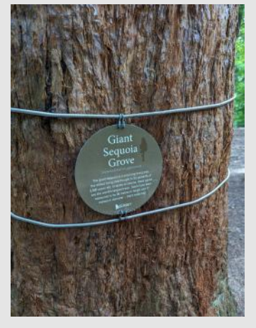
Tree at Redwood Park in Surrey, B.C. just north of the border which is another place for tree-lovers to visit.