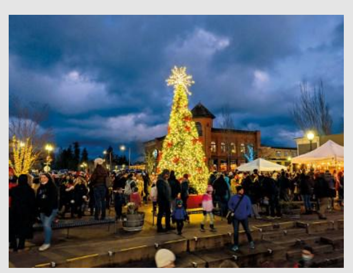
Blaine Holiday Harbor Lights

Holiday Harbor Lights – Saturday, November 30. Beloved tree lighting ceremony has 30 vendors, horse-drawn carriage rides, mini-train rides, middle school and high school bands and choir performances, coffee and warm pastries, and an indoor beer garden at the Blaine Senior Center.