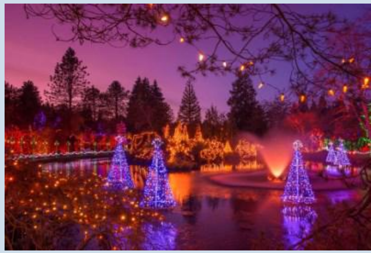
V an Dusen Festival of Lights

A true winter wonderland awaits you this holiday season at VanDusen Festival of Lights, where 15 acres of a beautiful botanical garden are adorned with over 1 million twinkling lights. Entry fee.