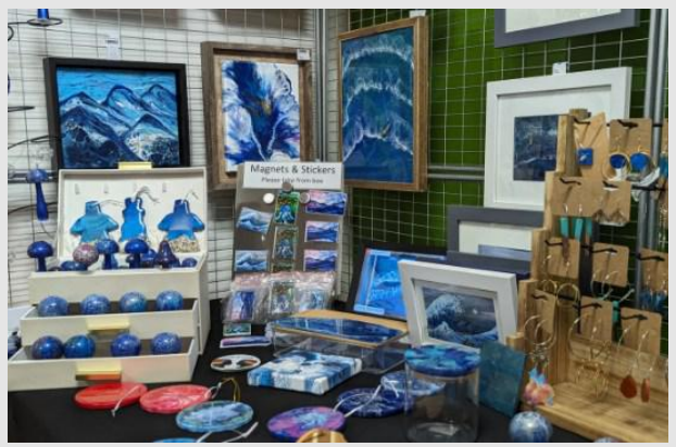
Holiday Festival of the Arts

A Whatcom County holiday tradition for 45 years! The Allied Arts of Whatcom County Holiday Festival of the Arts is an indoor and online, 5 week-long festival featuring over 100 artisans from our region. Aside from vendors selling their wares, the festival boasts live music, workshops for children and artists demonstrating their craft.