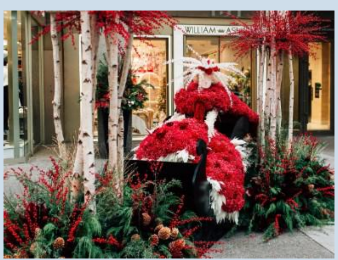
Fleurs de Villes NOEL

Walk from the dark of winter and through the Labryrinth of Light, or take a workshop to create your own lantern as part of the 30<sup>th</sup> Annual Winter Solstice Lantern Festival, presented by the Secret Lantern Society.