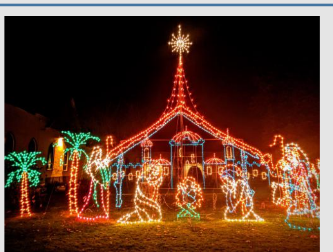
Lynden Lighted displays through the holidays.

program consists of holiday musical classics including "It's the Most Wonderful Time of the Year," "Rudolph the Red Nosed