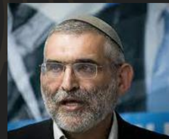
Michael Ben-Ari, member of the Knesset