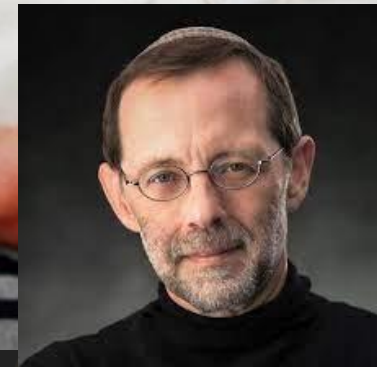
Moshe Feiglin, the founder of Israel's right-wing Zehut Party