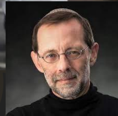
Moshe Feiglin, the founder of Israel's right-wing Zehut Party