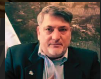
Zionist Ambassador in Aotearoa NZ