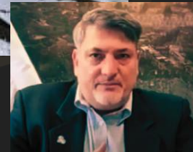
Zionist Ambassador in Aotearoa NZ