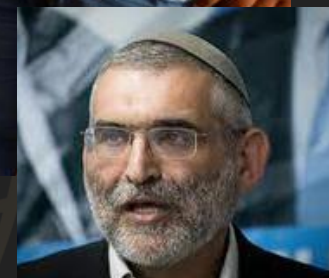
Michael Ben-Ari, member of the Knesset