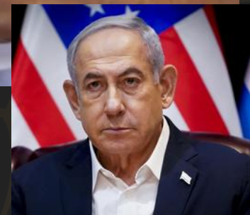
The Butcher of Gaza