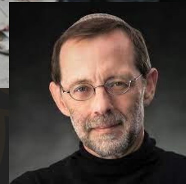
Moshe Feiglin, the founder of Israel's right-wing Zehut Party