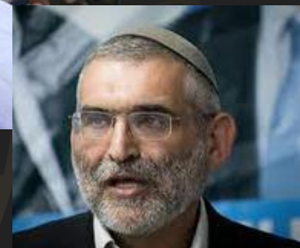
Michael Ben-Ari, member of the Knesset