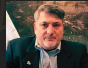
Zionist Ambassador in Aotearoa NZ