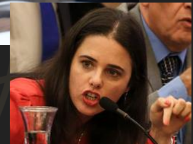
Ayelet Shaked, Former Minister of Justice