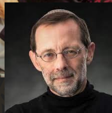
Moshe Feiglin, the founder of Israel's right-wing Zehut Party