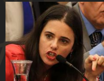
Ayelet Shaked, Former Minister of Justice