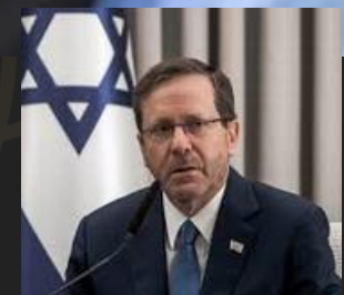
President Isaac Herzog