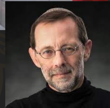
Moshe Feiglin, the founder of Israel's right-wing Zehut Party