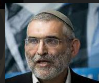
Michael Ben-Ari, member of the Knesset