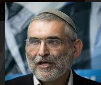
Michael Ben-Ari, member of the Knesset