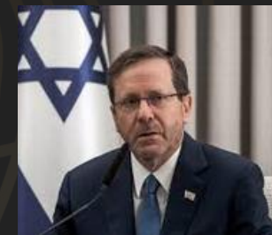
President Isaac Herzog