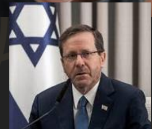
President Isaac Herzog