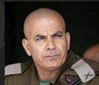
Maj. Gen. Ghassan Alian