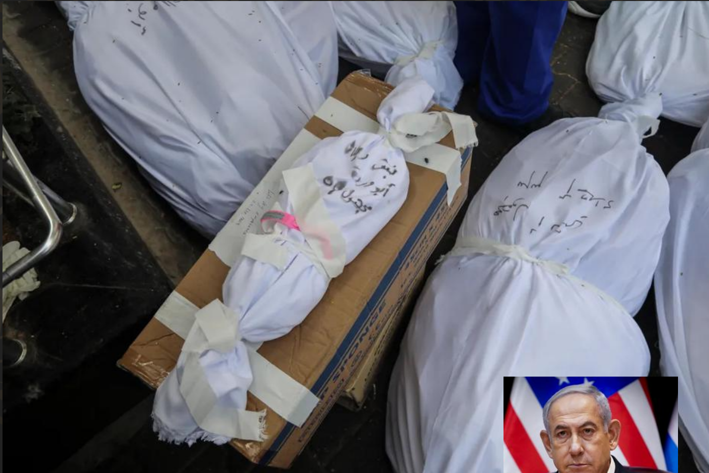
The Butcher of Gaza