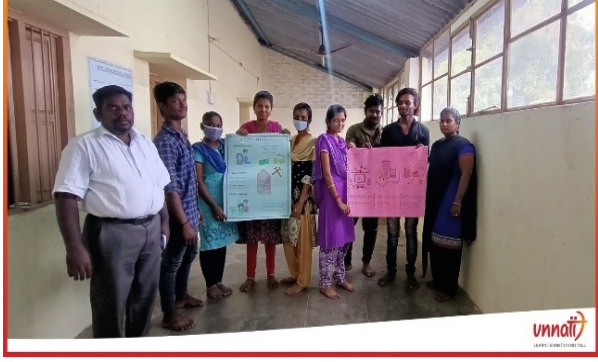
UNNATI's Chidambaram Center: UNNATI's Dindigul Center