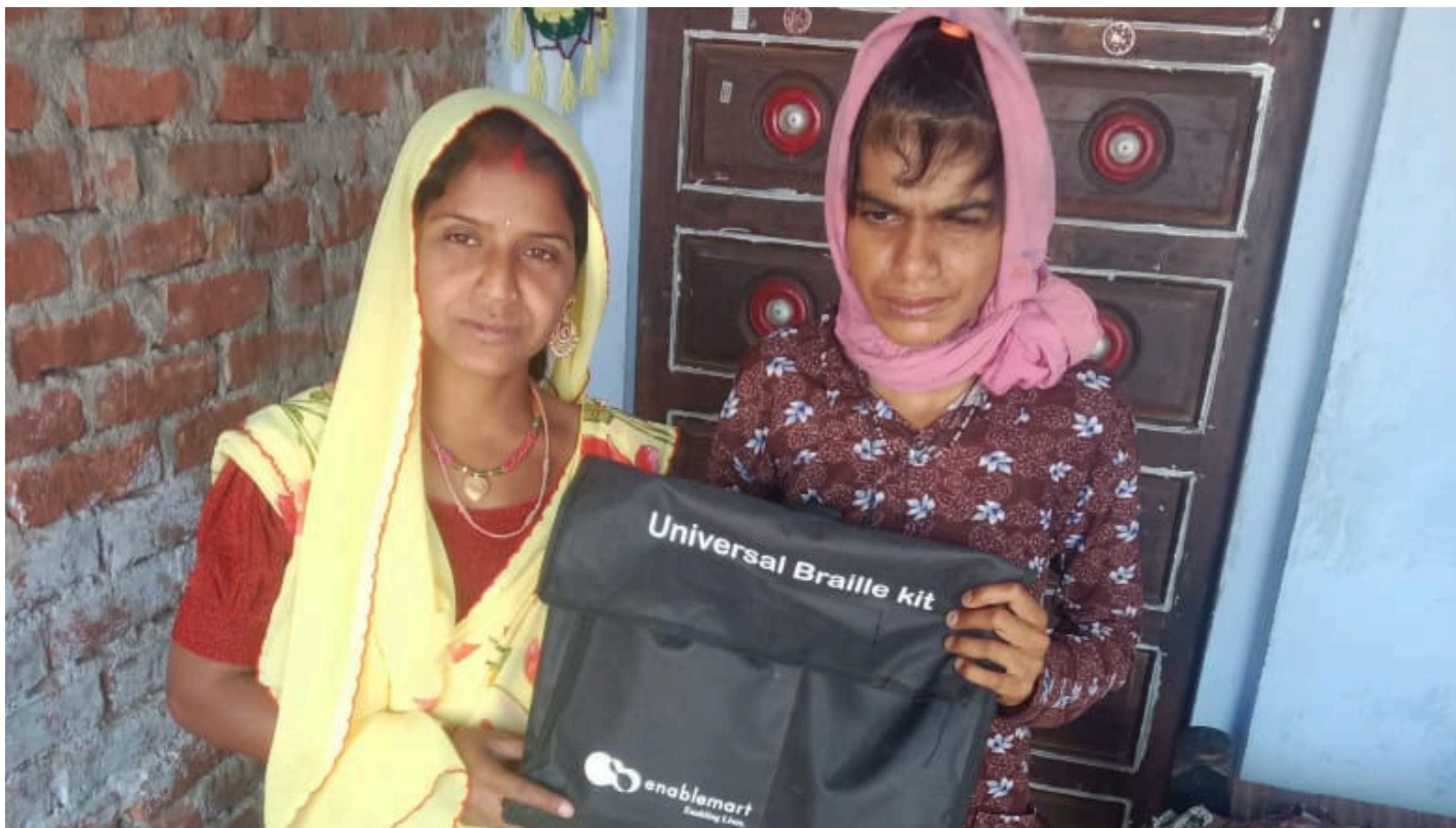
Braille kit distributed to our students in Rajasthan.