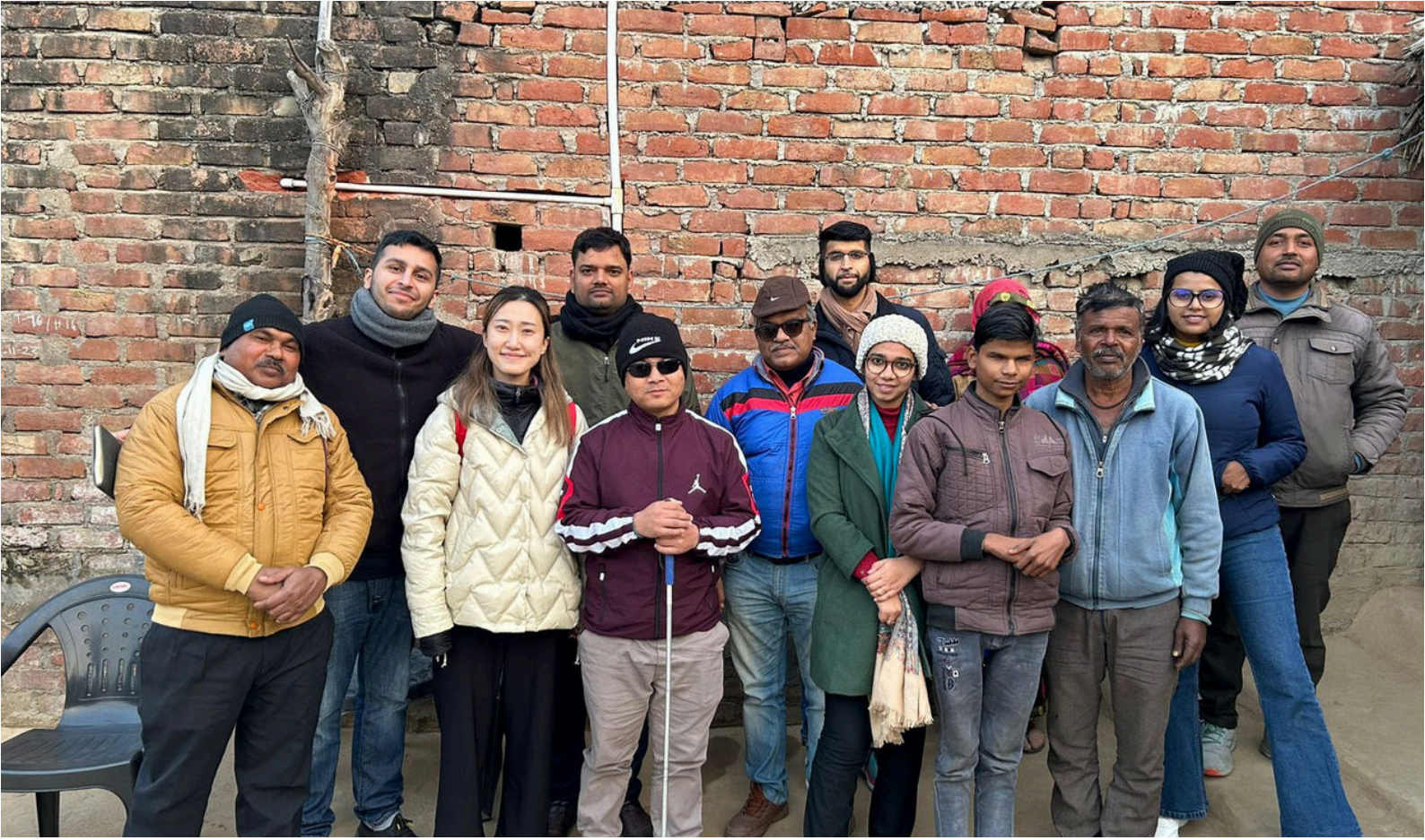
NYU cohort visit the children from Arunodaya program in Auriya, Uttar Pradesh.