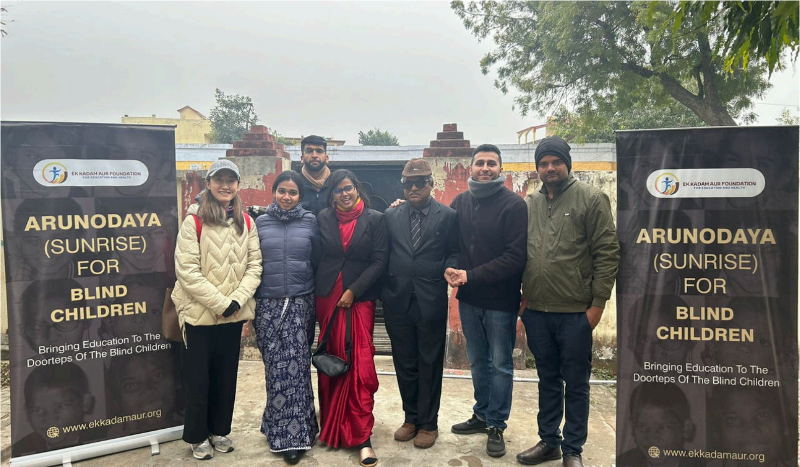
NYU capstone interns with the leadership team of Ek Kadam Aur.