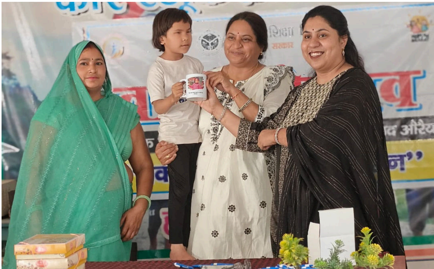
Students receiving prizes during the graduation day.