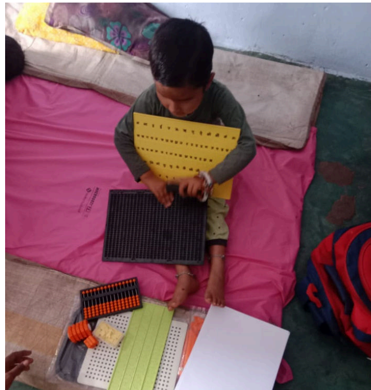
Children practicing Braille and the Abacus.

These collaborations bolster our outreach efforts, enabling us to identify and support more children with blindness in Rajasthan while reaffirming our commitment to inclusive education for all.