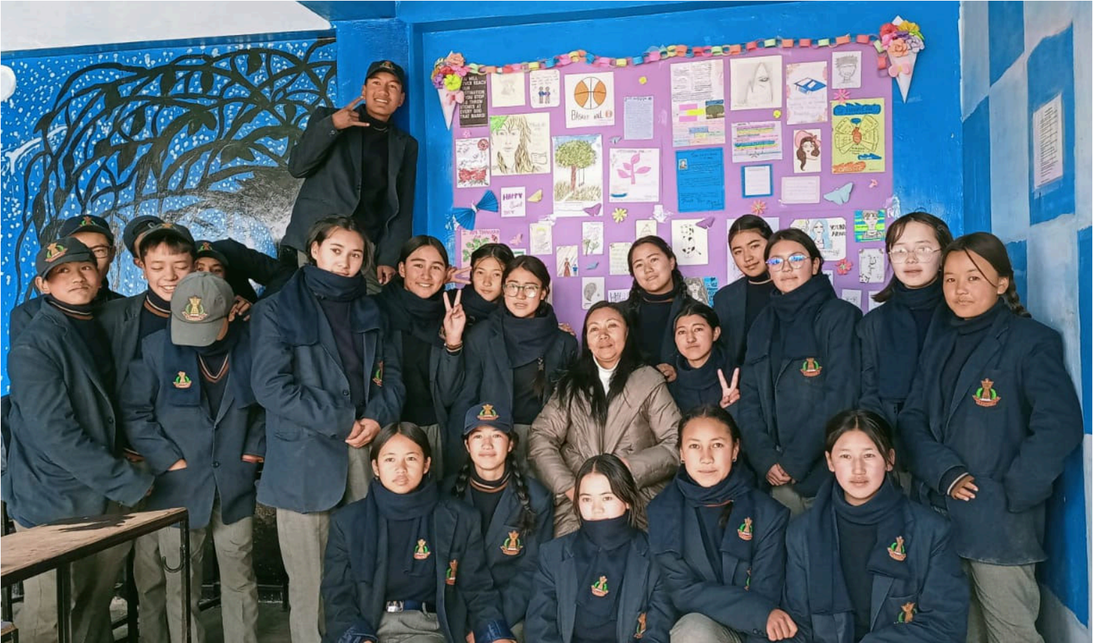
HSLP students from Lamdon Model Senior Secondary School, Leh, Ladakh.