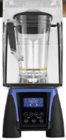
Sound Proof Blender