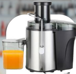
1L. Stainless Steel Electric Juicer