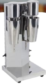
Double-head Milk Shake Machine