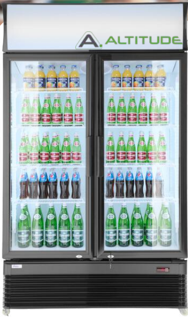
Upright Beverage Cooler

Visit our website for more info www.pkce.com.fj