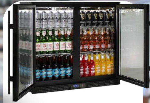
Undercounter Back Bar