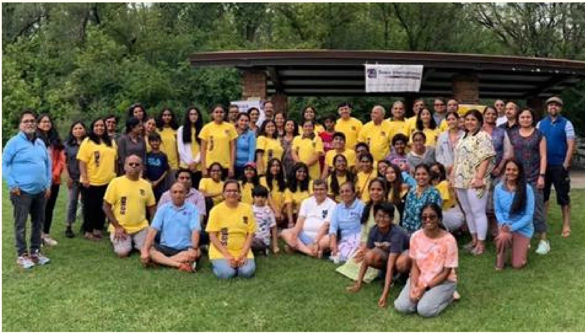
Sewa Chicago volunteers at the Busse Woods preserved forest

Sewa International's Chicago Chapter organized a picnic on September 4 in the scenic Busse Woods, a 3,700-acre preserved forest in Cook County's Elk Grove Village.