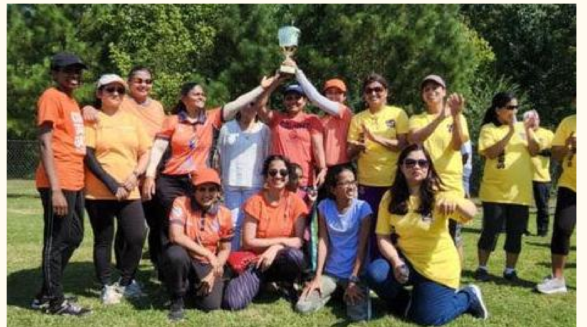
Winning team with the trophy