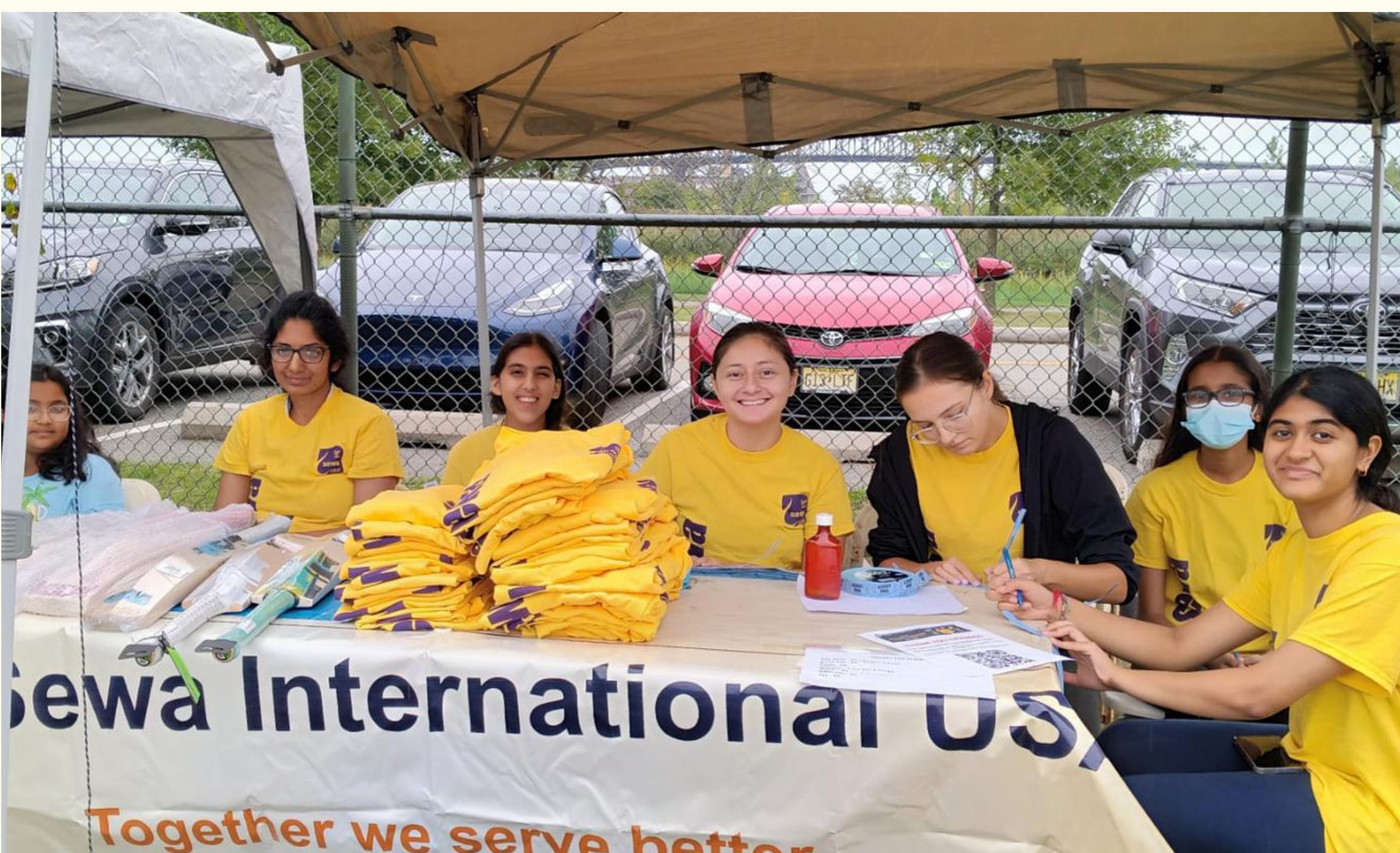
Sewa volunteers recording cricket score

It is a tradition of 12 years started by Sewa International New York Metro and passed on to the North Jersey Chapter in support of the Sponsor A Child (SAC) program, conducted over the weekends immediately after Labor Day. With the help of Sewa volunteers, Get Inspired & LEADs interns, participants, and supporters, Sewa could organize such a fun-filled event.