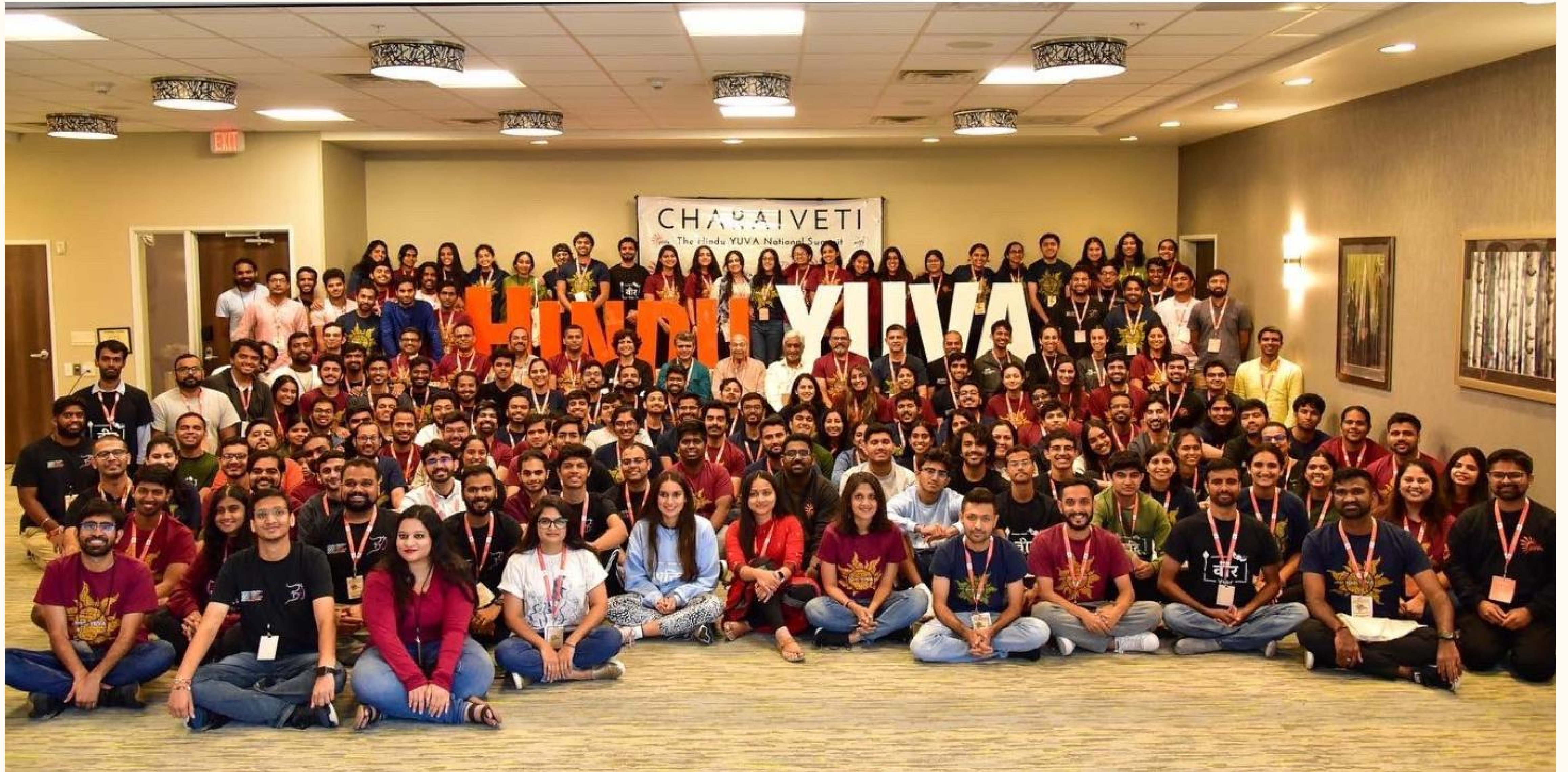
A picture of the participants at the Hindu YUVA Summit held in Chicago, Illinois.