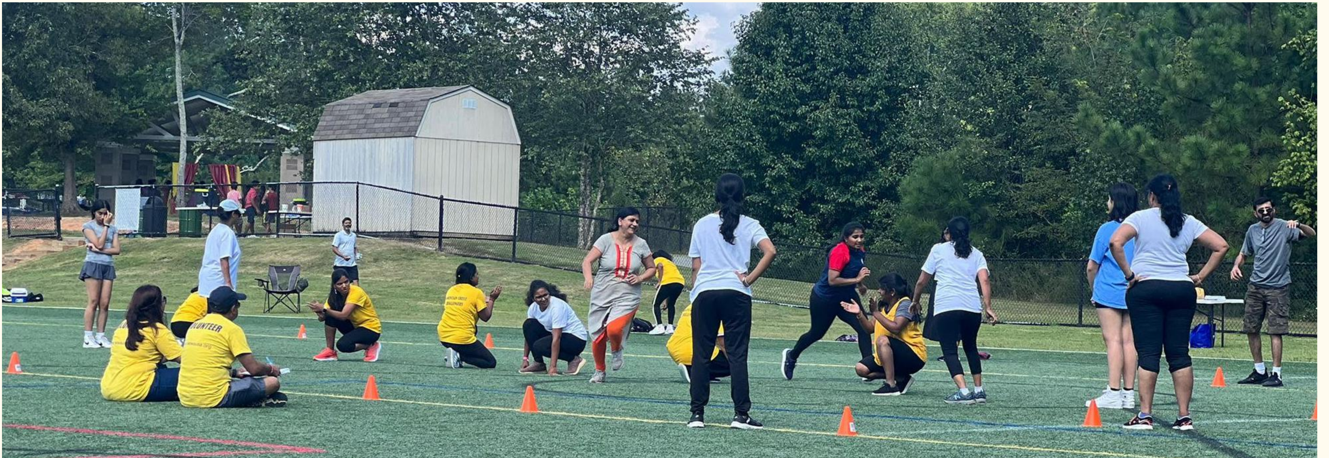
Participants involved in playing Kho-Kho at Fowler Park in Cumming, GA

The Atlanta Chapter of Sewa International organized Women's Cricket & Kho-Kho competitions on September 18 at Fowler Park in Cumming, Georgia. Six cricket and four kho-kho teams participated in the tournament. The Firebirds team won the Cricket Championship, and the Mountain Crest Challengers won the Kho-Kho Trophy.