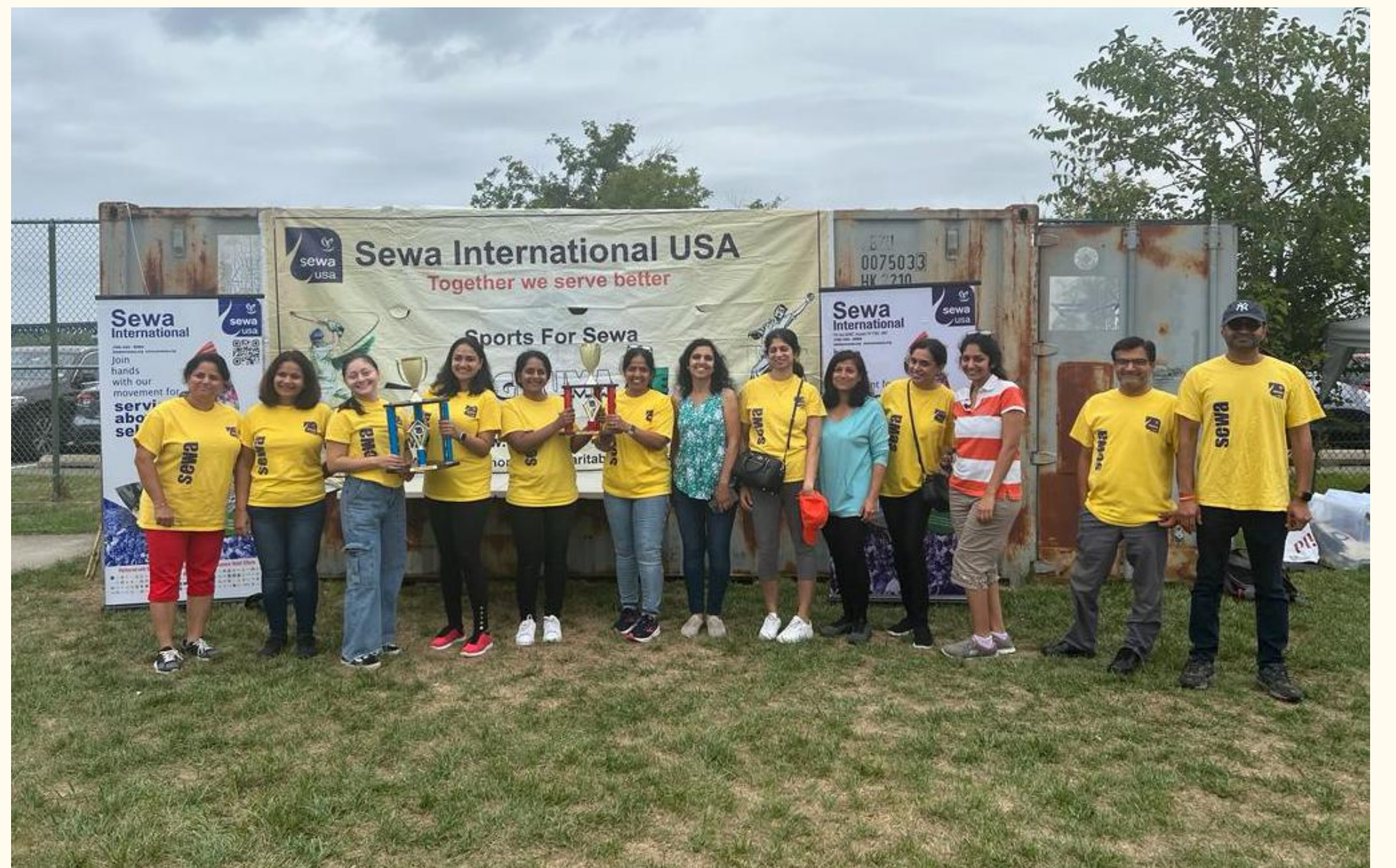
The winning teams with the trophies