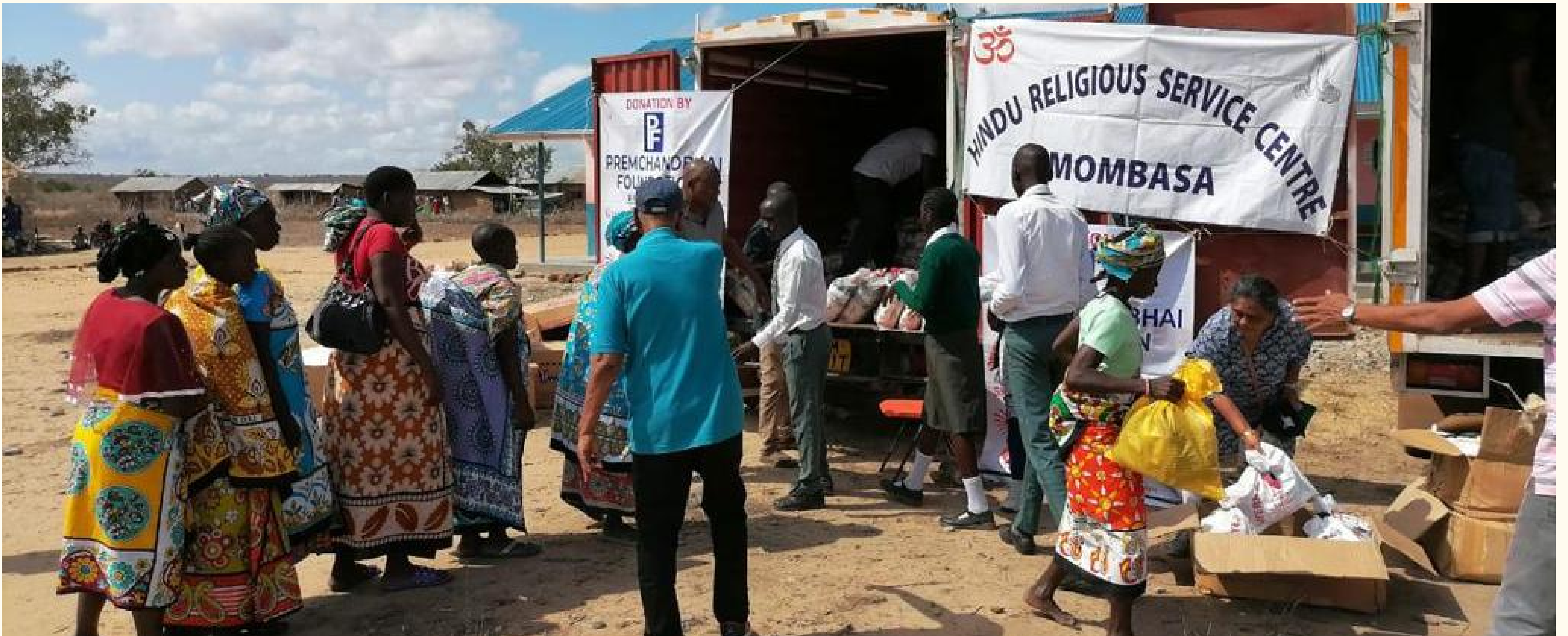
Volunteers from Sewa's partner organizations distributing food grains in Kenya

Sewa International has contributed $10,000 towards drought relief efforts in Kenya. It has also started a social media campaign to raise $100,000 for food distribution.