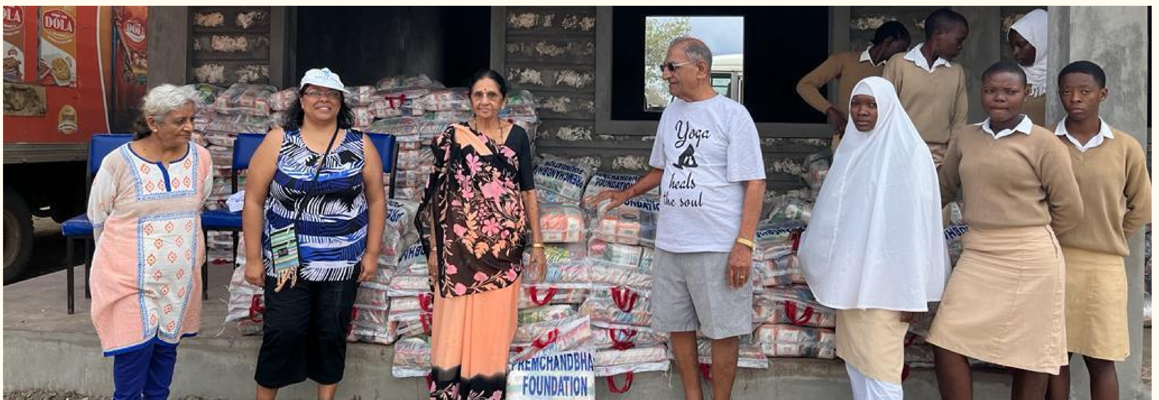
Volunteers from Sewa's partner organizations standing in front of food items stocked for distribution

The agency says that in 2022, the drought situation worsened in 20 of the 23 counties in Kenya's Arid and Semi-Arid Lands (ASAL). The agency also said over 755,000 children under five and about 103,000 pregnant women are malnourished. By some estimates, nearly 1,500 people die of hunger each day in drought-hit East Africa.