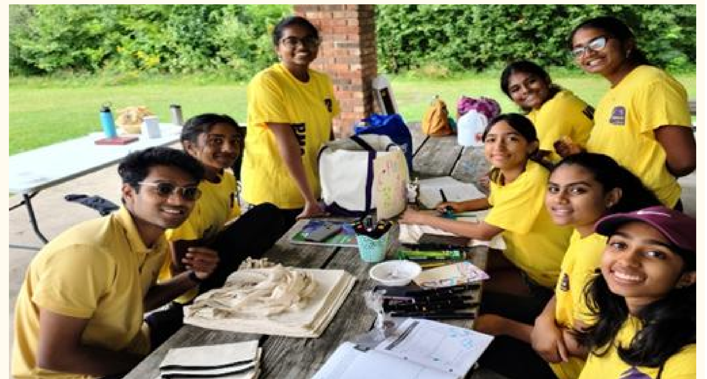
Sewa youth volunteers in a discussion

A few parents of the LEAD volunteers shared their experiences. They thanked Sewa for giving them volunteering opportunities in several areas. At the picnic, volunteers organized games, talent shows, baked goods sales, plant sales, face painting, and henna designs on hand.