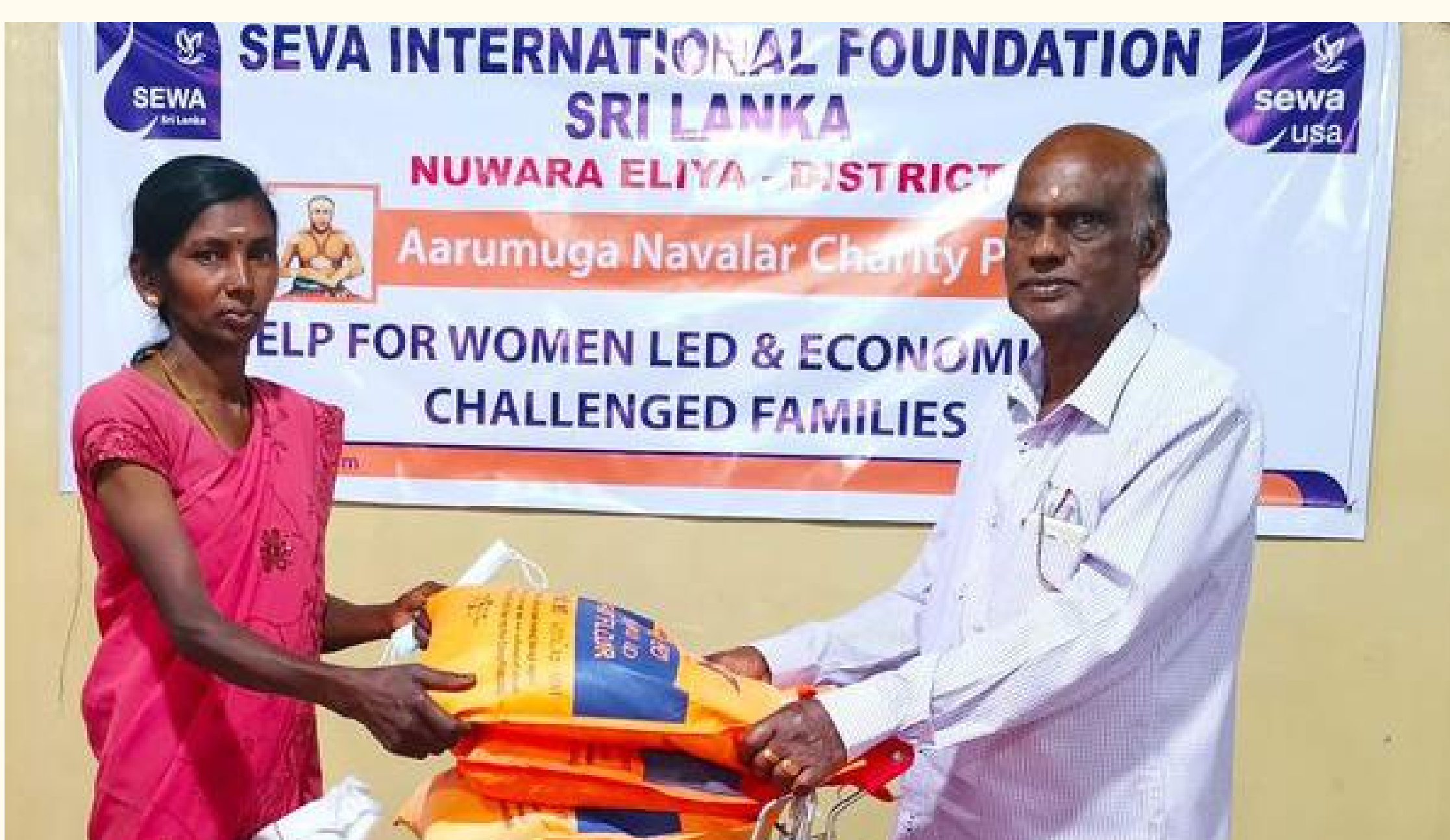
A beneficiary is receiving a bag of grains in Sri Lanka.

Sri Lanka has been in severe distress since the beginning of this year due to the economic hardship caused by the Ukrainian war and other global factors. Daily power blackouts and shortages of fuel and other essential goods have made life difficult in this island country. As a result, thousands of families live in harsh and stressful conditions. Sewa International is working with its partner organization, the Arumuga Navalar Charity Project, to distribute food and other essential supplies in Sri Lanka. In the first phase, Sewa has provided a month's worth of groceries to 500 economically challenged families in the Nuwara Eliya district. Sewa is targeting to assist 10,000 families soon and requests donors to help Sri Lankans in need.