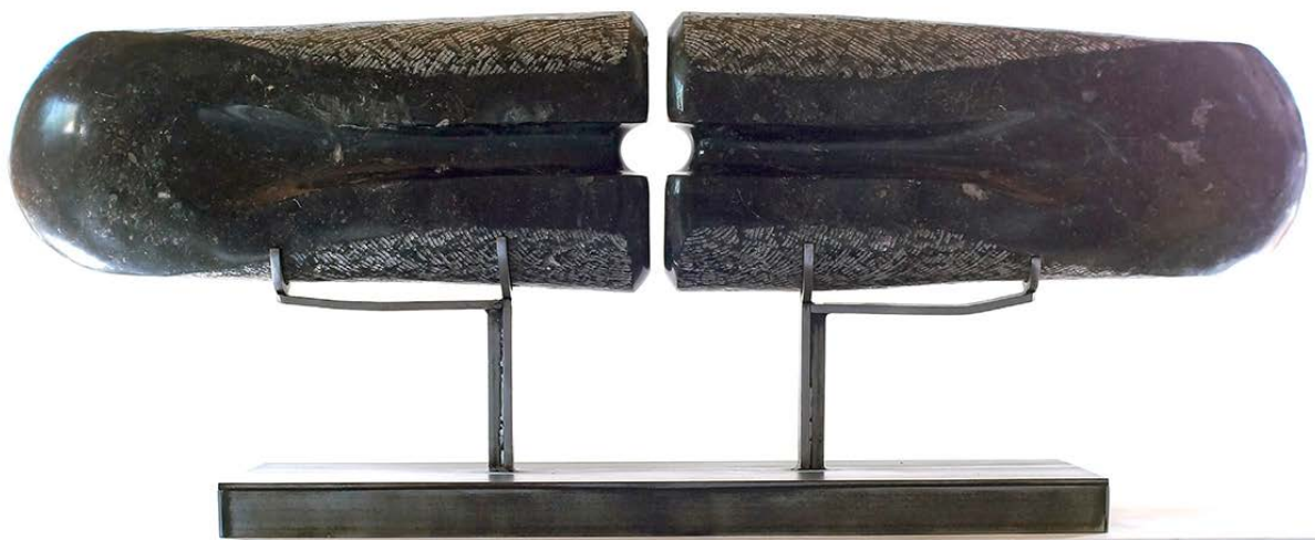
EMBRACE marquina marble on steel H 50 x W 120 x D 45 cm