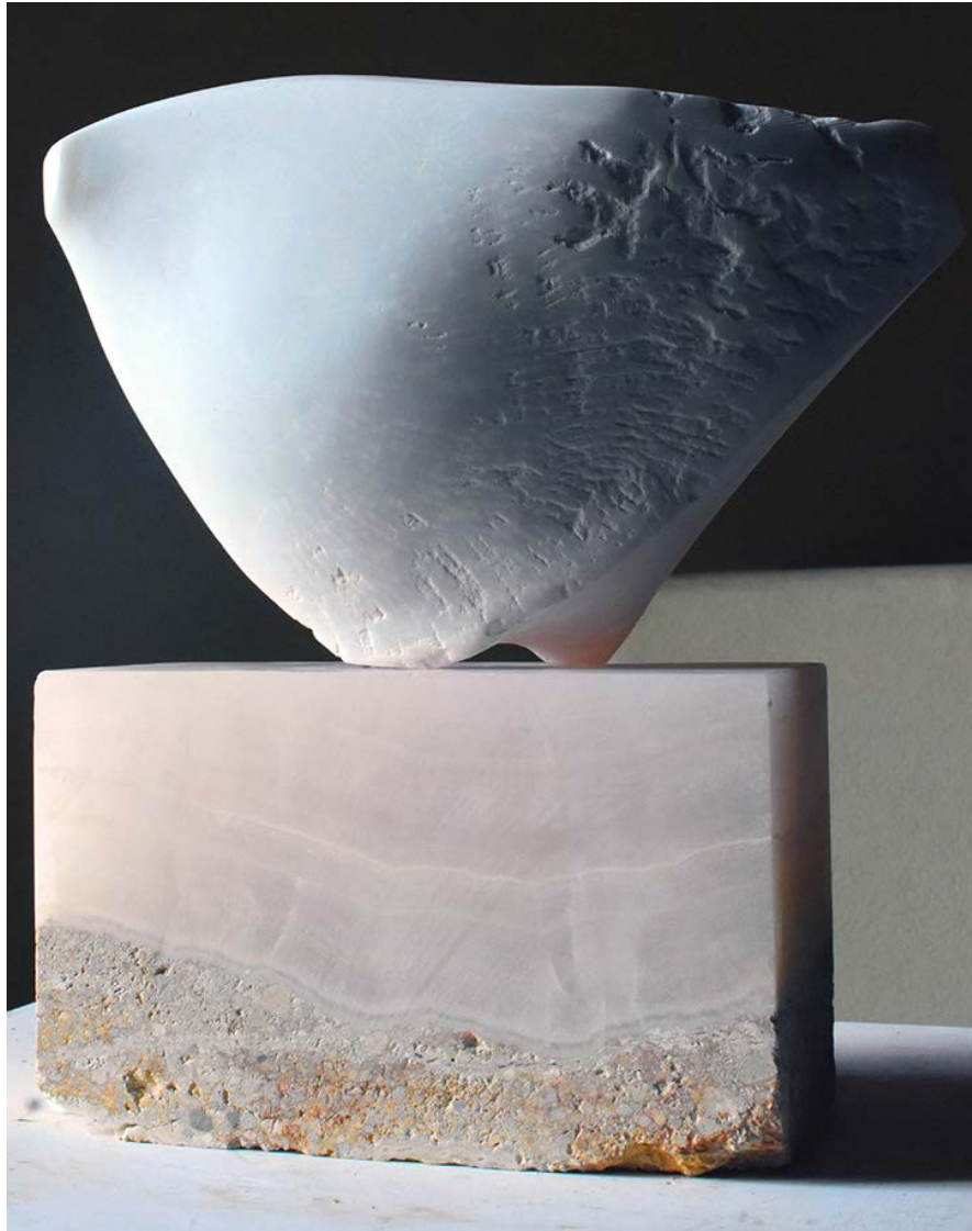
BIRD SONG white carrara statuario marble and pink onyx H 30 x W 26 x D 15 cm