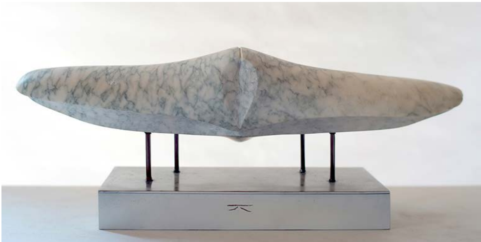
SEA SWELL french verde marble on steel H 21 x W 54 x D 18 cm