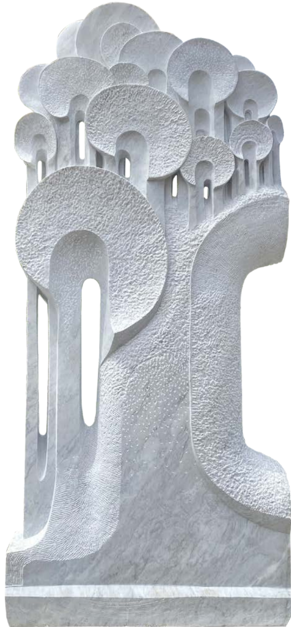
PORTAL carrara marble H 260 X W 117 X D 55 cm