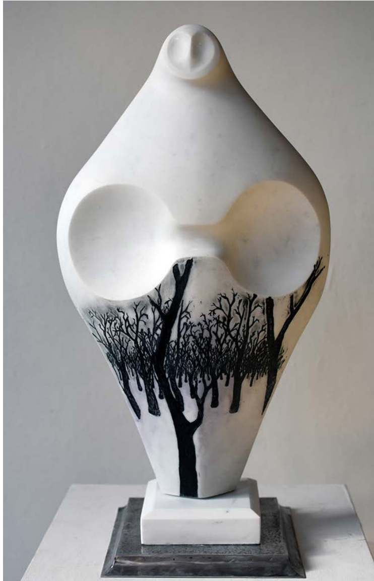
WINTER carrara marble, acid etching and ink H 61 x W 31 x D 23 cm