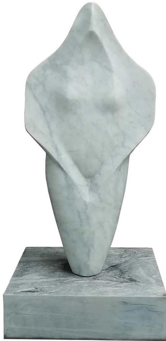
DONNA VENUS carrara marble H 108 x W 52 x D 40 cm