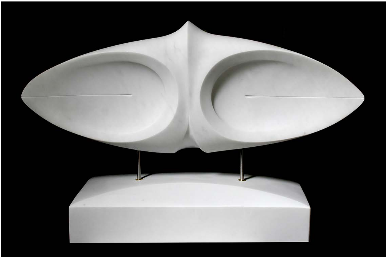
BREATHE white carrara marble H 43 x W 67 x D 22 cm