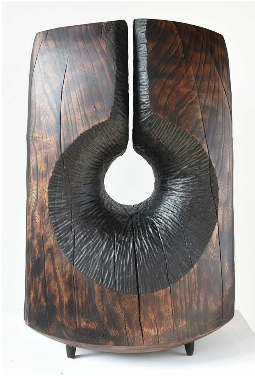
VOID burnt walnut wood H 69 x W 45 x D 29 cm