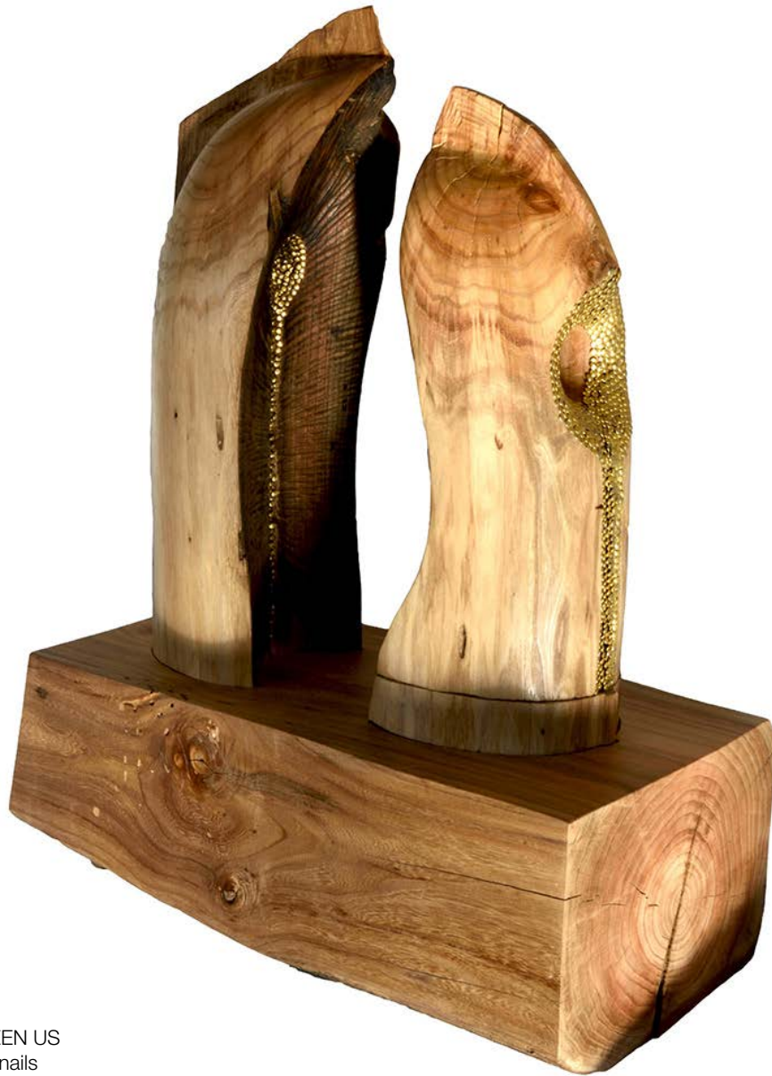
THE SPACE BETWEEN US walnut wood, brass nails H 90 X W 80 X D 30 cm