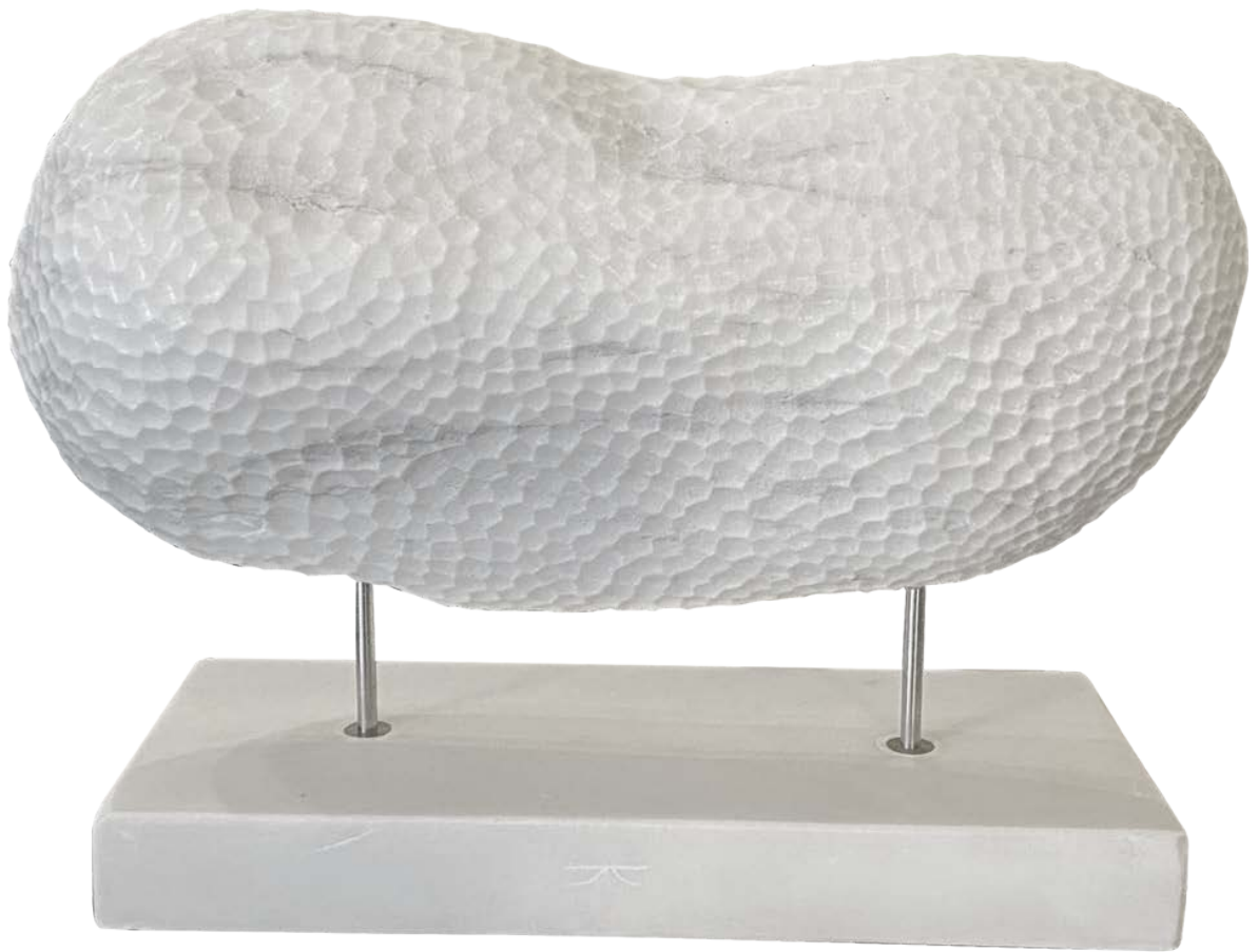
THE RIVER ROCK white carrara marble H 25 x W 28 x D 16 cm