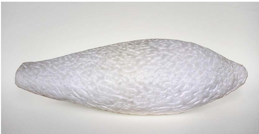
ESSENCE hand sculpted white carrara marble H 43 x W 18 x D 13 cm