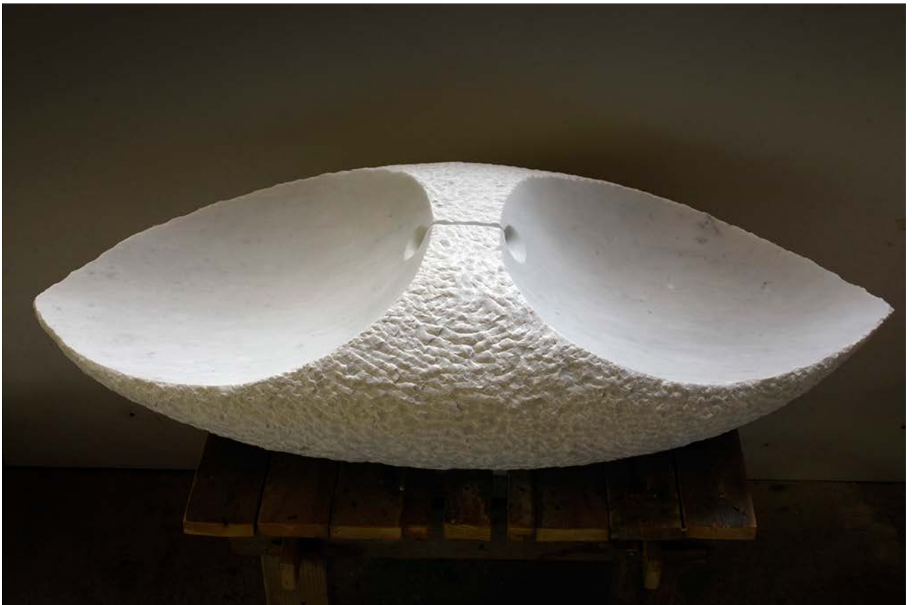
MOMENT hand sculpted white carrara marble H 25 x W 107 x D 48 cm