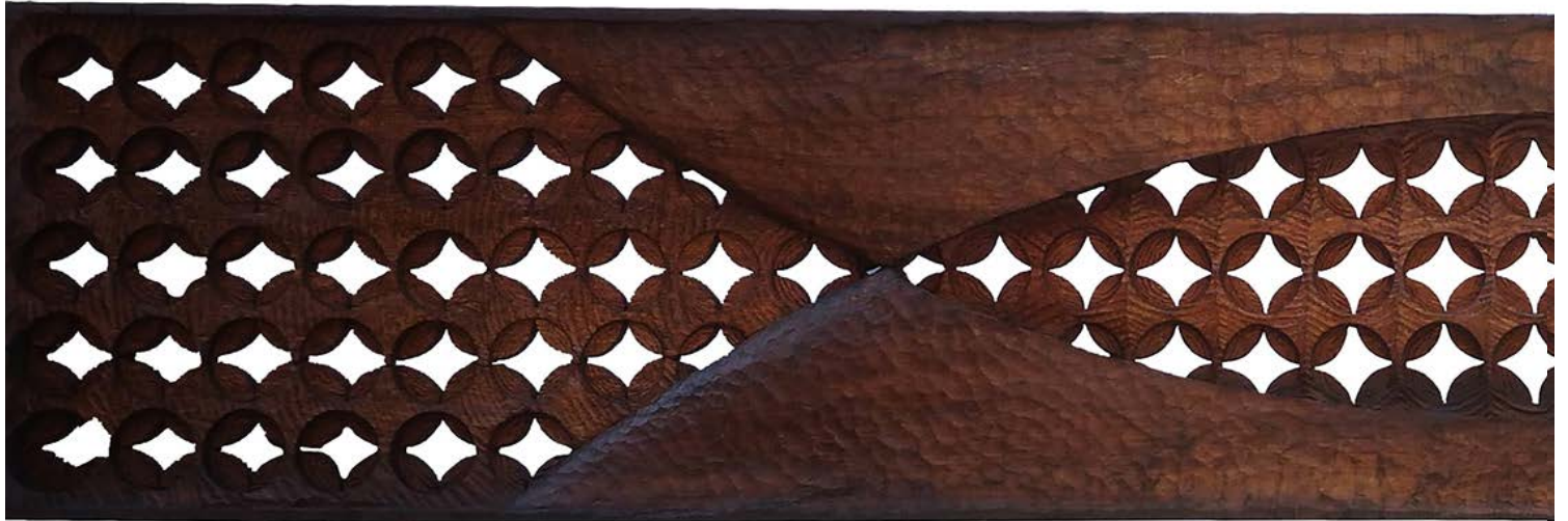
CREATION iroko wood H 50 x W 300 x D 10 cm