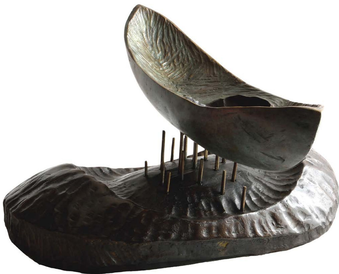
CANOE LAKE bronze edition of 8 H 35 x W 58 x D 30 cm