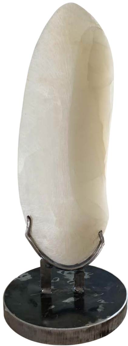
MOONLIGHT yellow onyx on steel H 49 X W 21,5 X D 21,5 cm