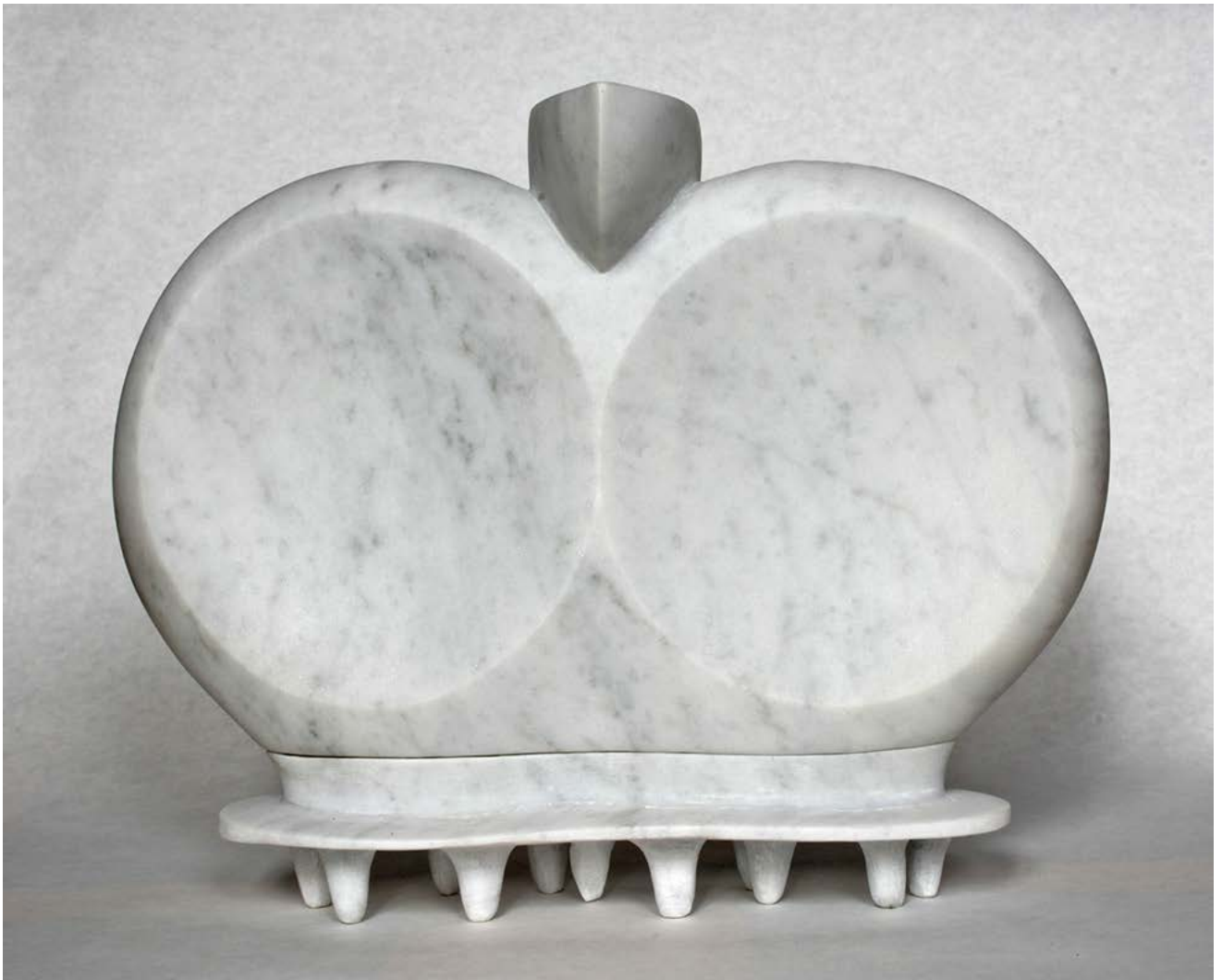
THE DREAMING carrara marble H 31.5 x W 40 x D 13 cm