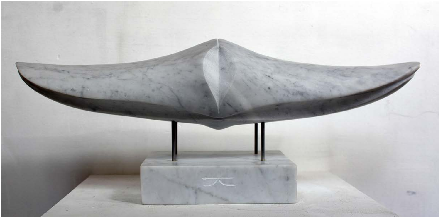
WINGS carrara marble H 21 x W 54 x D18 cm