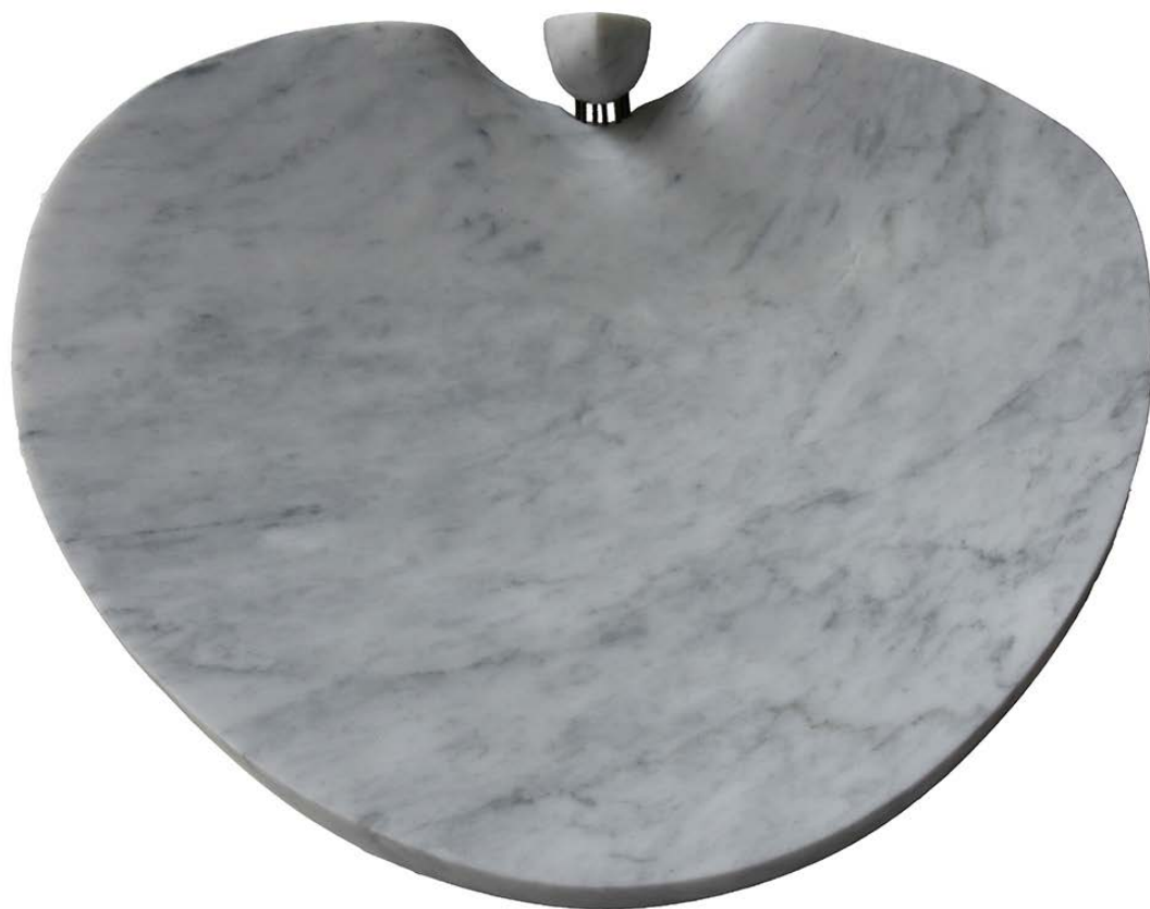
CONFLUENCE carrara marble H 35.5 x W 49.5 x D 63 cm