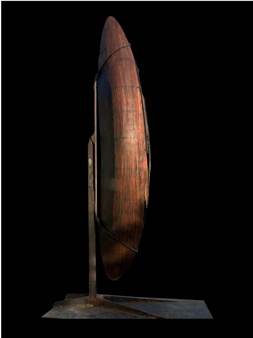
SEED mahogany, fiberglass, and steel H 650 X W 142 X D 249 cm