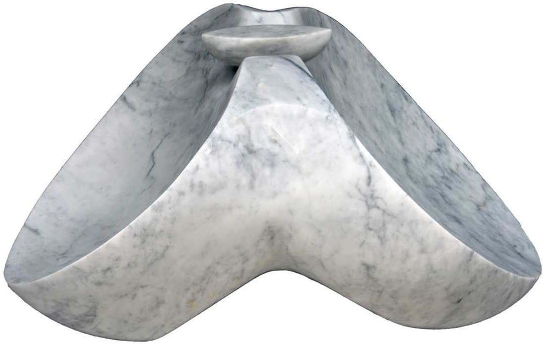
CONFLUENCE carrara marble H 35.5 x W 49.5 x D 63 cm