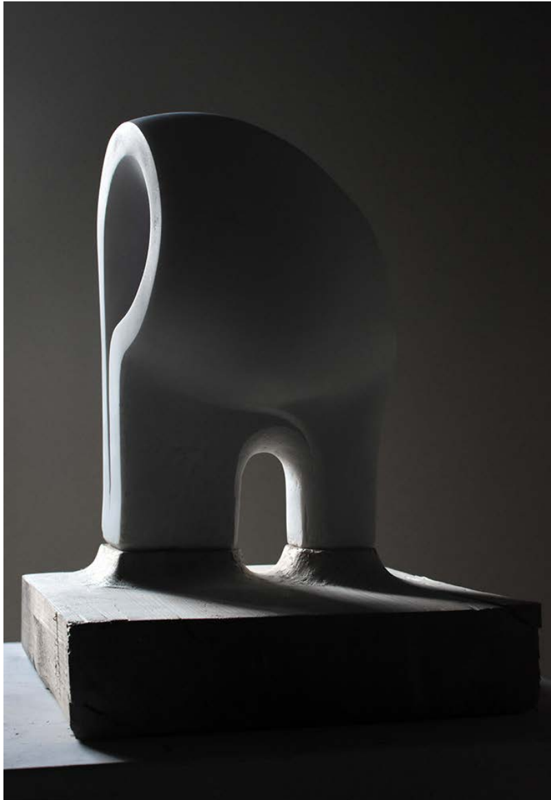
HILLTOP white statuario marble H 38 x W 29 x D 28 cm