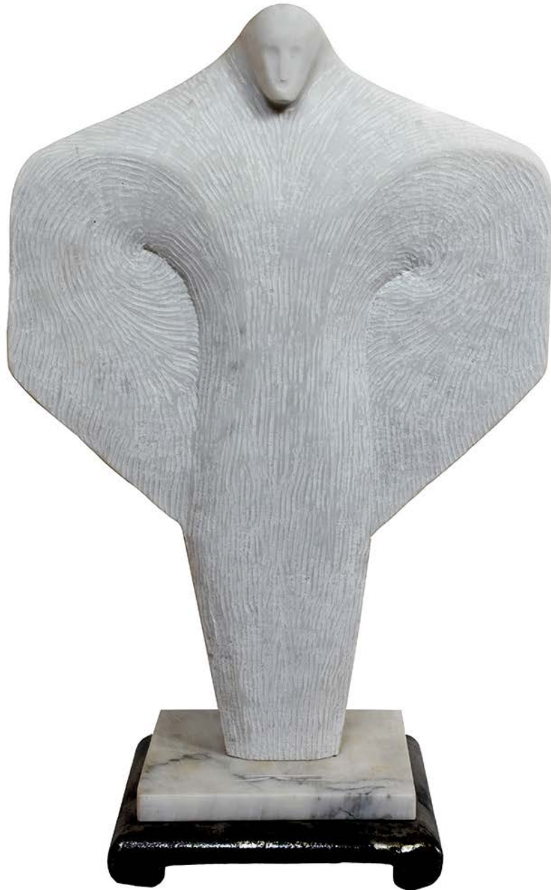
WIND carrara marble H 64 x W 40 x D 26 cm