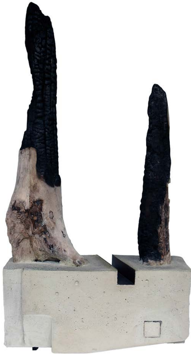
THE SPACE BETWEEN US #2 cast cement, steel, burn drift wood H 54 x W 103 x D 23 cm