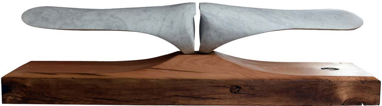
SEA WIND carrara marble, chestnut wood H 118 x W 32 x D 30 cm