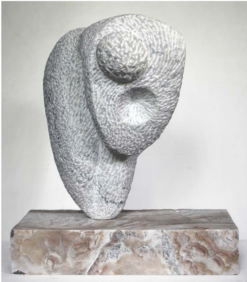
THE BATHER hand sculpted white carrara marble H 57.5 x W 65 x D 25 cm