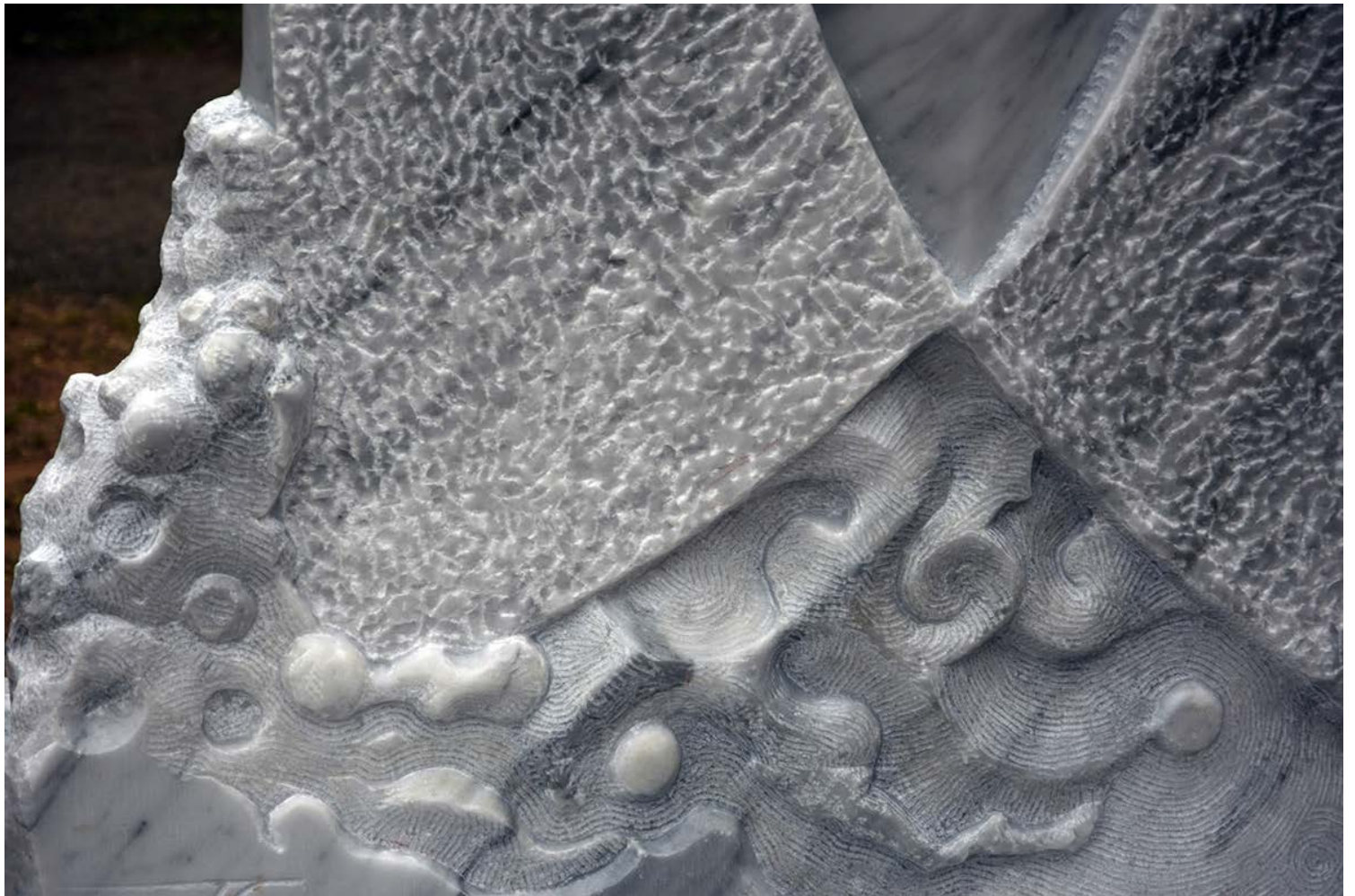
EMERGENCE carrara marble H 230 x W 110 x D 40 cm

Created for the Leonida Estate art collection, Tuscany, Italy.