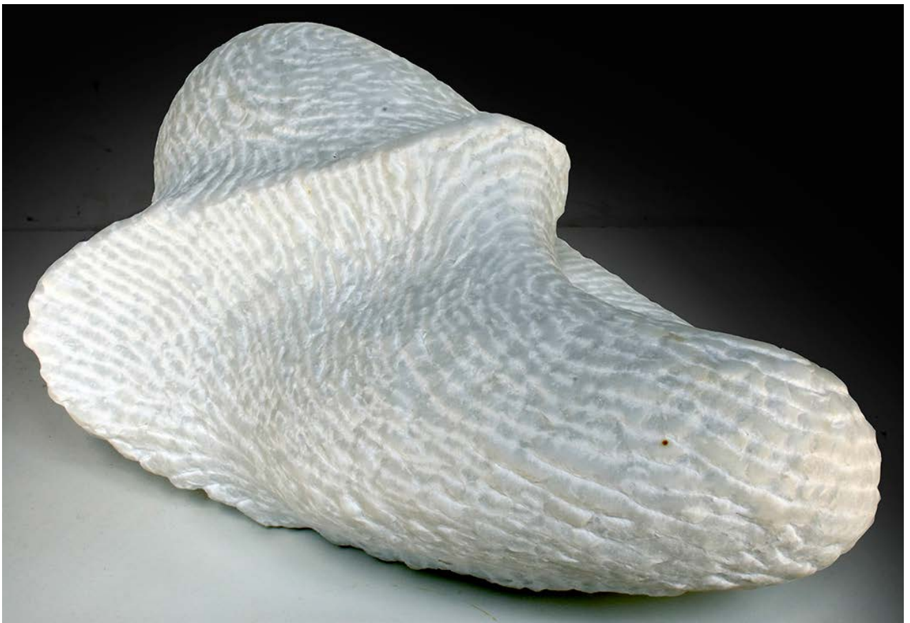
INFINITELY YOU - INFINITAMENTE TU hand sculpted white carrara marble H 51 x W 35 x D 27 cm