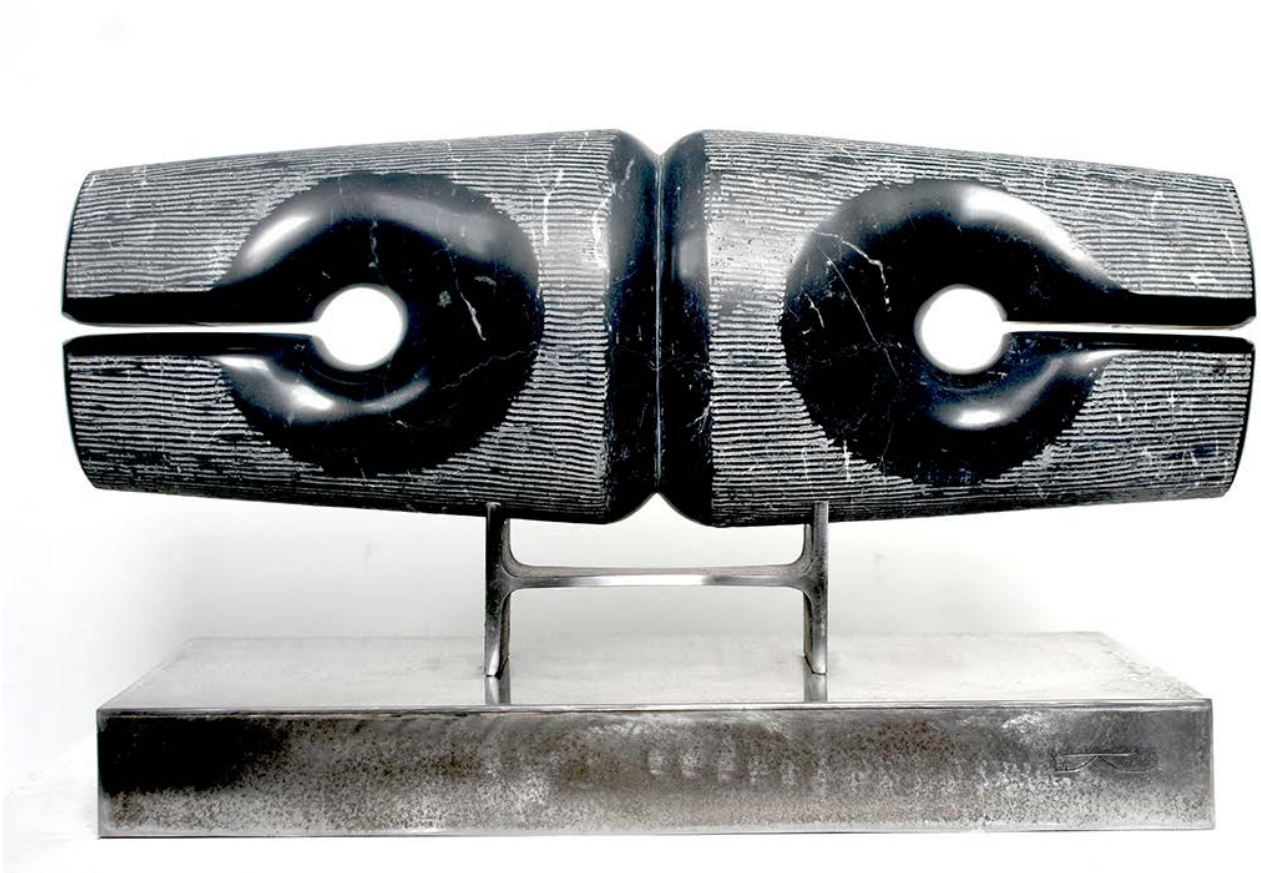
PERCEIVING THE BULL marquina marble on steel H 32 x W 66 x D 23cm