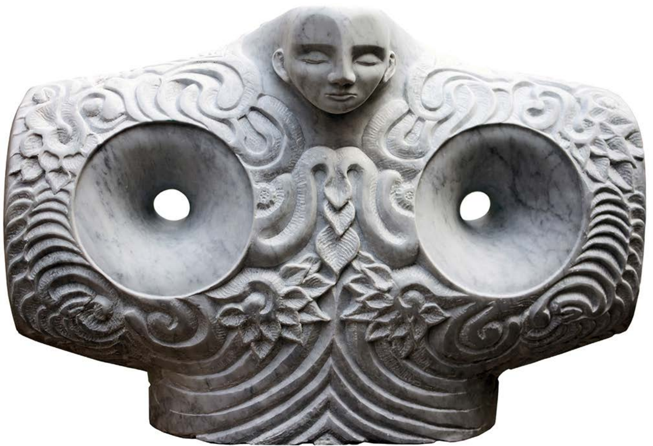
ASCOLTARE carrara marble H 64 x W 84 x D 35 cm