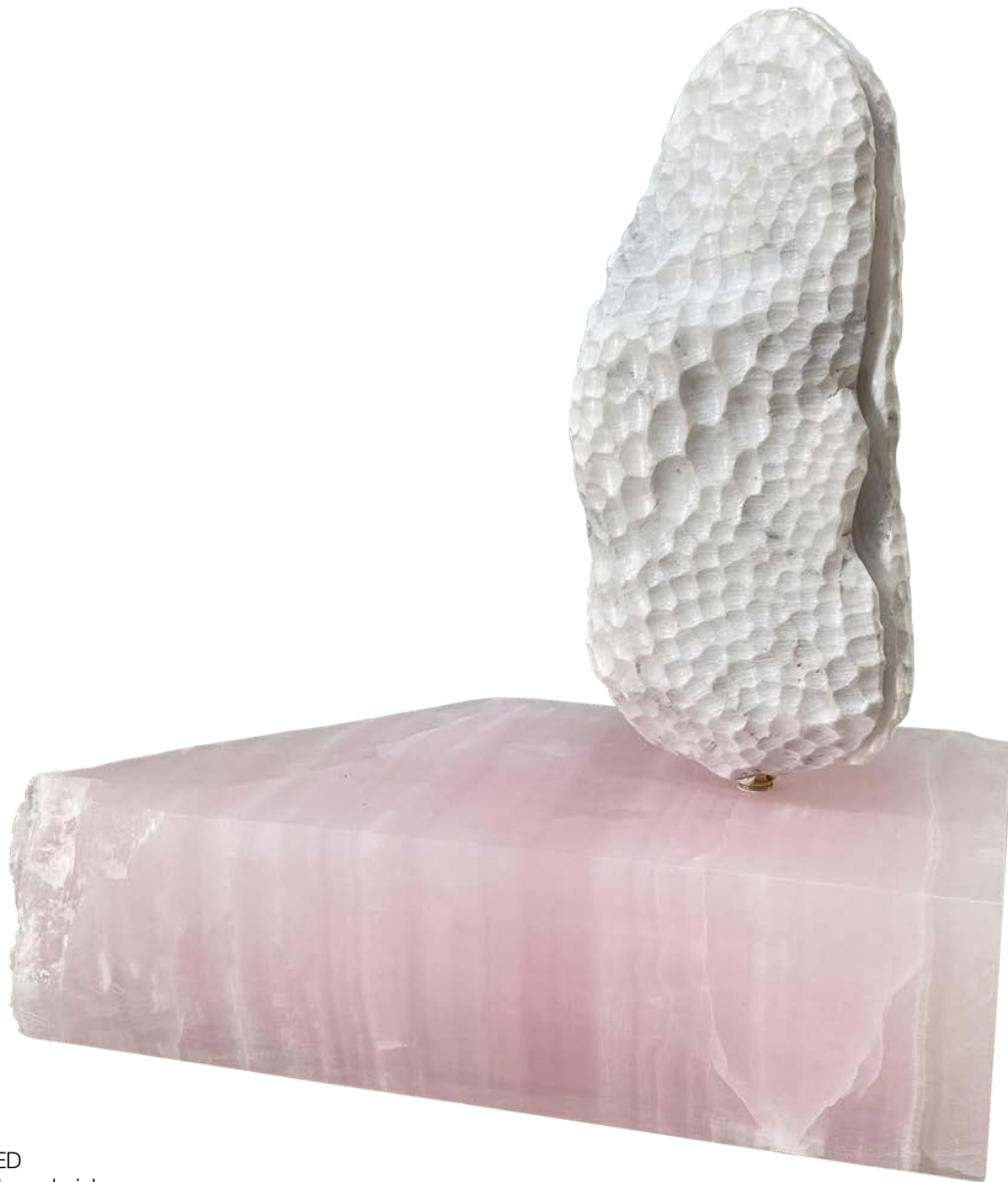
COSMIC SEED carrara marble and pink onyx H 44 X W 33 X D 17 cm