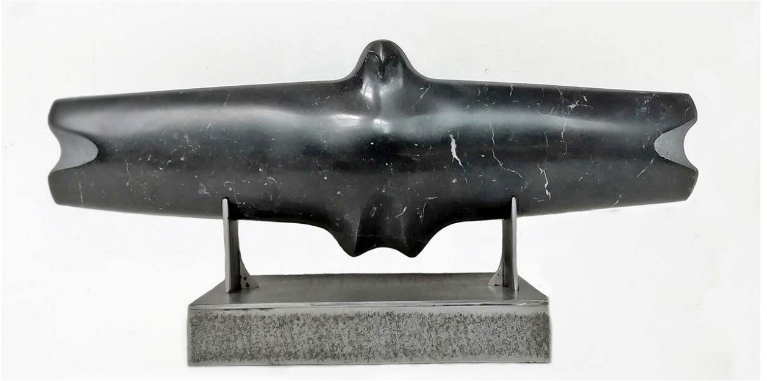
FLIGHT marquina marble on steel H 25 x W 40 x D 20cm