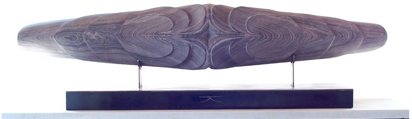
IL NOSTRO ABBRACCIO tobacco brown marble on steel H 31 x W 114 x D 30 cm