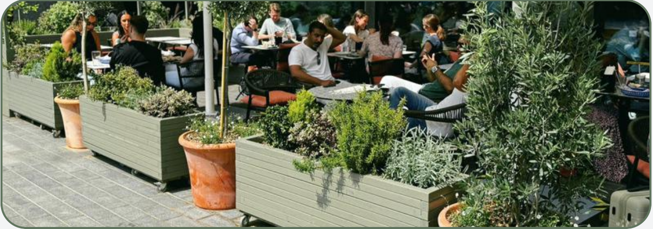
Pots & Planters