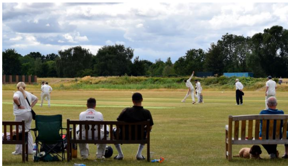
Barnaby Dun v Barnsley Woolley Miners