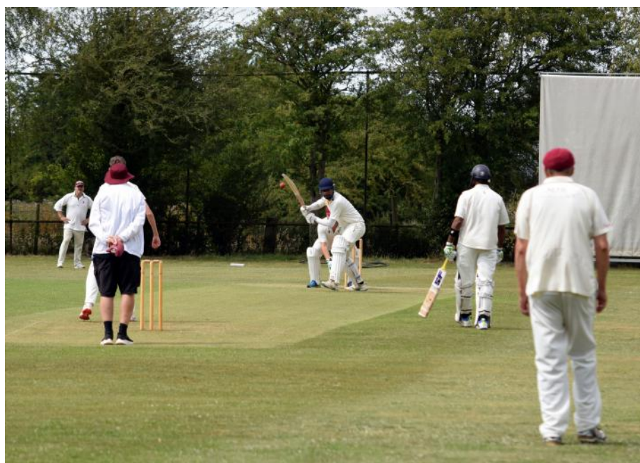
Fishlake 2 v Waverley 2