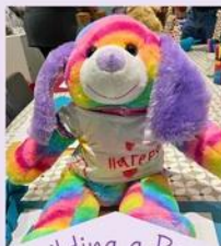
Building a Bear!