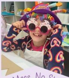
No Mess. No Stress!