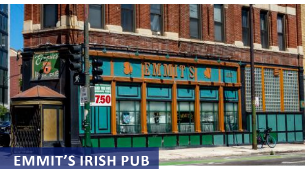
EMMITT'S IRISH PUB