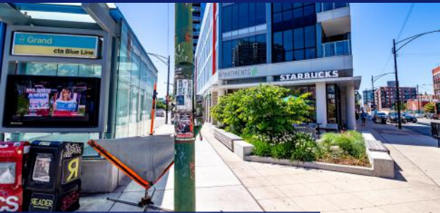
CTA BLUE LINE & STARBUCKS