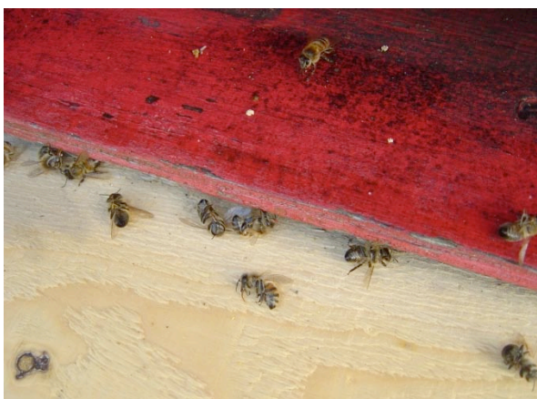
Observation of the hive in the early morning : dead bees in front of the hive entrance

So far, the impact of this chronic exposure to contaminated food and water sources on bees and their colonies has been completely ignored in safety assessments. Only acute toxicity, considered as the adverse effects of a pesticide resulting either from a single direct exposure (or from multiple exposures in a short space of time, usually less than 24 hours), and in certain cases the toxicity for larvae has been evaluated. In addition, the methodologies used to assess the impact on adult bees and the colony as a whole do not take account of the long-lasting presence of pesticides in the environment.