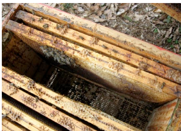
Suspected case of Colony Collapse Disorder : bees have abandoned the hive.

Secondly, the ICPBR's proposal failed to include an evaluation the chronic toxicity of pesticides 15 . Instead, it proposed measuring the toxic effect only if the pesticide shows problems in the short-term (acute toxicity).