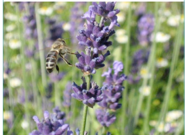
Bee foraging nectar and pollen from lavender

The presence of neurotoxic pesticides in food and water sources affects all the individual bees in the hive. As well as their direct toxicity for bees and the brood, sub-lethal concentrations of pesticides affect bees' nervous systems, altering their memory and learning abilities, disabling their sensitivity to stimuli, hindering communication and damaging their sense of orientation. The effect on the bee is similar to the effect of alcohol on humans. It affects the way in which the colony can defend itself against other damaging factors.