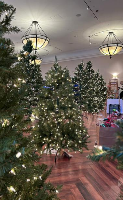
P 06 Must-See Attractions