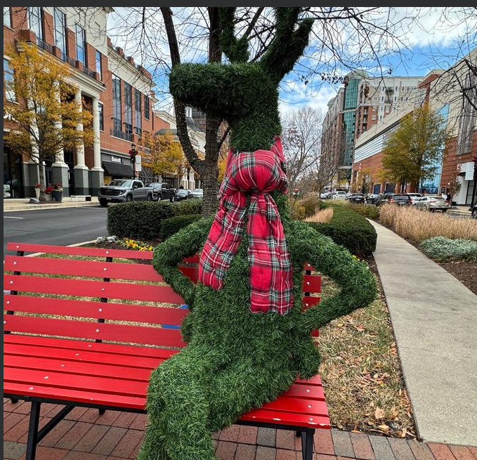
p 05 Holiday Nibbles: Pain D'espice