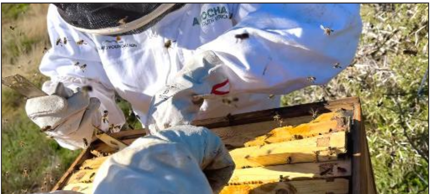
Cover image: African Honey Bee ( Apis mellifera scutellata )