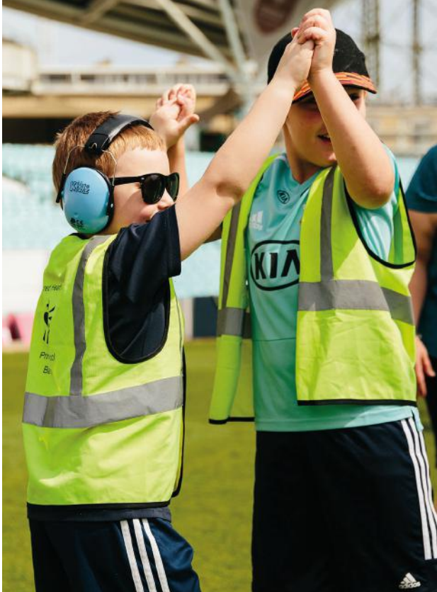
Disability Day 2022