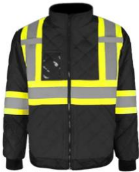
BLACK QUILTED FREEZER JACKET

The Canadian Standards Association's High Visibility Safety Standard - CSA Z96-15 - covers two garment design elements. The layout of reflective striping and luminance of background fabric determine three Classes of safety.