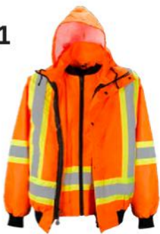
TJ60** Complete Jacket