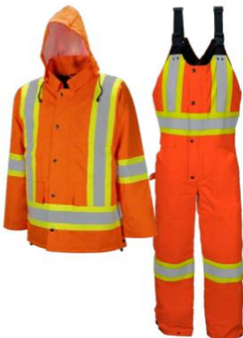
ORANGE WINTER TRAFFIC PARKA PAIRED WITH ORANGE WINTER TRAFFIC OVERALLS