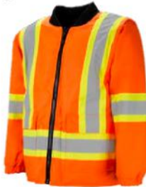
Inner Jacket w/ Sleeves