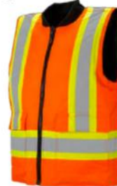
Inner w/o Sleeves