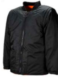
Reversed Inner w/ Sleeves