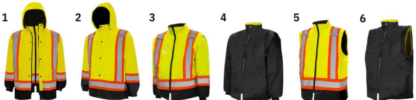
**TP6Y Complete Parka