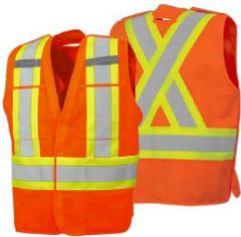
ORANGE TRAFFIC SAFETY VEST