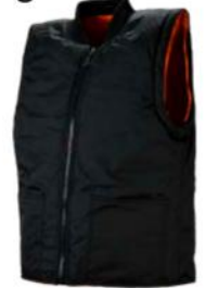
Reversed Inner w/o Sleeves