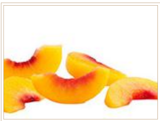
SLICED PEACHES - IQF 65434 4/5 lb.