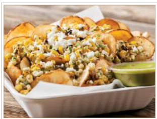
HOUSE CUT POTATO CHIPS SKIN ON 64686 6/5 lb.