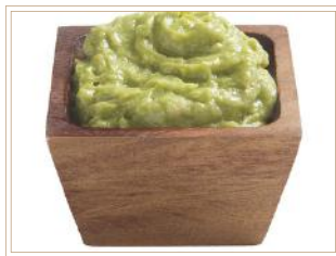
AVOCADO PULP SUPREME 72726 6/3 lb.