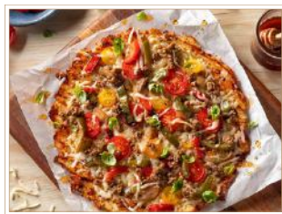
ROASTED PEPPERS & ONIONS 64474 6/2.5 lb.