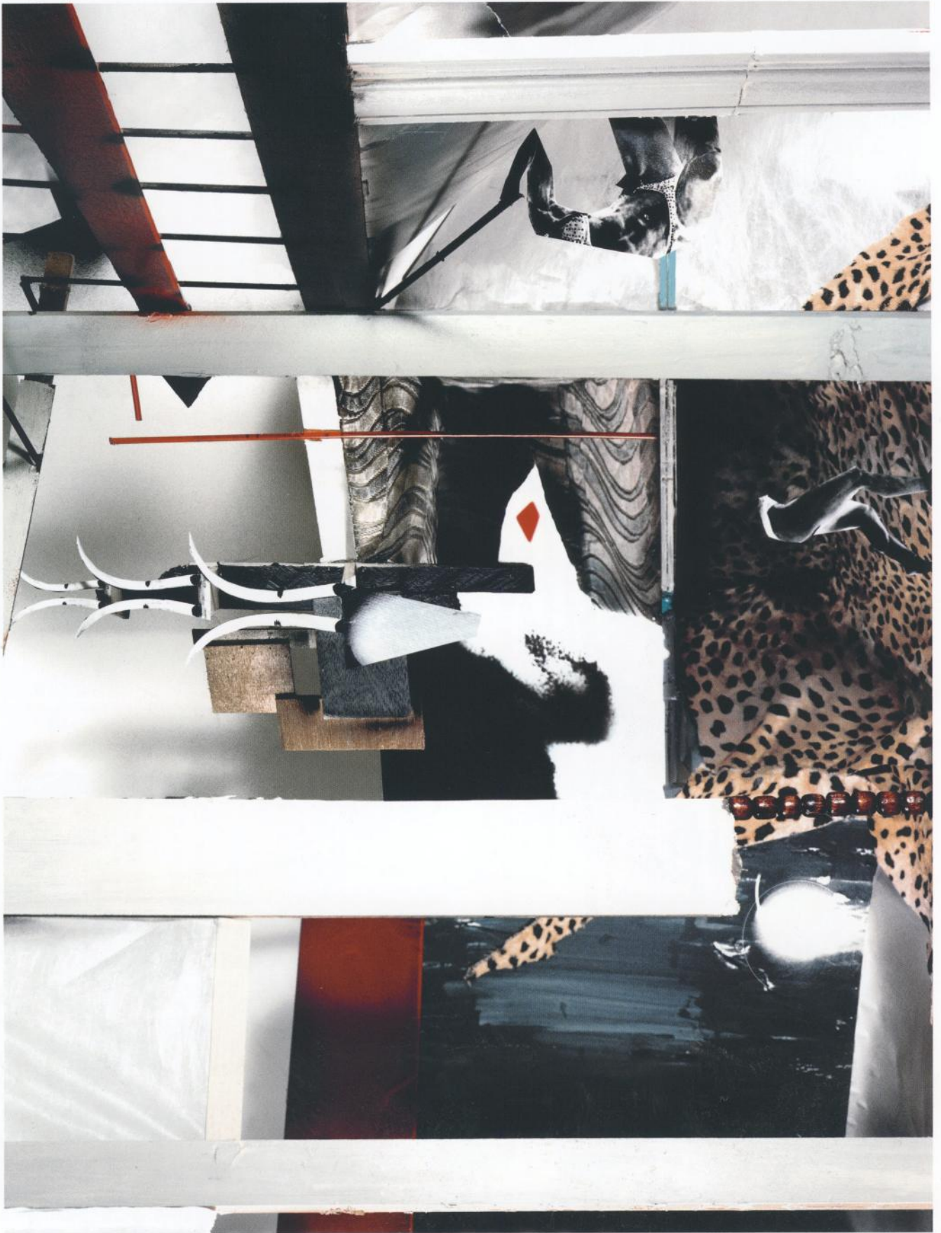
Pursuit, 2010 C-type print 91.4 x 121.9 cm