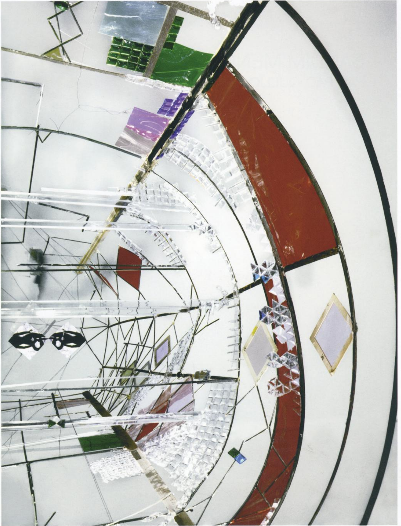
By a Thread, 2009 C-type print 30 x 40 cm