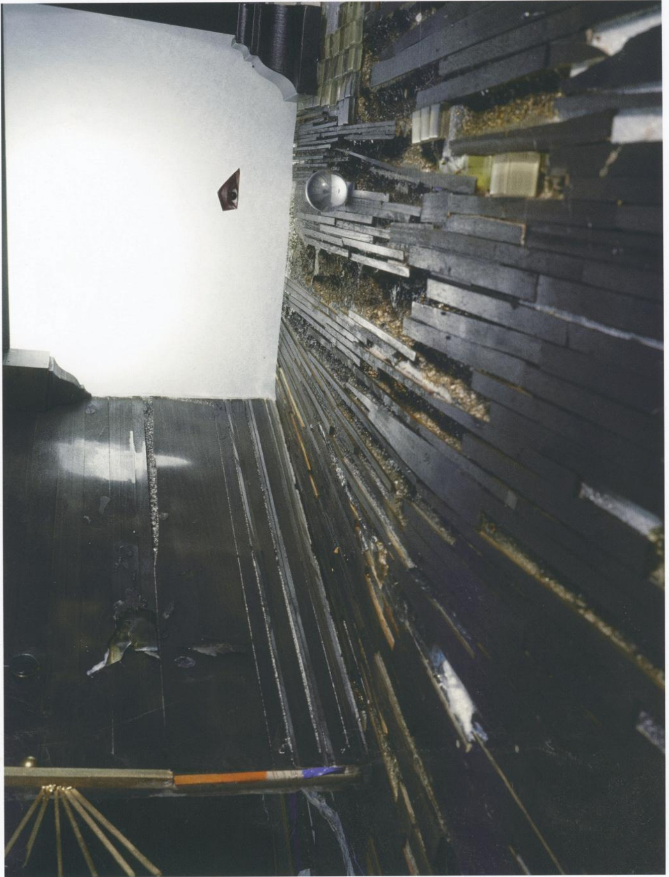
Cleo, 2009 C-type print 76 x 101 cm