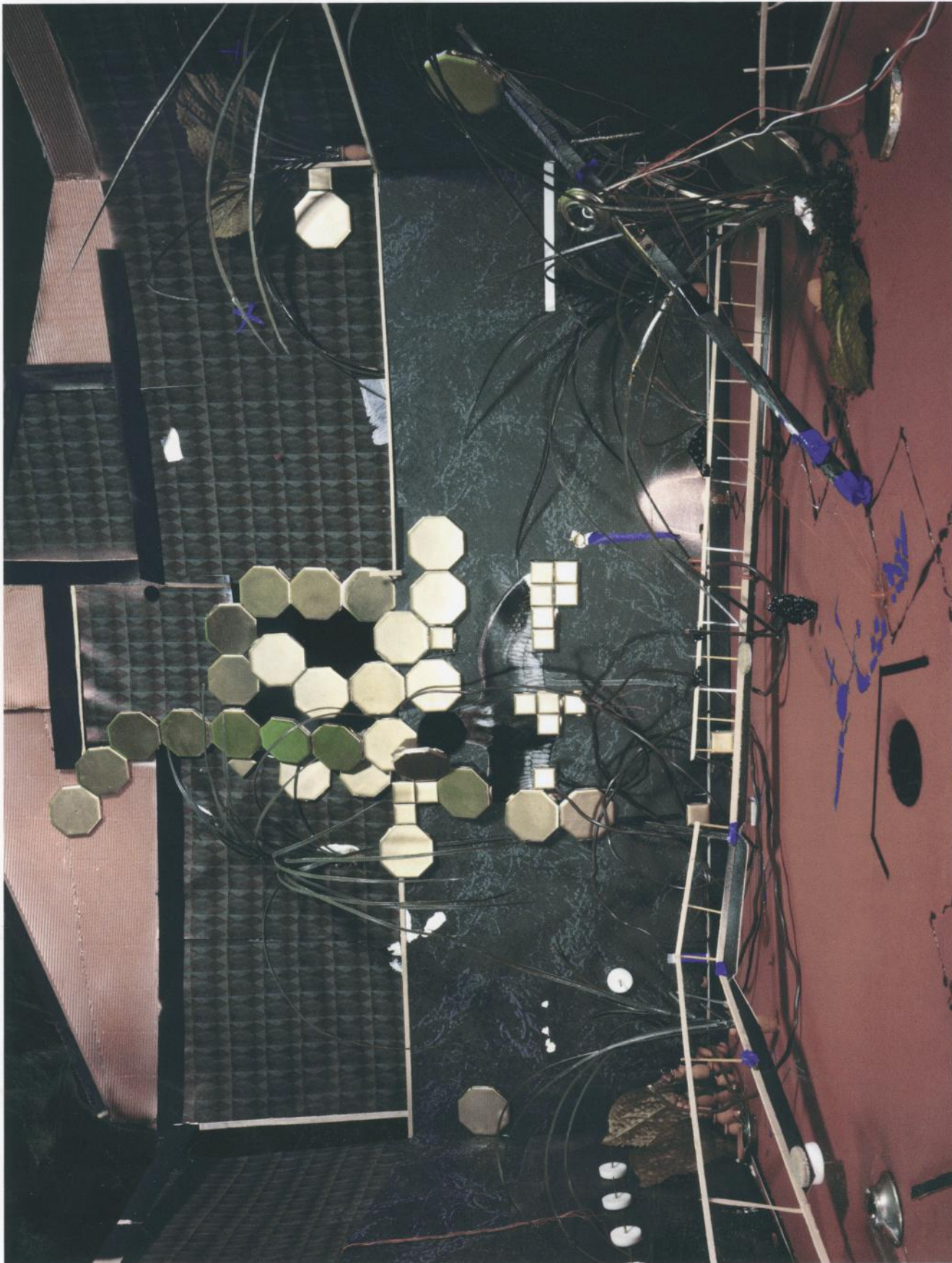
Under a Night Sky, 2009 C-type print 91.4 x 121.9 cm