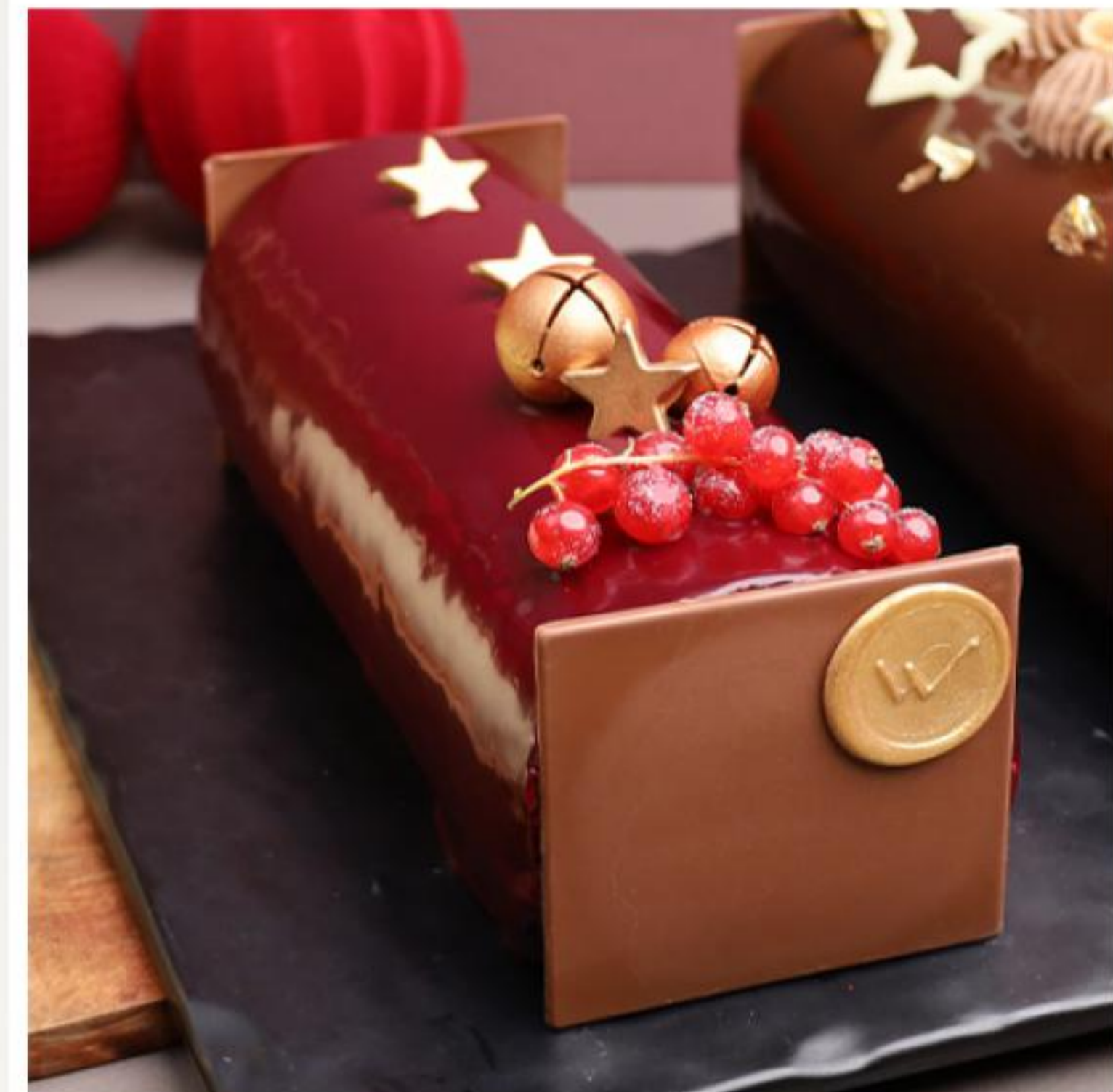
CHOCOLATE RASPBERRY BRANCH €20.00

Chocolate Omelette (Sponge Cake), White Fresh Cream, Praline, Crispy Biscuit.