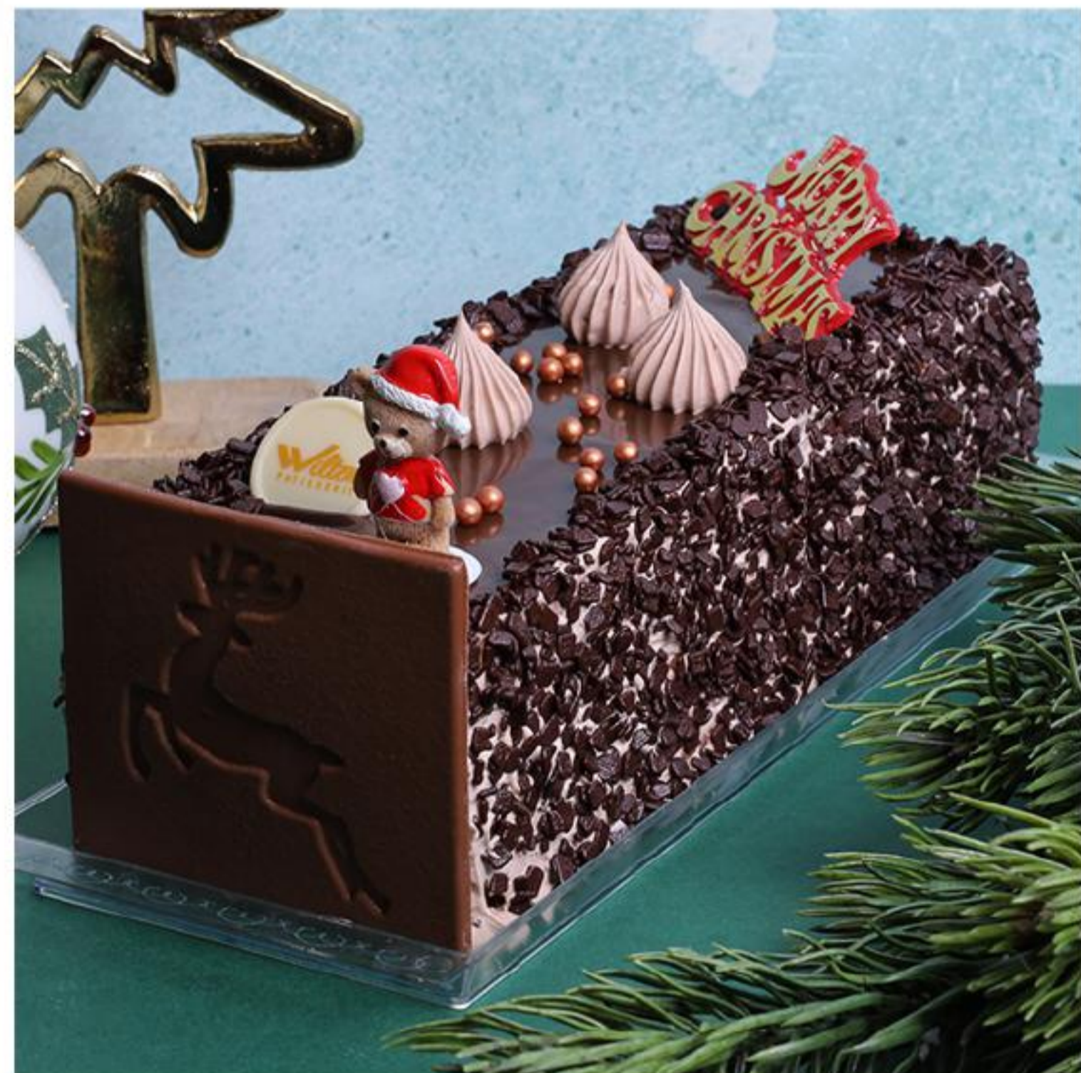
CHRISTMAS LOG €19.50

Chocolate Omelette (Sponge Cake), Chocolate Cream, Chocolate Pieces.