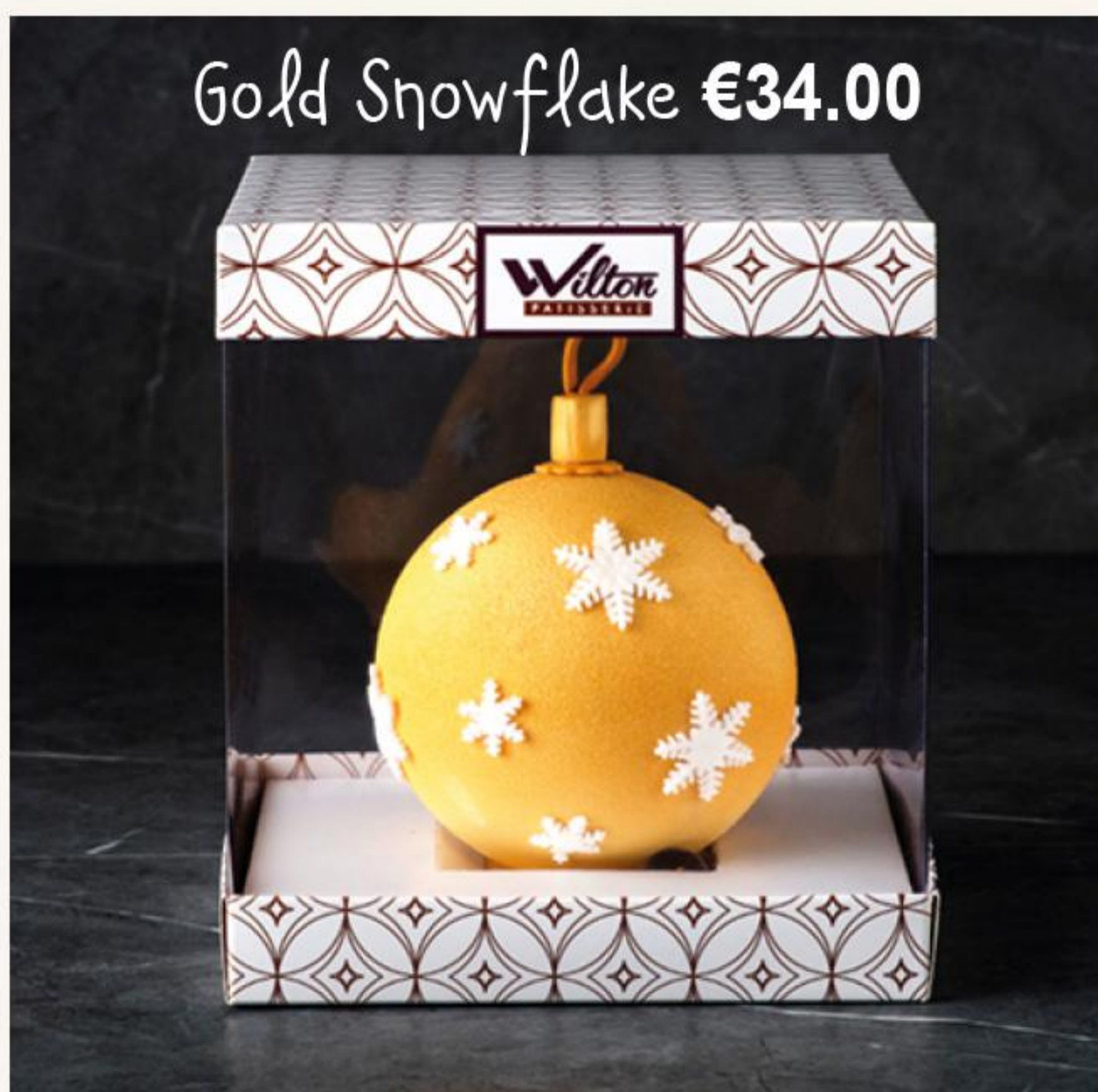
Gold Snowflake €34.00