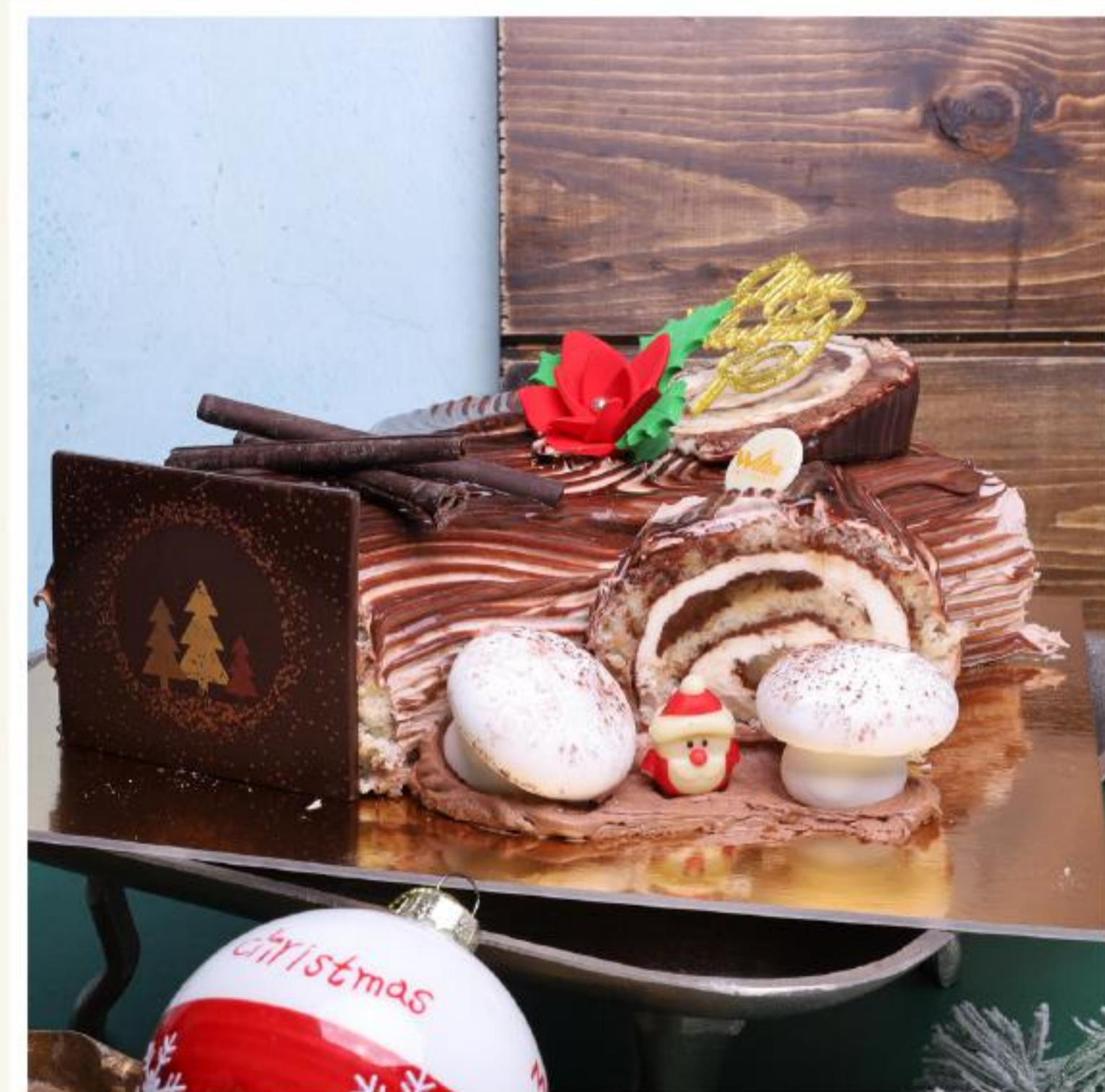
BUSH DE NOEL CHESTNUT €33.00

Chocolate Omelette (Sponge Cake), Bueno Mousse, Crispy Waffles Pieces, Bueno Praline, Milk Chocolate.