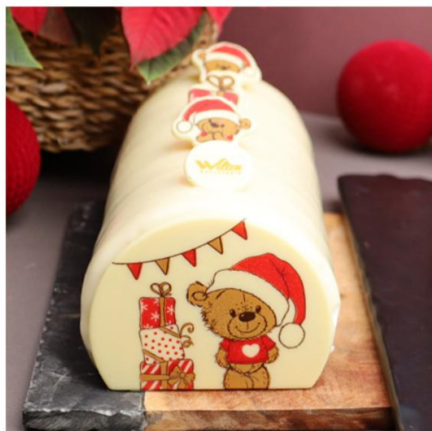
STRAWBERRY BRANCH €20.00

Chocolate Omelette (Sponge Cake) White Chocolate Mousse, Raspberry Feeling (Coulis).