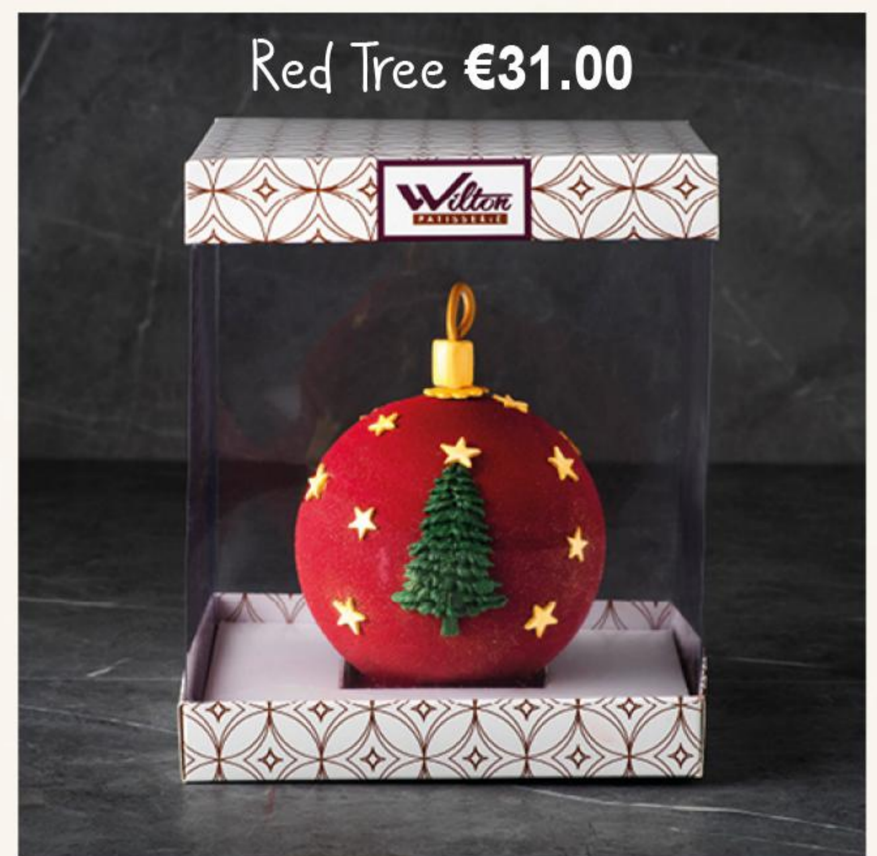
Red Tree €31.00