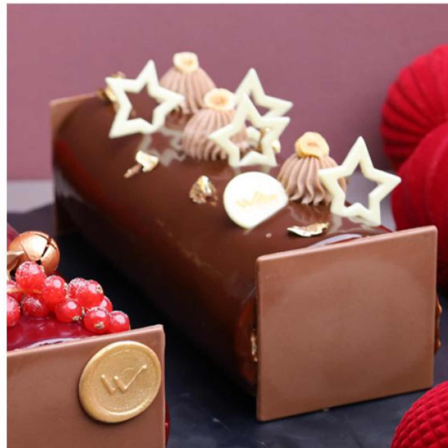
PRALINE SWISS ROLL €20.00

Chocolate Omelette (Sponge Cake), Chocolate Cream, Chocolate Pieces.