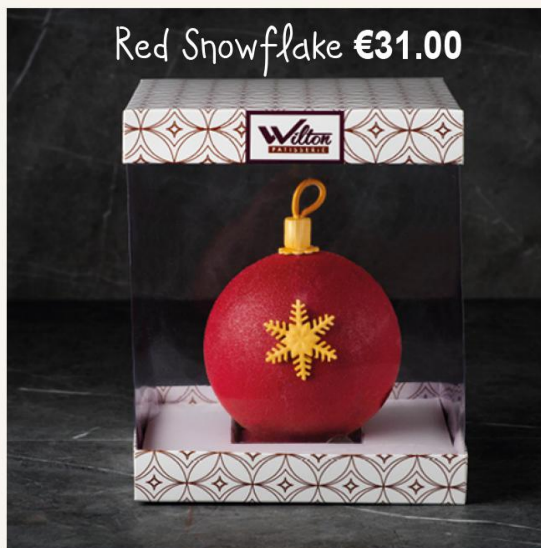
Red Snowflake €31.00