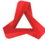
Time attendance software