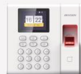
Time Attendance Terminal (Backup battery, White)