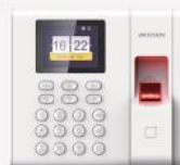
Time Attendance Terminal (White)