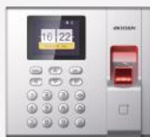
Access Control & Time Attendance Terminal (Silver)