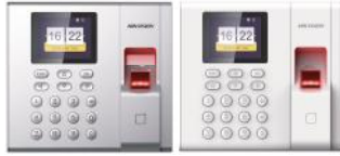
Time attendance stored on device locally