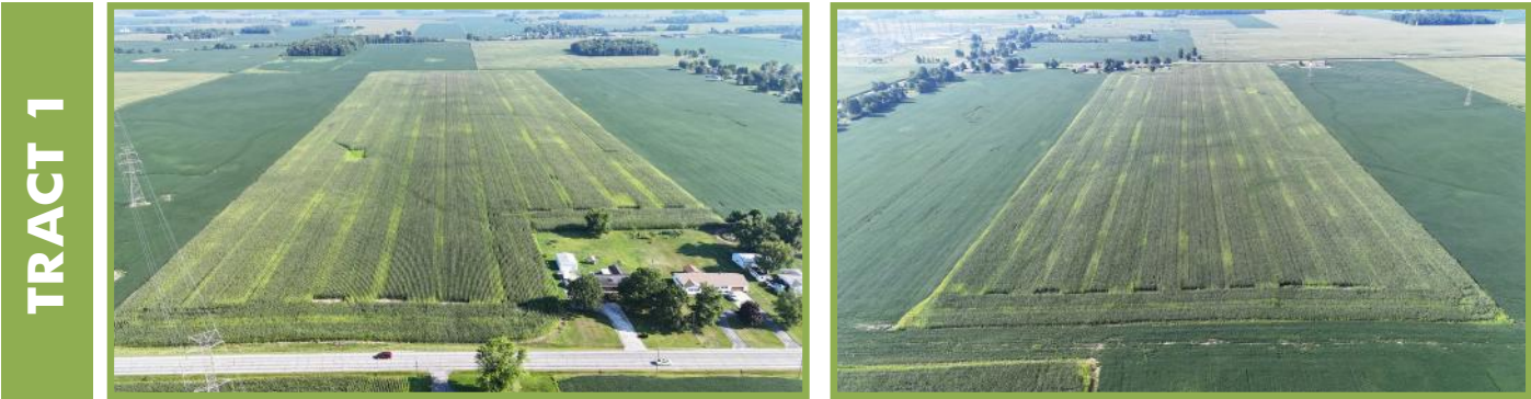
35+/- Acres | 34.46+/- Tillable | 0.54+/- Non-Tillable FROM LEFT TO RIGHT: Tract 1 View from the South along SR 35 AND Tract 1 View from the North end of the property