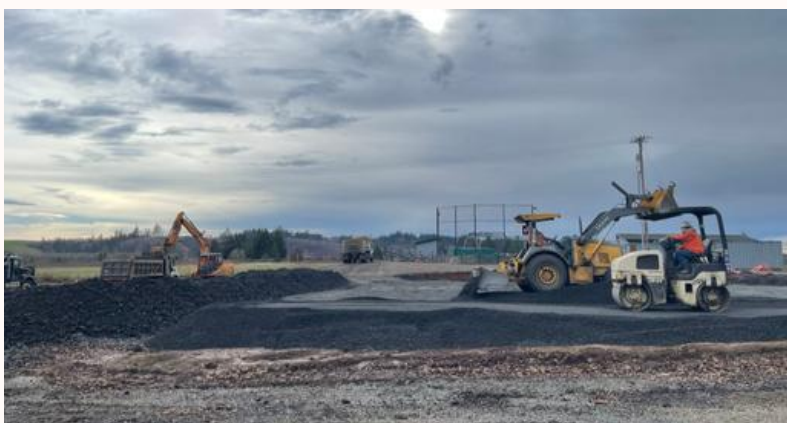
Left: Firm Foundation. New multipurpose building expected completion Fall 2023.