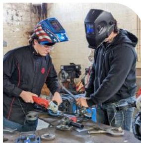
SC Introduces Welding Program page 12