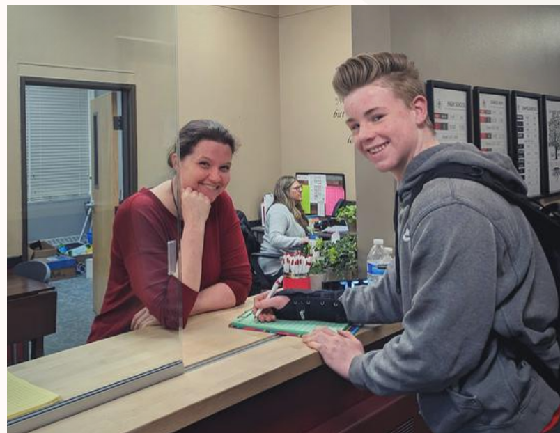
Above: View from our window. Main office is ready to greet visitors and assist students.

As you drive to the back parking area on campus, you will see that construction is underway for our brand-new multipurpose facility. Our elementary students will use this building for added indoor/covered space when the weather is cold and wet. It will also be the home of our brand-new batting cage facilities for our baseball and softball programs and much-needed practice space for our cheerleaders throughout the year. Currently, we are in the process of getting the foundation laid out, poured, and ready for the construction of the building. Our goal is to have this building completed and ready to go by the start of next school year.