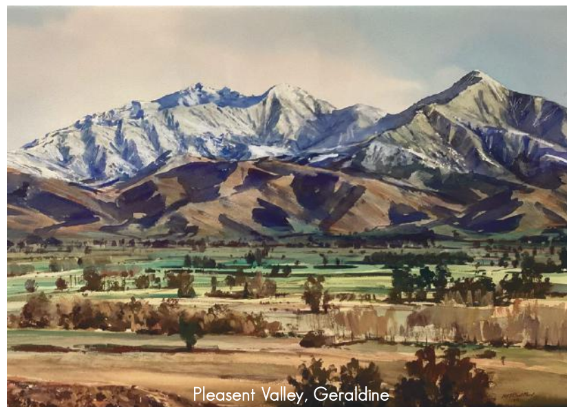
Pleasant Valley, Geraldine