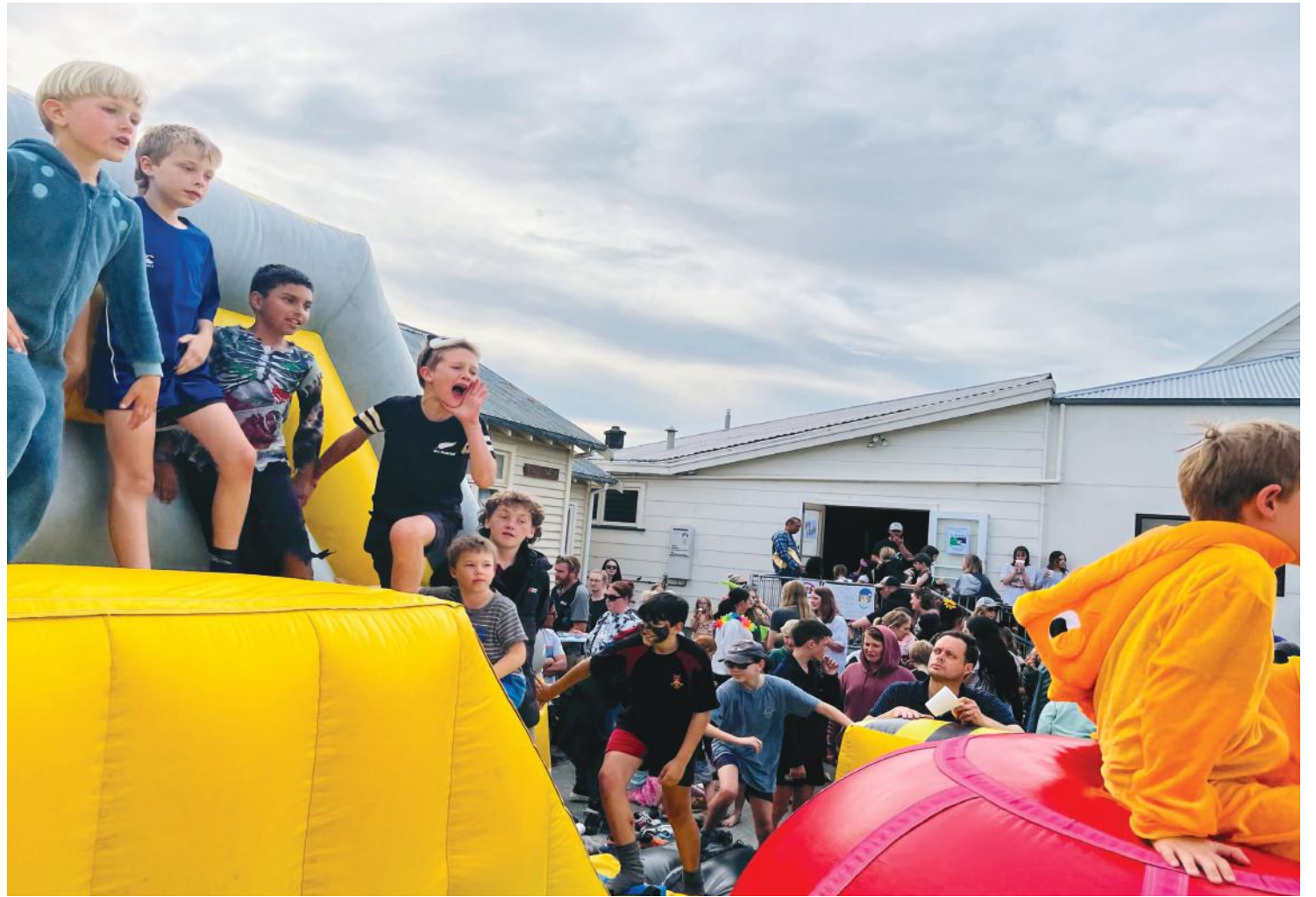
Children enjoying the bouncy castle at last year's Light Party at St Andrew's.

While every effort is made to ensure the accuracy of information in this publication, GNews does not accept any responsibility for errors or omissions, or for any consequences arising from reliance on information published. The content of submitted material is not necessarily endorsed by the owners. The editor reserves the right to make decisions on publication of stories and the quality/suitability of submitted ads.