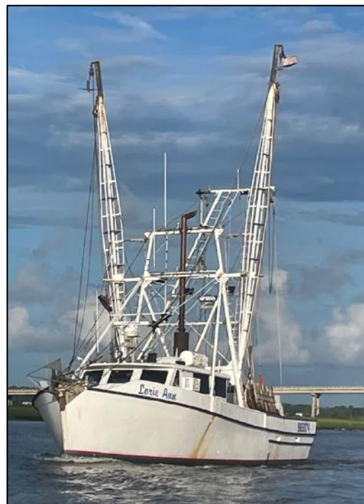
The Lorie Ann cruises off Southport, the site of ABC-Charlotte's 2025 Coastal Rendezvous.