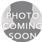
2025 Chair-Elect: Vacant