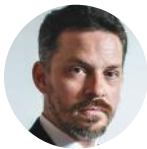
2024 ADVOCACY COMMISSIONER BLAIR MCKAY, AIA PAGE