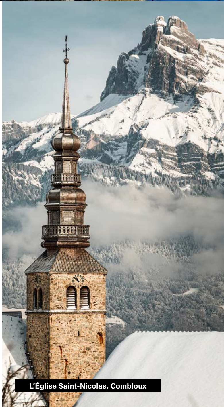
L'Église Saint-Nicolas, Combloux