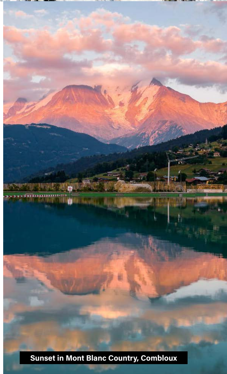
Sunset in Mont Blanc Country, Combloux