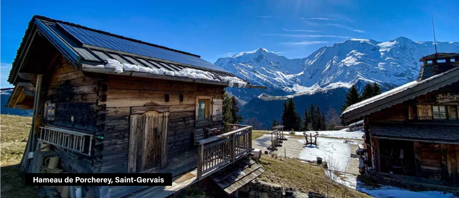
Hameau de Porcherey, Saint-Gervais

Votre présence à cet événement serait un honneur pour nous. L'Australie, avec son esprit combatif et sa passion pour le sport, est essentielle pour enrichir cette célébration de l'esprit sportif et de l'amitié internationale. Votre participation symboliserait l'engagement de l'Australie envers l'excellence sportive et la diversité, tout en offrant une chance unique de représenter votre pays sur la scène internationale dans une compétition véritablement inclusive.