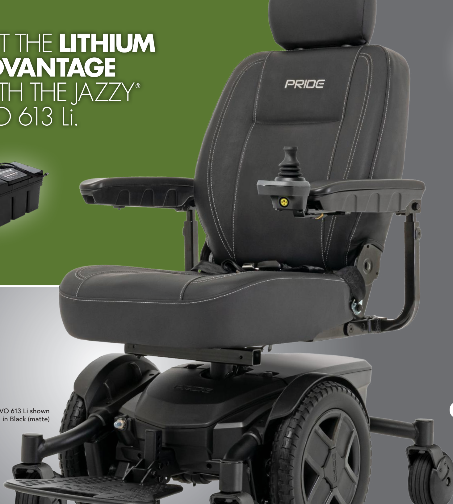
Jazzy® EVO 613 Li shown in Black (matte)