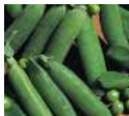
ONWARD SOW APR/ JUN