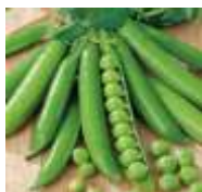
METEOR SOW FEB/ APR & SEPT/ OCT