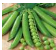
METEOR PEA SOW