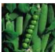
EARLY ONWARD SOW FEB/ MAR