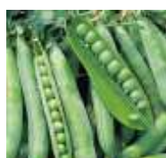
HURST GREENSHAFT SOW FEB/ APR