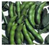
SUTTON DWARF SOW FEB/ MAR