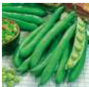
GIANT EXHIBITION SOW FEB/ MAR