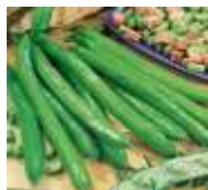
BUNYARDS EXHIBITION SOW FEB/ MAR