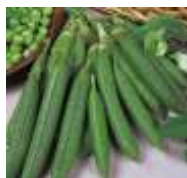
DOUCE PROVENCE PEA