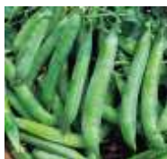
KELVEDON WONDER SOW MAR/ APR