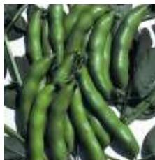
SUTTON DWARF BROAD BEAN SOW FEB/MAR/ NOV/ DEC