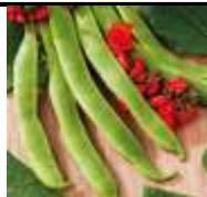
POLESTAR SOW MAY/ JUN