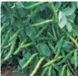
AQUADULCE BROAD BEAN SOW FEB/MAR OCT/NOV