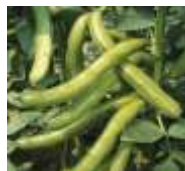
GREEN LONGPOD SOW FEB/ MAY