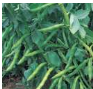
AQUADULCE SOW FEB/ MAR & OCT/ NOV