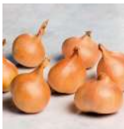
YELLOW MOON (shallot)