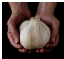
ELEPHANT GARLIC (subject to availability)