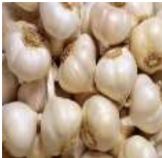
AUTUMN PLANTING WHITE