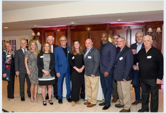
Madison Chamber of Commerce 2025 Board of Directors