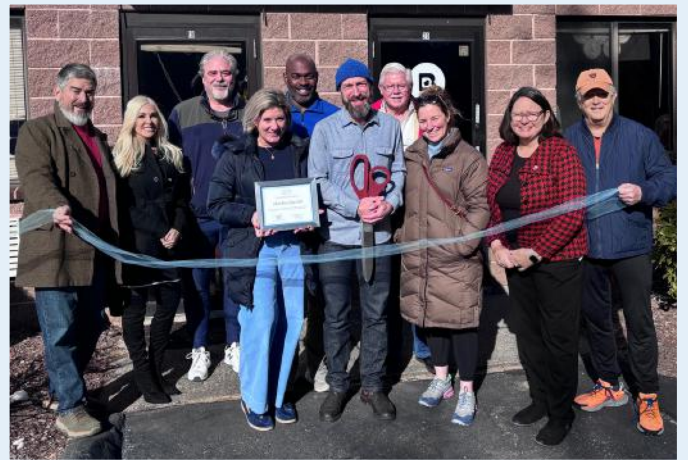
Shoreline Clay Club