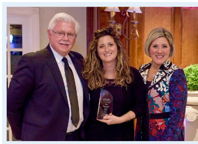
Business of the Year: Madison Earth Care