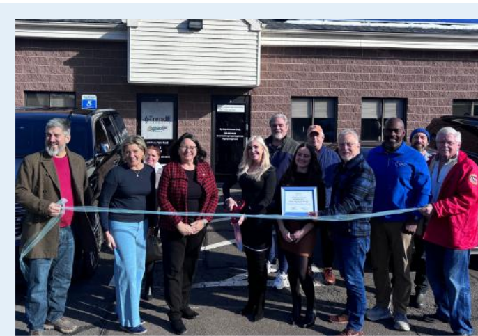
Property Girl Home Staging