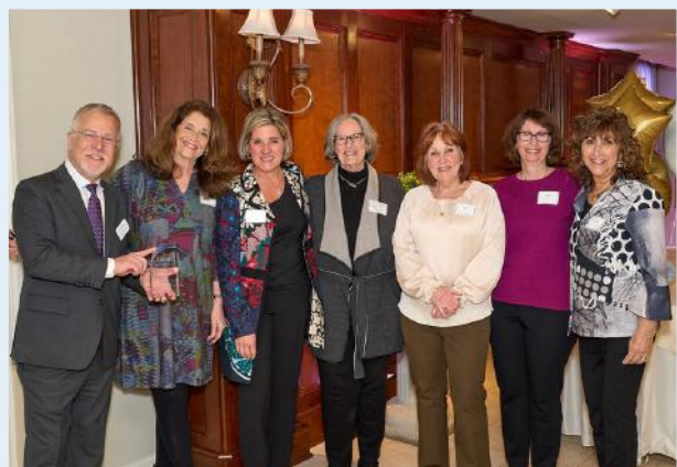
Legacy Award: The Garden Club of Madison 100+ Years