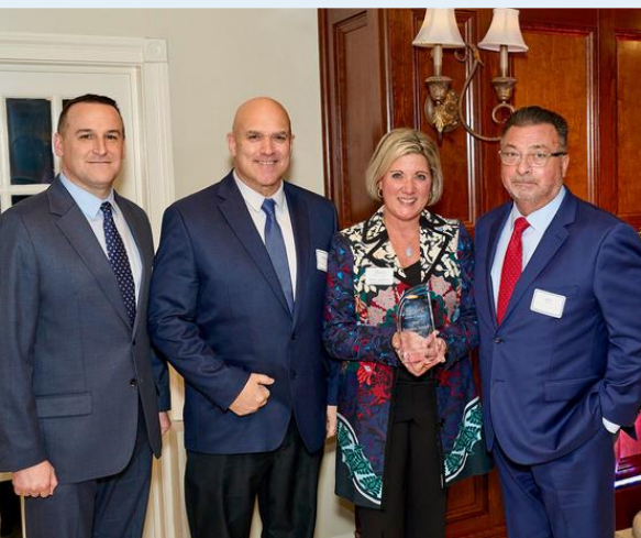
Executive Director Award: Madison Police Department