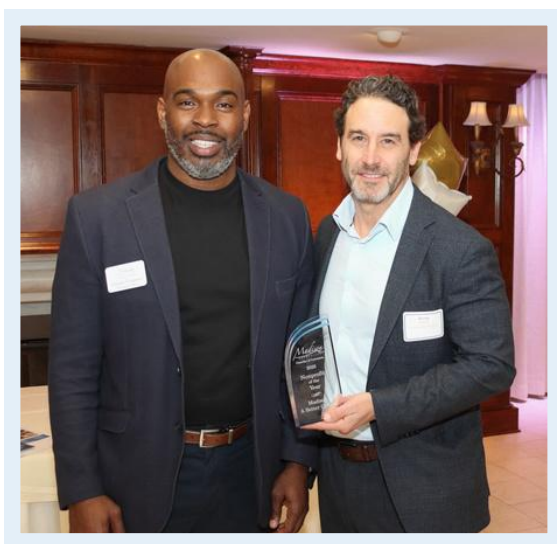
Nonprofit of the Year: Madison A Better Chance