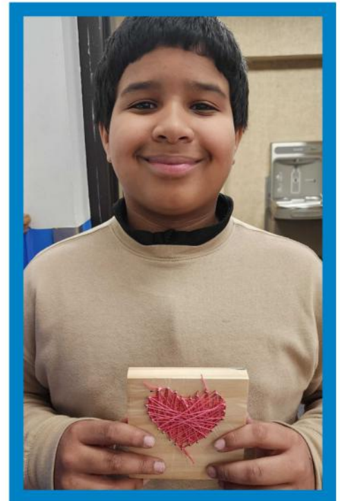
*Names have been changed