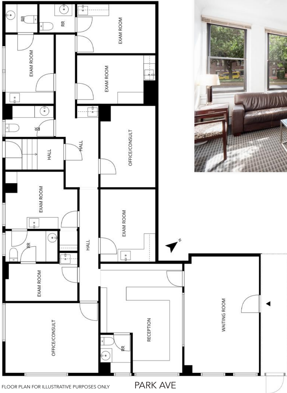
FLOOR PLAN FOR ILLUSTRATIVE PURPOSES ONLY