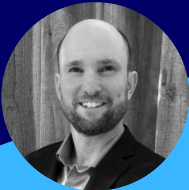
WATER QUALITY & TREATMENT DIRECTOR

We encourage you to read that report for additional health related information.