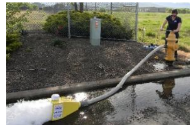
Routine maintenance such as valve turning and hydrant flushing helps ensure water quality from the source to your tap