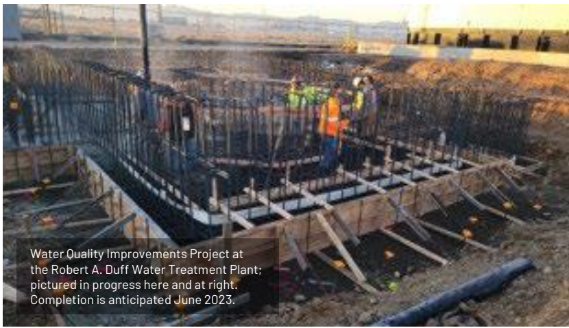
Water Quality Improvements Project at the Robert A. Duff Water Treatment Plant; pictured in progress here and at right. Completion is anticipated June 2023.