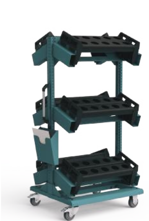
30" x 27" x 59 3/16" NCW42101 36" x 27" x 59 3/16" NCW52101