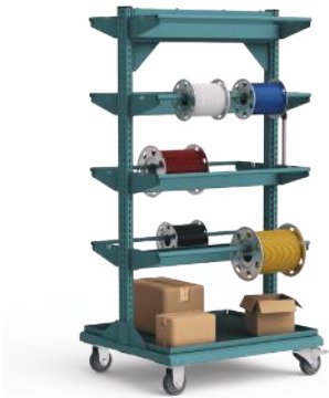
30" x 27" x 59 3/16" EMA1032 36" x 27" x 59 3/16" EMA1332

Go to rousseau.com for more suggested models.