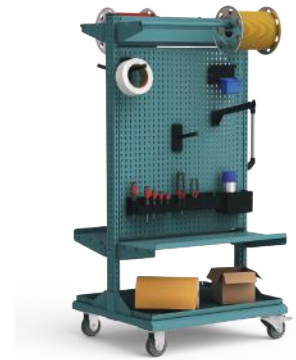
30" x 27" x 59 3/16" EMA1082 36" x 27" x 59 3/16" EMA1382