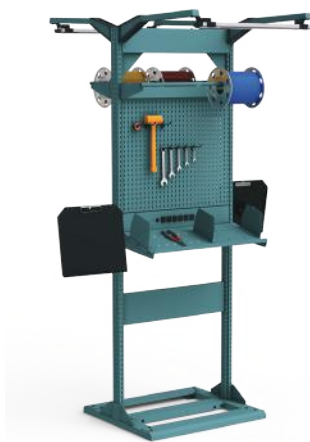
30" x 27" x 85 1/4" EMA3031 36" x 27" x 85 1/4" EMA3331