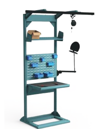
30" x 27" x 84" EMA4050 36" x 27" x 84" EMA4350

For more information, contact our representative: