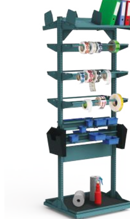
30" x 27" x 85 1/4" EMA3021 36" x 27" x 85 1/4" EMA3321