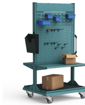
30" x 27" x 59 3/16" EMA1003 36" x 27" x 59 3/16" EMA1303