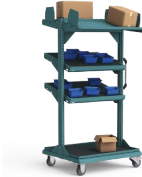
30" x 27" x 59 3/16" EMA1052 36" x 27" x 59 3/16" EMA1352