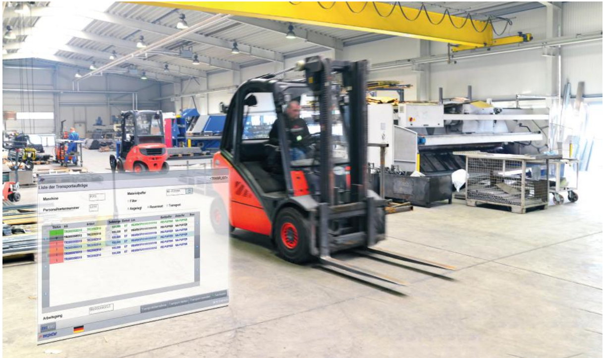
Figure 2: Increased efficiency in the production routine by linking production and logistics

to a so-called Warehouse Management System (WMS), the existing functions can be extended and thus become even more powerful. For example, MPDV's MES HYDRA monitors defined stocks of material and intermediate products – WiP material – as part of the MPL (Material & Production Logistics) application. At the same time, HYDRA works with current buffer stocks in production and has much more detailed information than an ERP system, which usually only knows stock levels that are booked at the end of the order. HYDRA can also project the expected range of selected materials. If HYDRA is connected to a WMS, the improvements can be significant. You can then not only monitor stocks of specific material buffers, but merge information about storage bins in production with the data from other storage locations managed in the WMS. This means, you can early detect material shortages and delays with minimal efforts or even avoid it completely. By means of a functional networking, the MES knows the exact material location and can display it on the shop floor client.