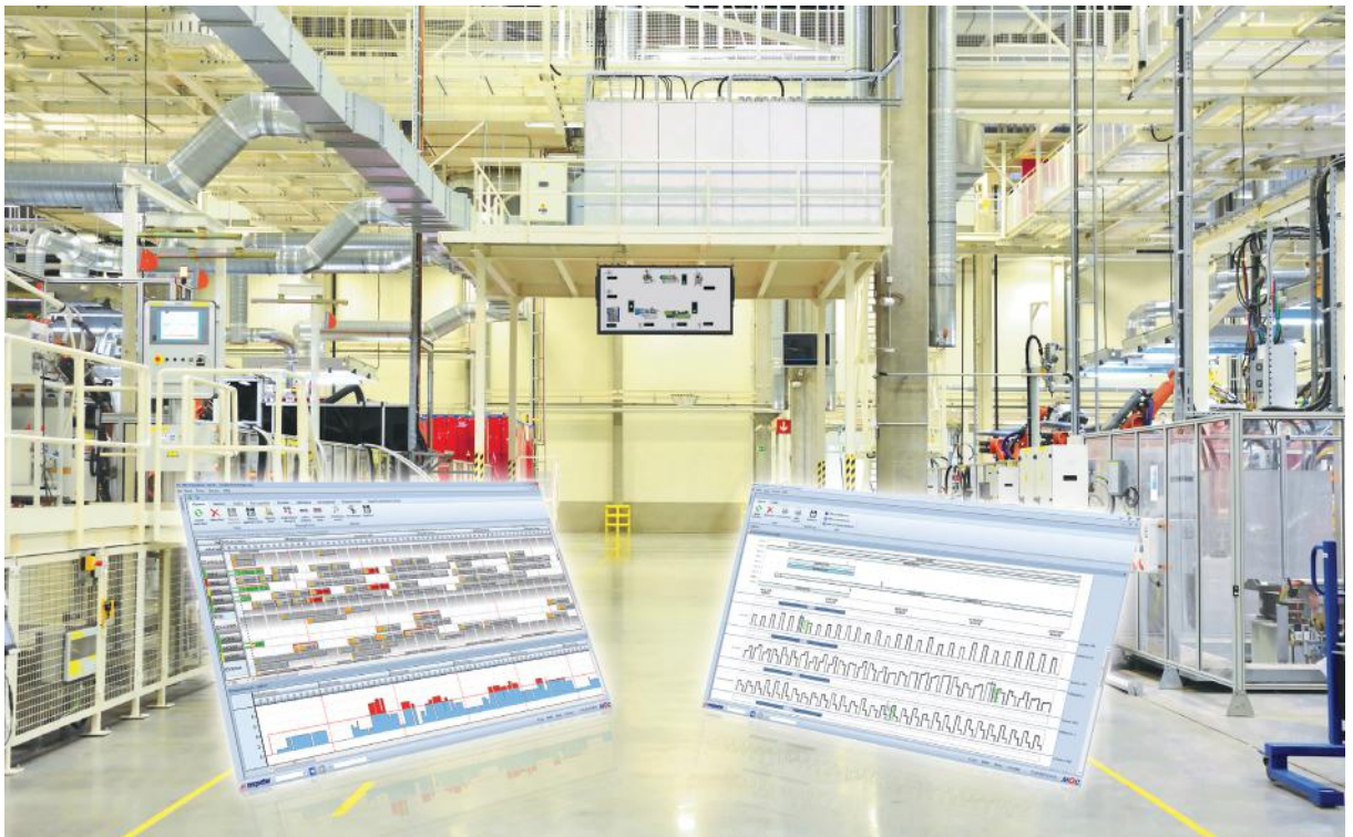
Figure 3: MES and facility management exchange information regarding an optimized production planning

In some industrial sectors, production processes for each article must be completely documented. With a raising individualization of products, this requirement will become all the more important for an increasing number of companies in order to provide targeted services and support for their products at a later stage. Whereas it was