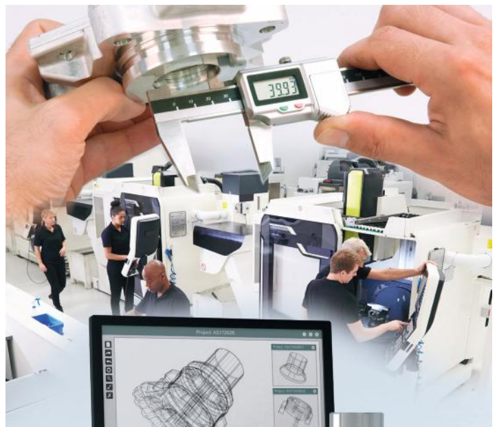
Figure 4: Long-term increase in quality through linking of design and production inspection

HYDRA has recently been offering the first functions for importing inspection characteristics from CAD models. We are already discussing whether to even extend this function. Another application which we have developed some time ago, is the transfer of NC programs from a Product Lifecycle System (PLM). With HYDRA DNC, the data can then be used directly on the machine depending on the pending job. HYDRA DNC is already widely used in production companies.