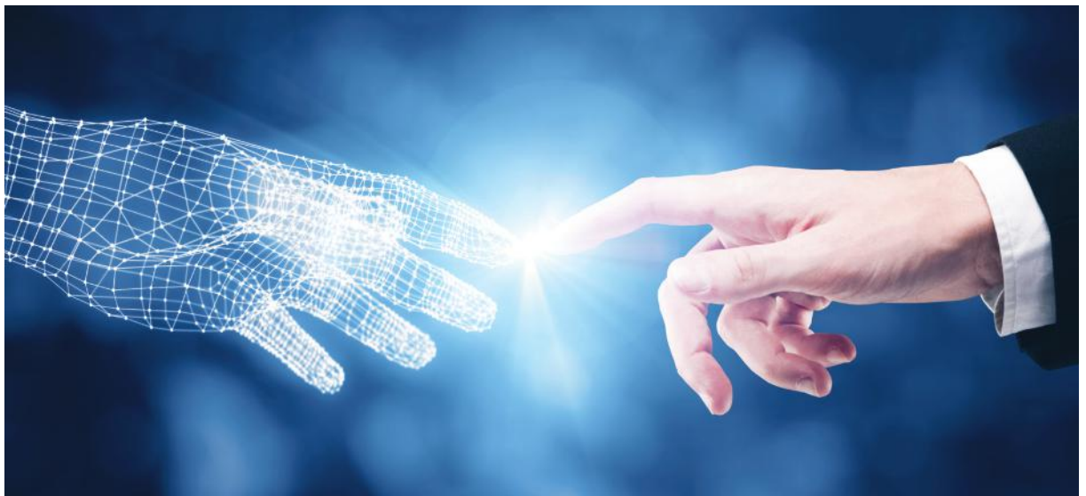
Figure 5: The Digital Thread extends the Digital Twin with a time dimension

Targeted functional networking also promotes the further expansion of all previous stages of the Smart Factory: transparency, responsiveness and self-regulation. This turns the 4-stage model itself into a control loop for production optimization – entirely in line with Industry 4.0.