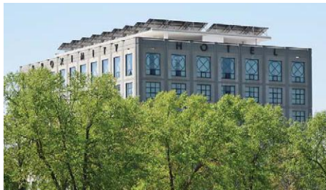
336.379.8200 | PROXIMITYHOTEL.COM