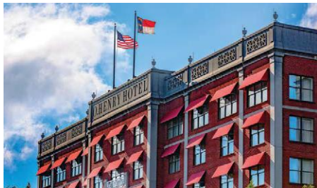
336.854.2000 | OHENRYHOTEL.COM

Visit our websites to see the latest happenings.