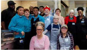
Moses Cone Hospital kitchen staff and volunteers from the Jewish community