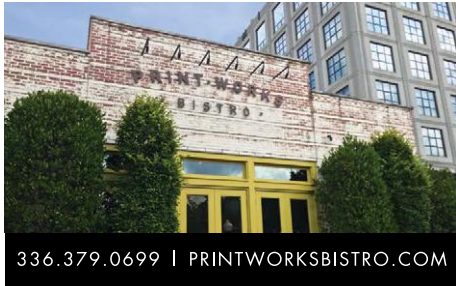
336.379.0699 | PRINTWORKSBISTRO.COM