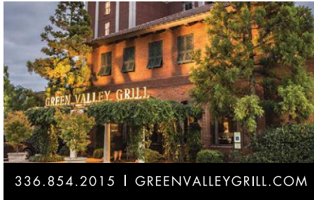
336.854.2015 | GREENVALLEYGRILL.COM