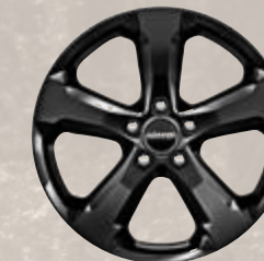
20-inch Gloss Black-painted aluminum (Standard with Black Appearance Package)