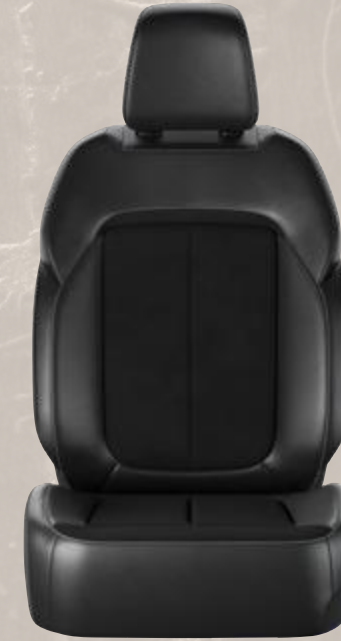
Capri Leatherette and Perforated Suede with Light Tungsten accent stitching — Global Black (Standard with Altitude X and Altitude Package)