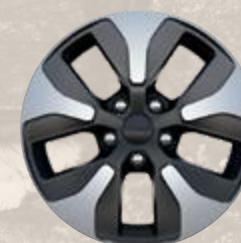
18-inch machined-face aluminum with Black Noise-painted pockets (Standard)