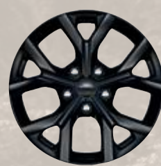
18-inch Gloss Black-painted aluminum (Standard on Altitude Package and Altitude X)