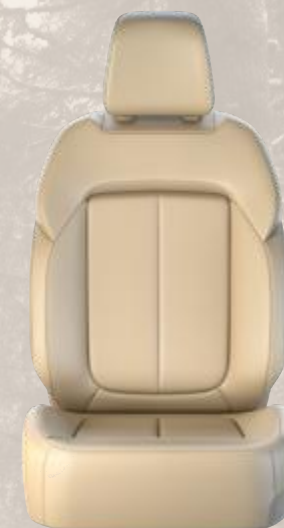
Capri Leatherette with Light Tungsten accent stitching — Global Black/Wicker Beige (Standard)