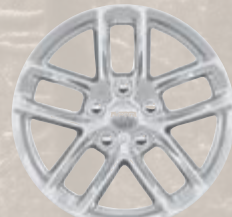
18-inch Fine Silver fully painted aluminum (Standard on 3-row models and Laredo X 2-row models; available on 2-row models)