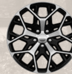
21-inch machined-face / Gloss Black-painted aluminum (Standard with Summit Reserve Group)