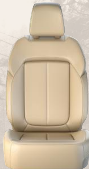
Capri Leatherette with Light Tungsten accent stitching — Global Black / Wicker Beige (Standard)