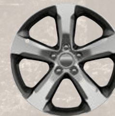
20-inch Technical Gray-painted machined aluminum (Available)