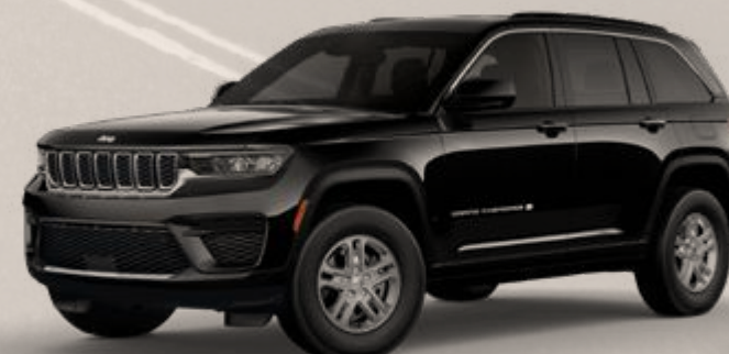
Laredo in Diamond Black Crystal Pearl