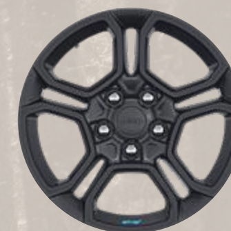
18-inch Granite Crystal fully painted aluminum (Standard)