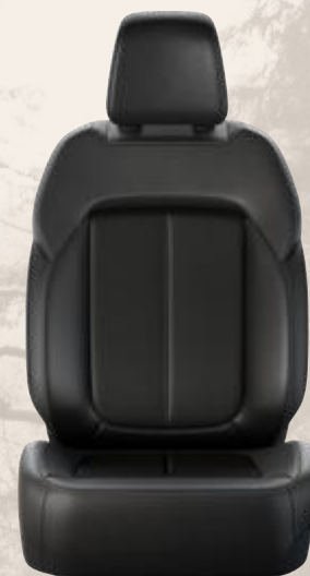
Capri Leatherette with Light Tungsten accent stitching — Global Black (Standard)