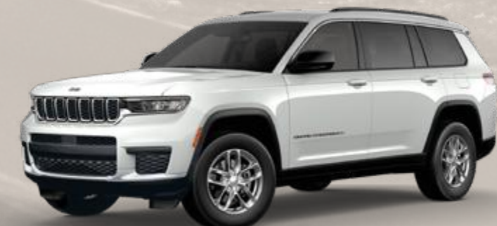
3-Row Laredo in Bright White