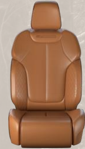
Ventilated Palermo Leather with Quilted Palermo Leather Bolsters and Cognac accent stitching, Global Black piping and embossed Summit logo — Tupelo / Black (Standard with Summit Reserve Group)