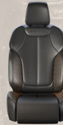
Ventilated Palermo Leather with Quilted Palermo Leather Bolsters and Cognac accent stitching, Steel Gray piping and embossed Summit logo — Global Black (Standard with Summit Reserve Group)