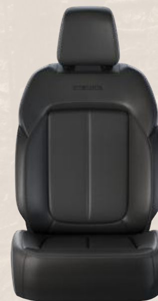
Ventilated Nappa Leather and Axis II Perforations with Light Tungsten accent stitching, Diesel Gray piping and embossed Overland logo — Global Black (Standard)