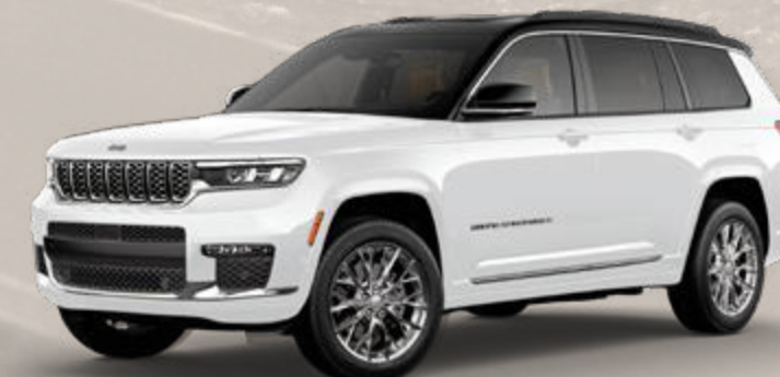
3-Row Summit in Bright White