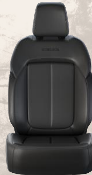
Ventilated Nappa Leather and Axis II Perforations with Light Tungsten accent stitching, Diesel Gray piping and embossed Overland logo — Global Black (Standard)