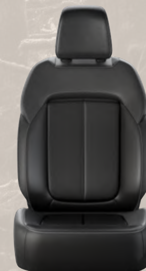
Ventilated Capri Leatherette and Axis II Perforations with Light Tungsten accent stitching — Global Black (Standard with Luxury Tech Group II and Anniversary Edition)