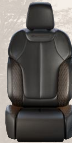
Ventilated Nappa Leather with Quilted Nappa Leather Bolsters and Cognac accent stitching, Steel Gray piping and embossed Summit logo — Global Black (Standard)