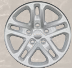
17-inch Fine Silver fully painted aluminum (Standard on 2-row models)