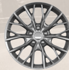
20-inch Silver Lithos fully painted aluminum (Standard)