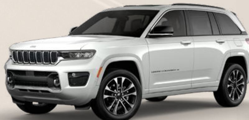
Overland® in Bright White