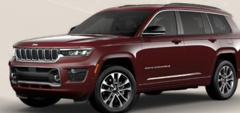
3-Row Overland in Velvet Red Pearl