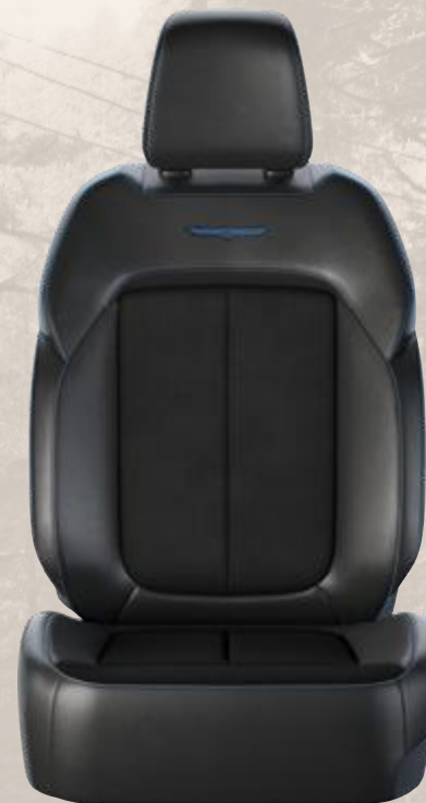
Ventilated Capri Leather and Axis II Perforated Suede with Surf Blue accent stitching — Global Black (Standard)