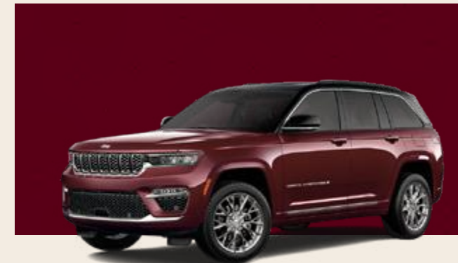
Velvet Red Pearl