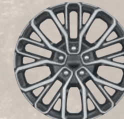
21-inch machined-face/Granite Crystal painted aluminum (Standard on 3-row with Summit Reserve Group)