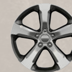
20-inch Technical Gray-painted machined aluminum (Available)