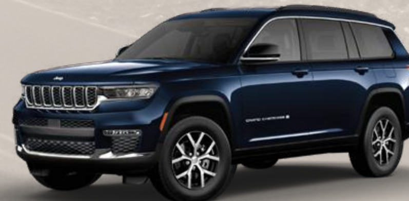
3-Row Limited in Midnight Sky