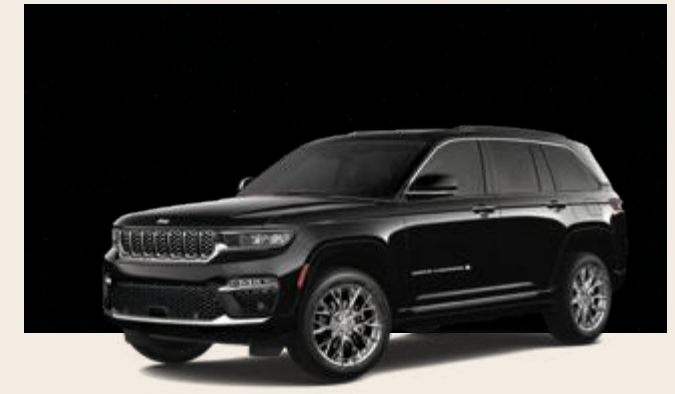
Diamond Black Crystal Pearl