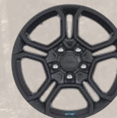
18-inch Granite Crystal fully painted aluminum (Standard with Anniversary Edition)