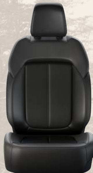
Capri Leatherette with Light Tungsten accent stitching — Global Black (Standard)