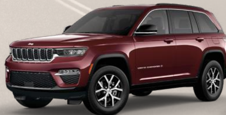
Limited in Velvet Red Pearl