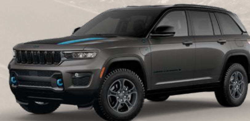
Trailhawk 4xe in Baltic Gray Metallic