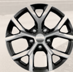
18-inch polished/painted aluminum with High-Gloss Black pockets (Standard)