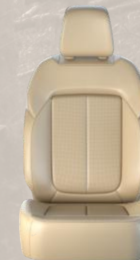
Ventilated Capri Leatherette and Axis II Perforations with Light Tungsten accent stitching — Global Black/Wicker Beige (Standard with Luxury Tech Group II)