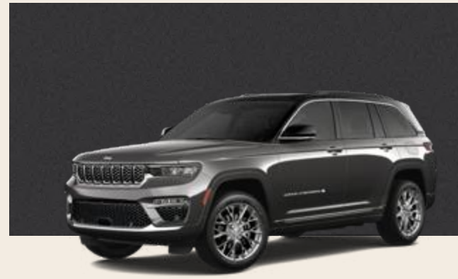
Baltic Gray Metallic