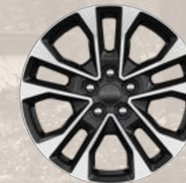
20-inch machined-face aluminum with Black Noise-painted pockets (Standard)