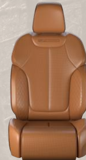
Ventilated Palermo Leather with Quilted Palermo Leather Bolsters and Cognac accent stitching, Global Black piping and embossed Summit logo — Tupelo/Black (Standard with Summit Reserve Group)