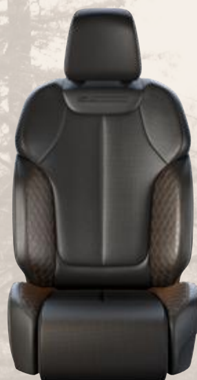
Ventilated Nappa Leather with Quilted Nappa Leather Bolsters and Cognac accent stitching, Steel Gray piping and embossed Summit logo — Global Black (Standard)