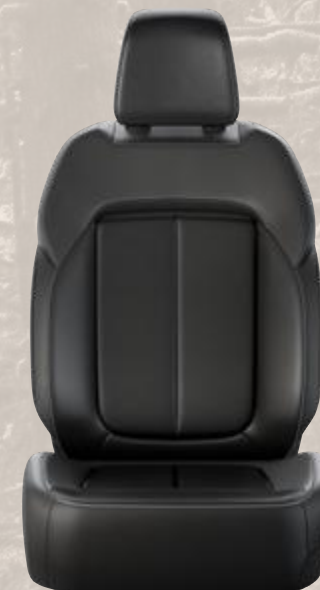
Ventilated Capri Leatherette and Axis II Perforations with Light Tungsten accent stitching — Global Black (Standard with Luxury Tech Group II)