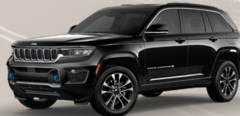
Overland® 4xe in Diamond Black Crystal Pearl