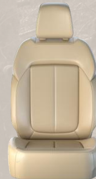
Ventilated Capri Leatherette and Axis II Perforations with Light Tungsten accent stitching — Global Black / Wicker Beige (Standard with Luxury Tech Group II)