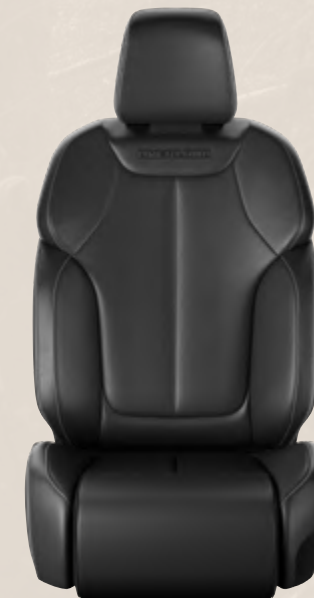
Ventilated Nappa Leather and Axis II Perforations with Light Tungsten accent stitching, Diesel Gray piping and embossed Overland logo — Global Black (Standard with Luxury Tech Group IV)