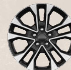
20-inch machined-face aluminum with Black Noise-painted pockets (Standard)