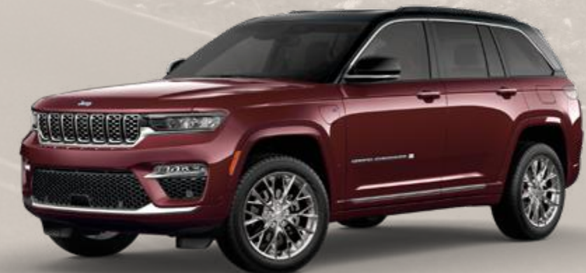
Summit 4xe in Velvet Red Pearl