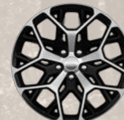
21-inch machined-face/Gloss Black-painted aluminum (Standard on 2-row with Summit Reserve Group)