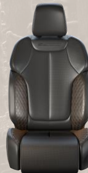
Ventilated Palermo Leather with Quilted Palermo Leather Bolsters and Cognac accent stitching, Steel Gray piping and embossed Summit logo — Global Black (Standard with Summit Reserve Group)