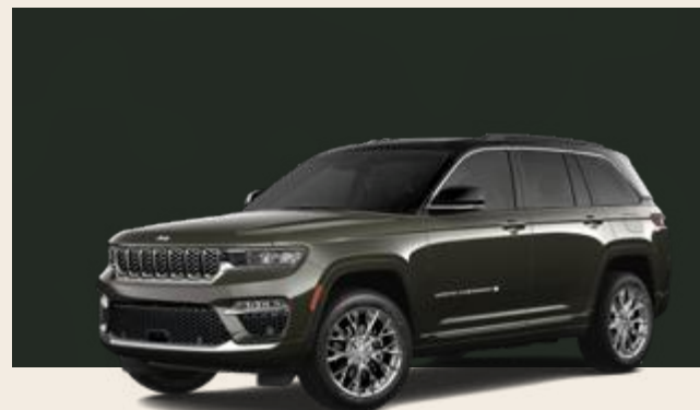
Rocky Mountain Pearl