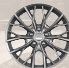
20-inch Silver Lithos fully painted aluminum (Standard)