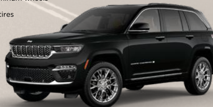
Summit in Diamond Black Crystal Pearl