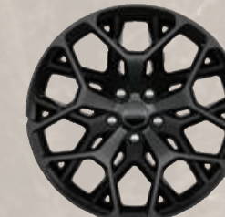
21-inch Black Noise-painted aluminum (Standard with High Altitude Package)