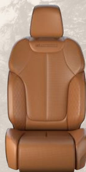
Ventilated Nappa Leather with Quilted Nappa Leather Bolsters and Cognac accent stitching, Global Black piping and embossed Summit logo — Tupelo/Black (Standard)