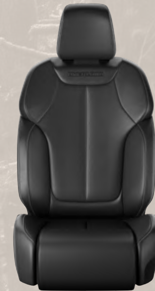
Ventilated Nappa Leather and Axis II Perforations with Light Tungsten accent stitching, Diesel Gray piping and embossed Overland logo — Global Black (Standard with Luxury Tech Group IV)