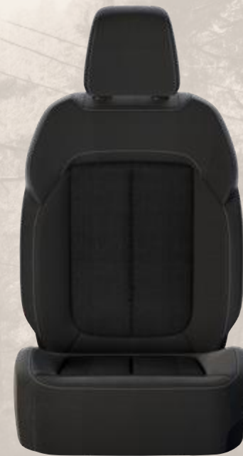
Origin and Essence Cloth with Light Tungsten accent stitching — Global Black (Standard)