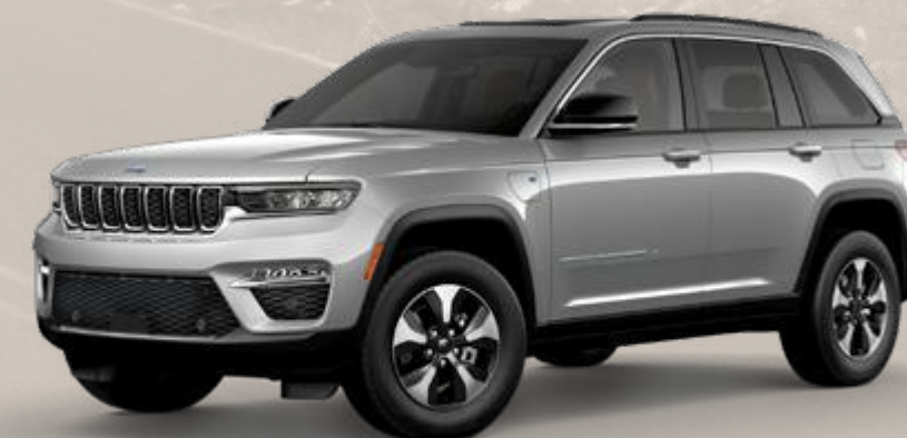
4xe in Silver Zynith