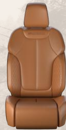
Ventilated Nappa Leather with Quilted Nappa Leather Bolsters and Cognac accent stitching, Global Black piping and embossed Summit logo — Tupelo/Black (Standard)