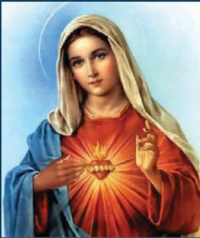
Mother Mary Our Inspiration