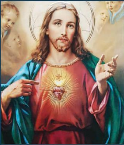
Jesus Christ Our Foundation