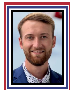
Rep. Parker Fairbairn