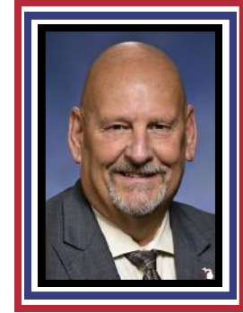
Rep. Curt Vanderwall