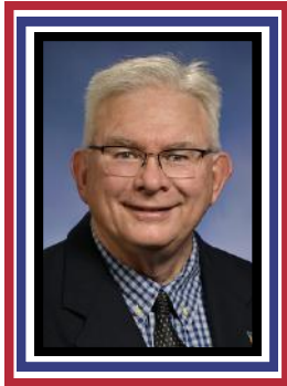
Rep. Joseph Fox