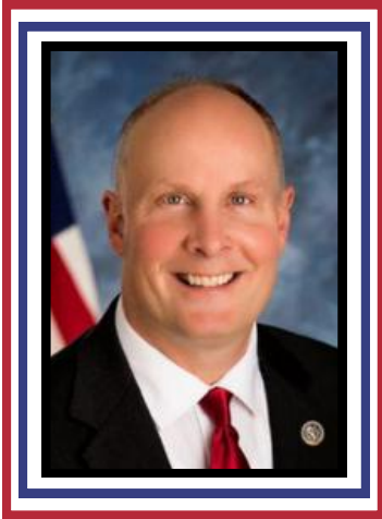
U.S. Rep. John Moolenaar D.C. Office: (202) 225-3561 Clare Office: (989) 802-6040 Caledonia Office: (616) 528-7100