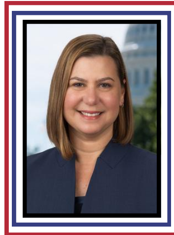
U.S. Sen. Elissa Slotkin Lansing: (517) 203-1760 Traverse City: (231) 929-1031 D.C. Office: (202) 224-4822