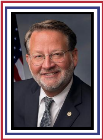
U.S. Sen. Gary Peters Lansing: (517) 377-1508 Traverse City: (231) 947-7773 D.C. Office: (202) 224-6221