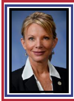
Sen. Michele Hoytenga