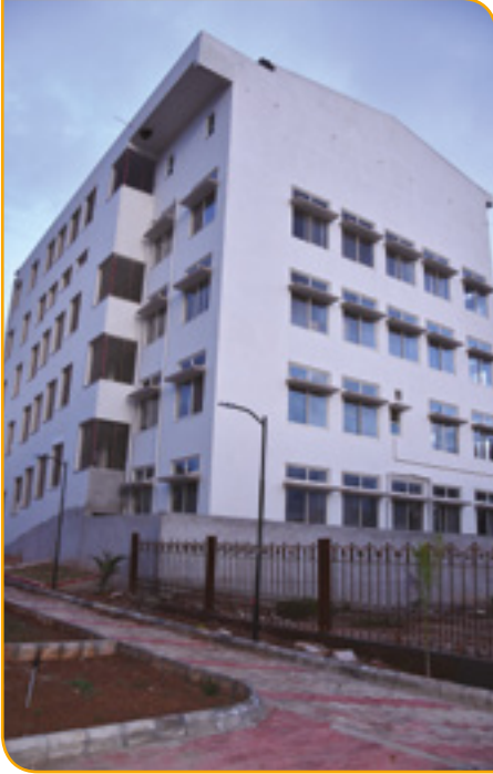
New Treatment Centre and School