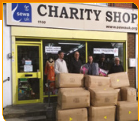
Donation of sleeping bags to homeless people