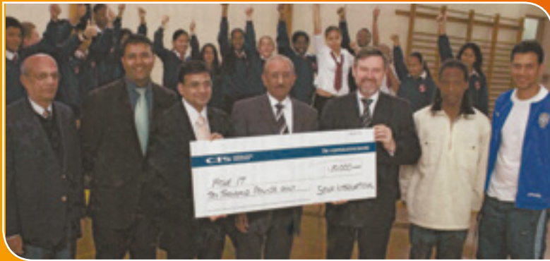
Move It - The Brent North Youth Sports pilot project