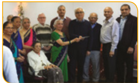
Fundraising by Coventry sewa for Arundya School, Gadag, Karnataka