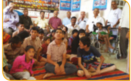
sewa UK trustees visit to school