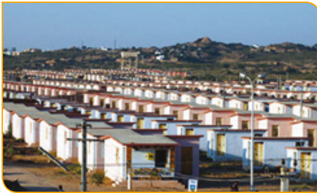
Reconstruction of a new village by sewa UK following 2001 earthquake in Gujarat