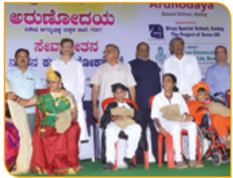
Opening ceremony in April 2019

A unique school for children with special needs helping children suffering with intellectual disability, Cerebral Palsy, Autism and other Disabilities.