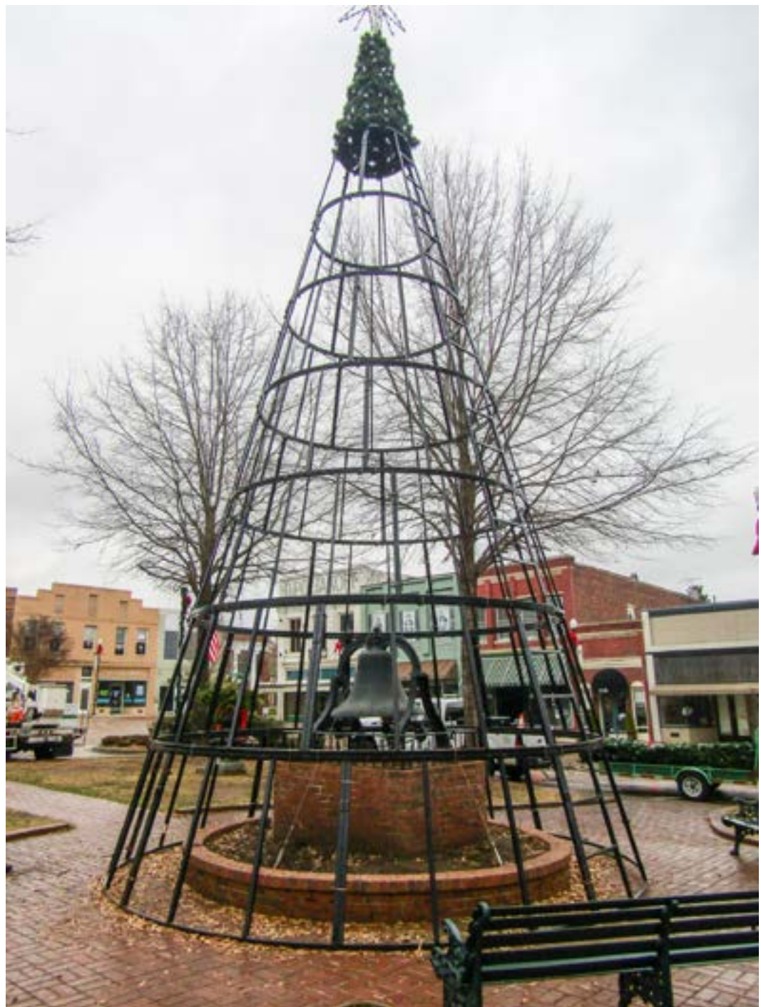
Yes, folks, another Christmas is behind us, and when the City of Abbeville was taking down its Christmas tree on Court Square on the morning of Tuesday, Dec. 28, it was a reminder of "Christmas past."

We seem to becoming a country of losers. It's a thought. See you in church!