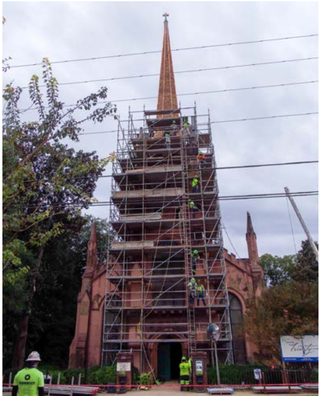
The process of restoring Trinity Church, one of Abbeville's architectural jewels, continued in 2021. The Episcopal church, which dates from the 19th century, looks down on the intersection of Church and Trinity streets.