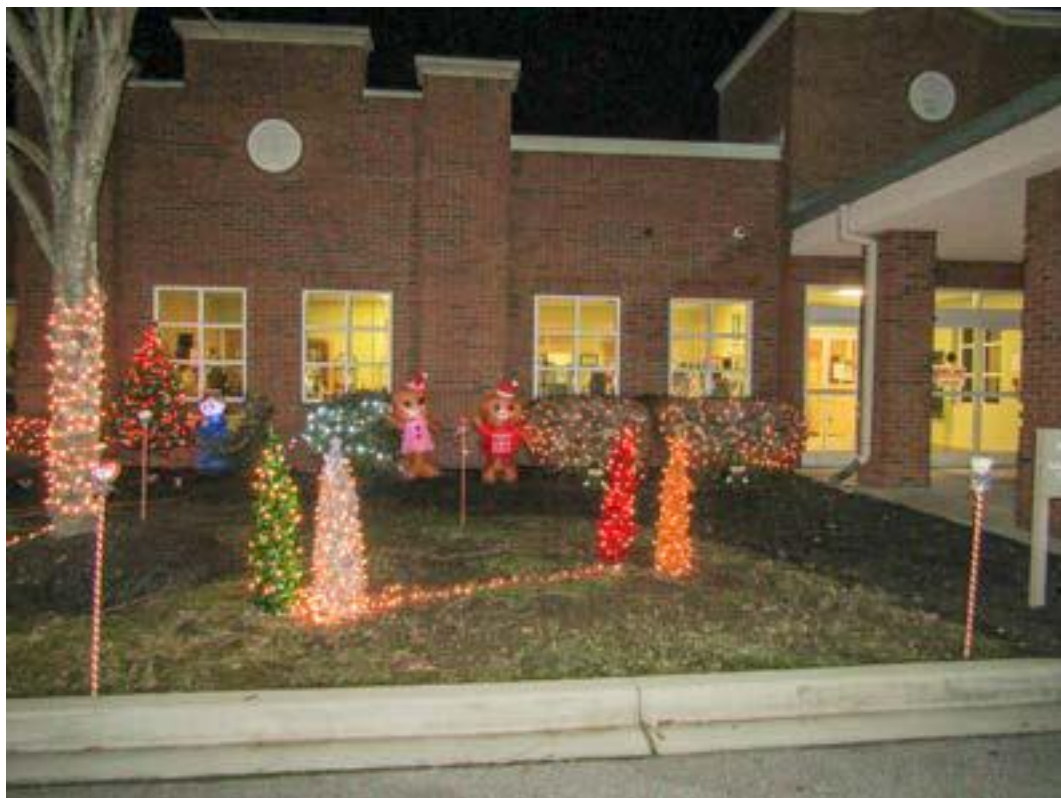
There was a light decoration competition among the departments at the Abbeville Area Medical Center for the holidays. In first place was "barnyard Christmas," by the Administrative Wing. Registration came in second, with Winter Wonderland, and Specialty Services came in third.

For more information on recycling in Abbeville County, one may call 864-446-8473.