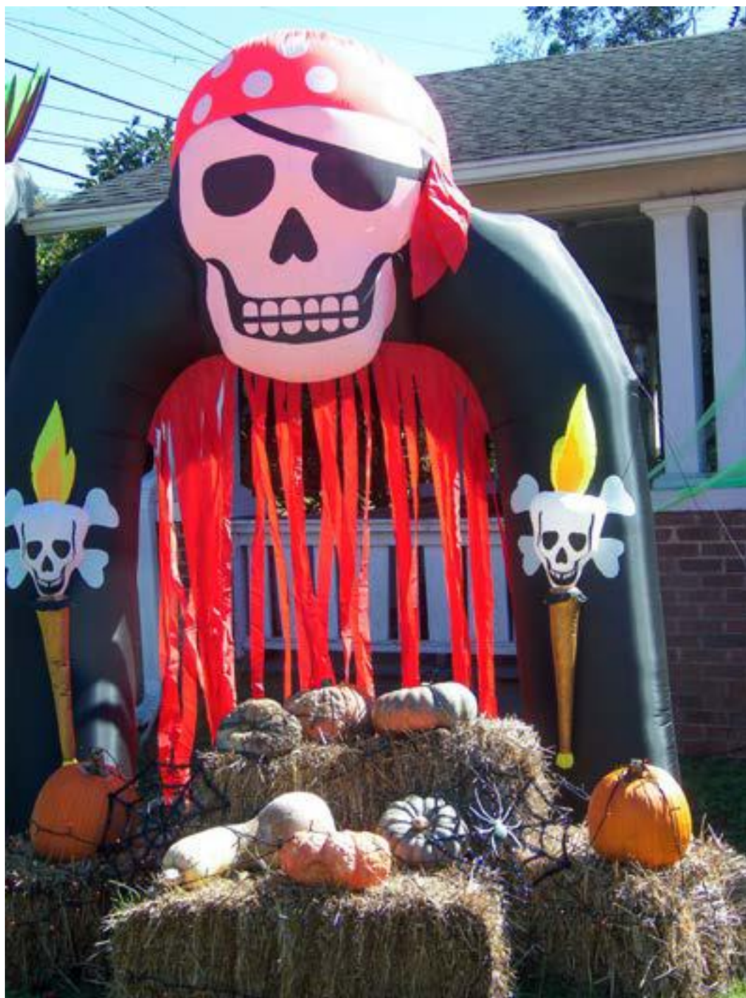
Halloween drew a "spirited" response in Abbeville in 2021, as could be seen from this scene on Magazine Street.