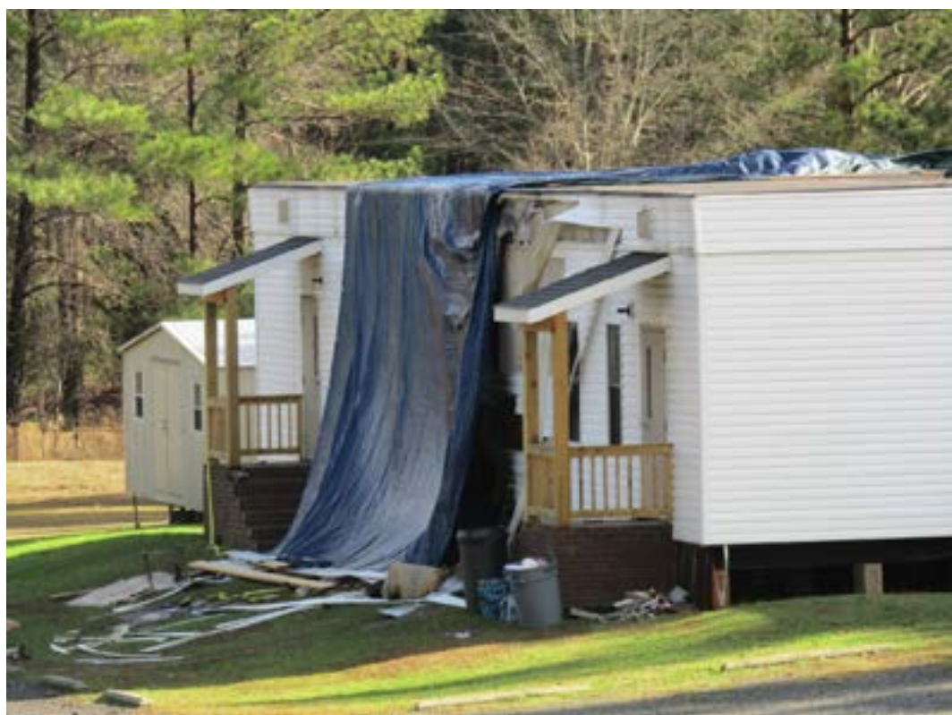
Fire damaged the Abbeville Church of Christ on the eastern outskirts of Abbeville recently.

"Liberty lies in the hearts of men and women; when it dies there, no constitution, no law, no court can save it."