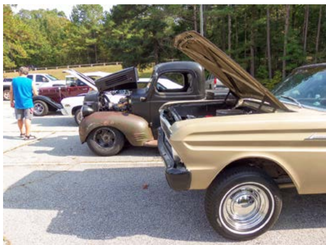
This car show at the Lake Russell Recreation and Tourism Coalition's Fall Jubilee held last year at the Blue Hole recreation area in Calhoun Falls drew motor vehicle lovers.