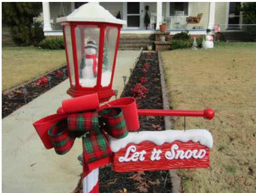
This was the message we found on North Main in Abbeville recently. Will they get their wish? Only time will tell.