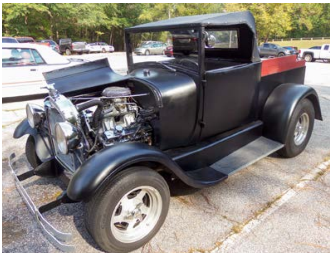
A car show was part of the Lake Russell Recreation and Tourism Fall Jubilee at Blue Hole recreation area in Calhoun Falls last year, and one of the vehicles displayed was this 1929 Ford, which surely drew its share of admirers.