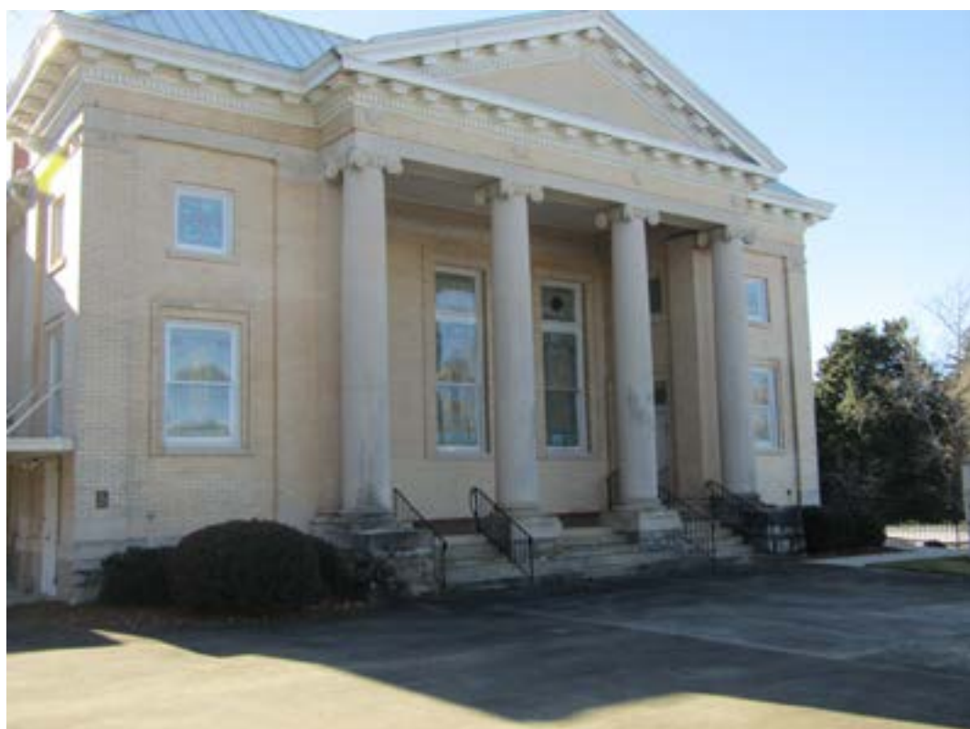
First Baptist Church of Abbeville celebrated its 150th birthday last year.

"When I think of First Baptist Church Abbeville's 150 years in existence one word comes to mind--rich. Rich in heritage, rich in dedication, and rich in serving the Lord."