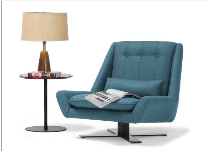
Palms II Chair

Designed beautifully and built strong for both residential and contract.