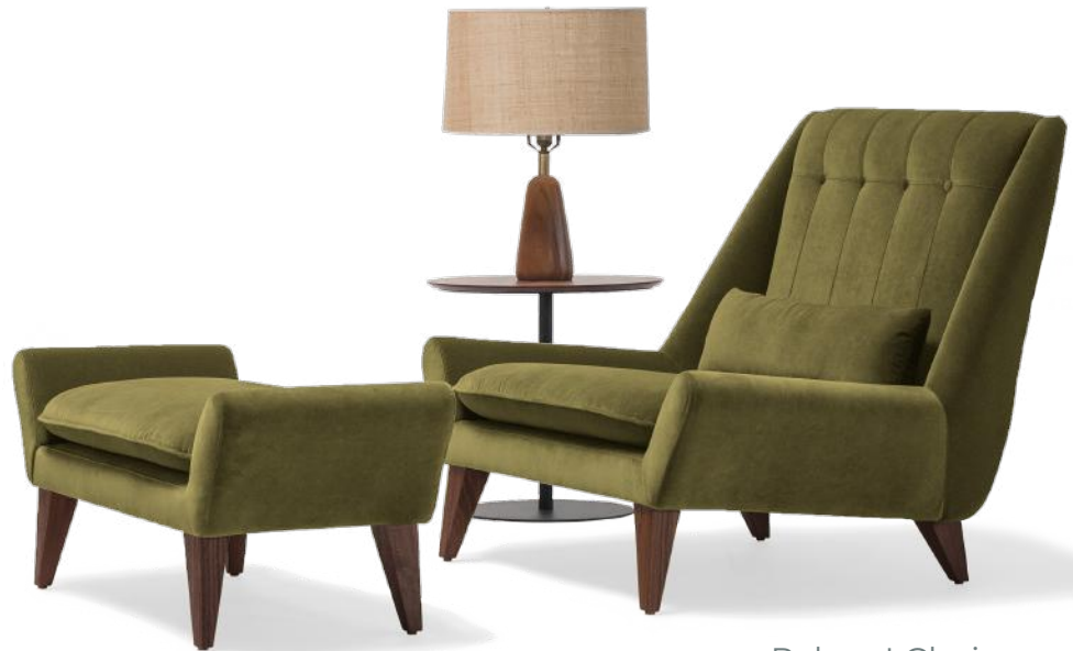
Palms I Chair