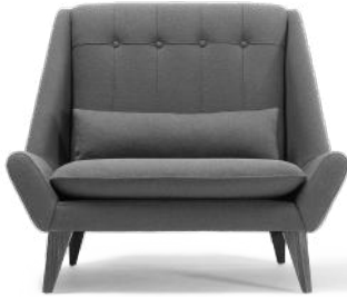
Palms I Chair 40W x 35D x 34.5H