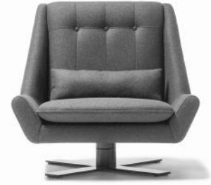
Palms II Chair Swivel 35W x 34D x 32H