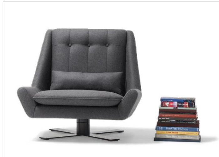
Palms II Chair

Designed beautifully and built strong for both residential and contract.