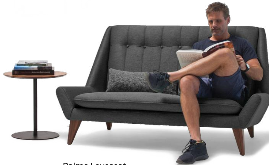
Palms Loveseat 60W x 35D x 34.5H