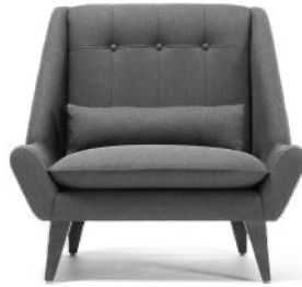
Palms II Chair Legs 35W x 34D x 32H