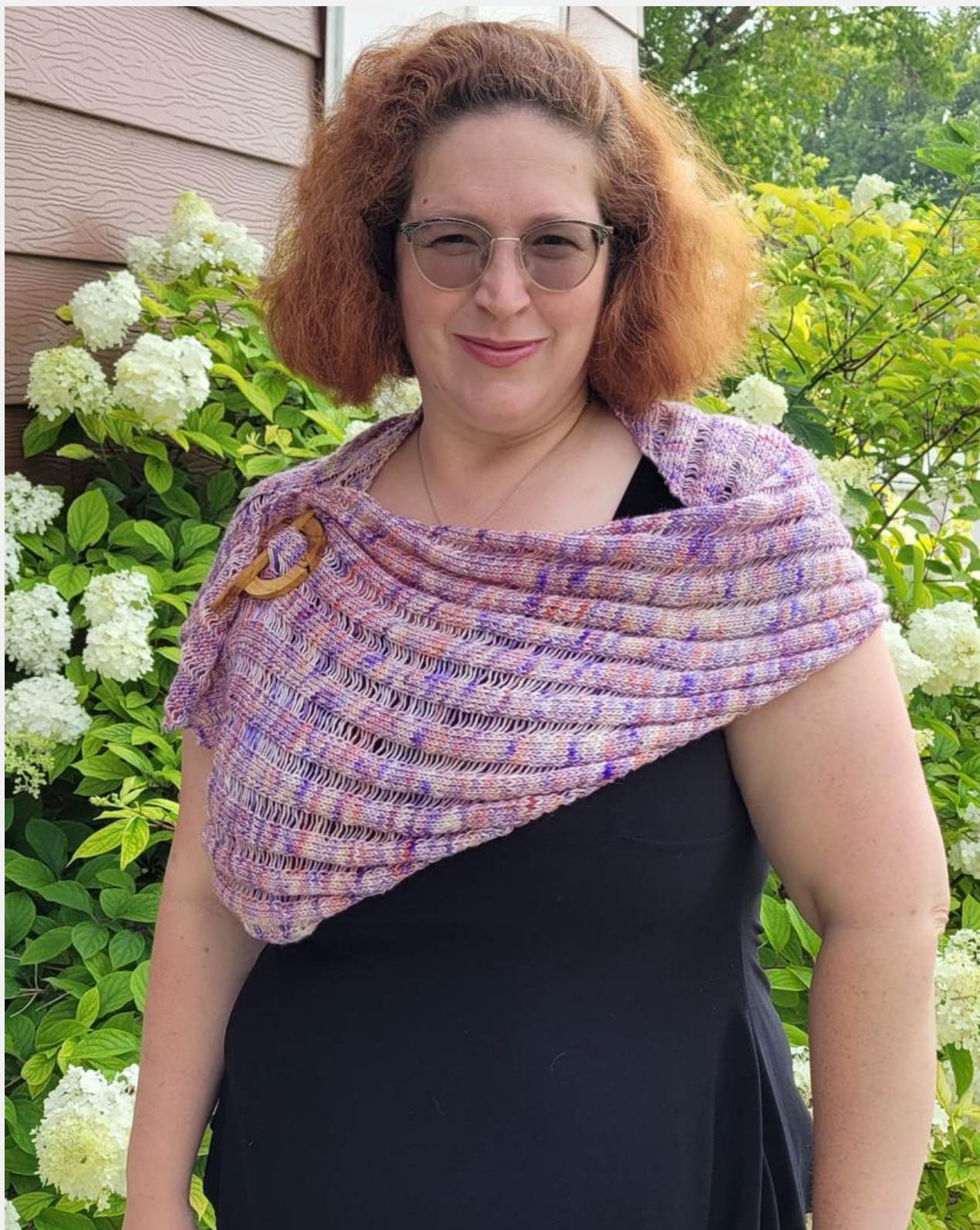
Alainn Yarns | Memento Sock | Color: Daybreak Awakening 1 skein