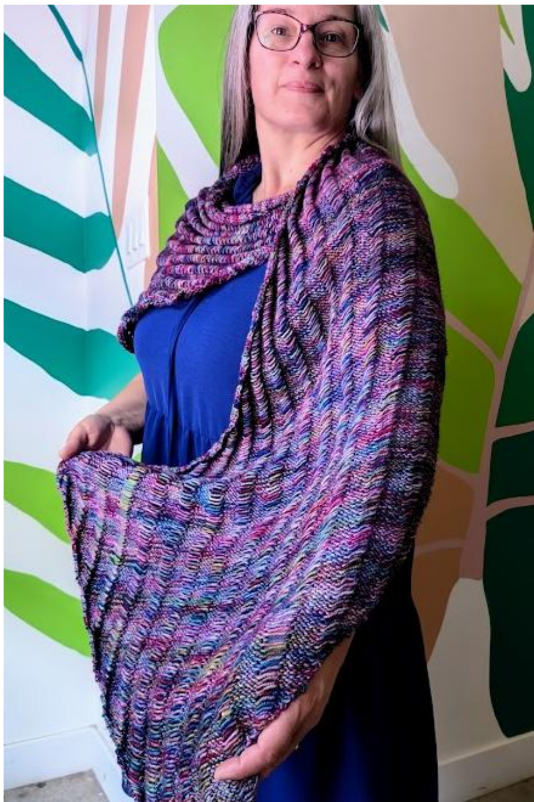
Cactus Yarn Studio | DK Socks Hugger | Color: Illusion 3 skeins