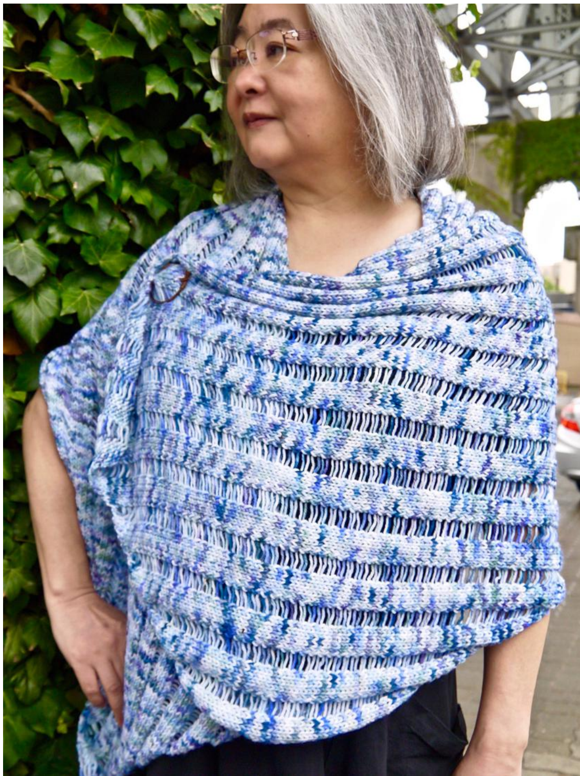
Yoriko Oki | SW Merino Worsted | Color: Reflection 4 skeins