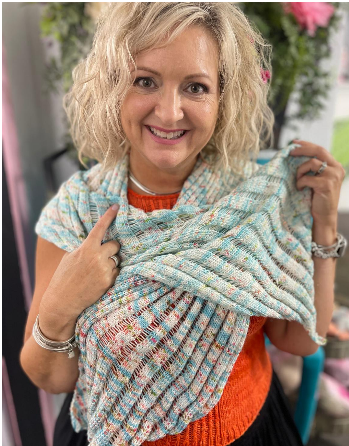
Arkansas Yarn Co. | Yummy Plush fingering Color: Papa's Paintbrush | 2 skeins