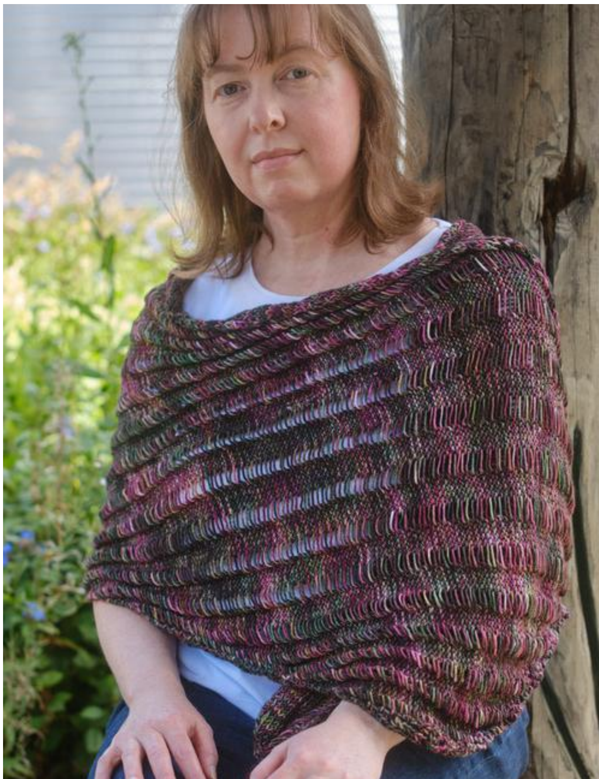
The Maid and Spindle | SW Merino Worsted Color: Hellebores | 4 skeins