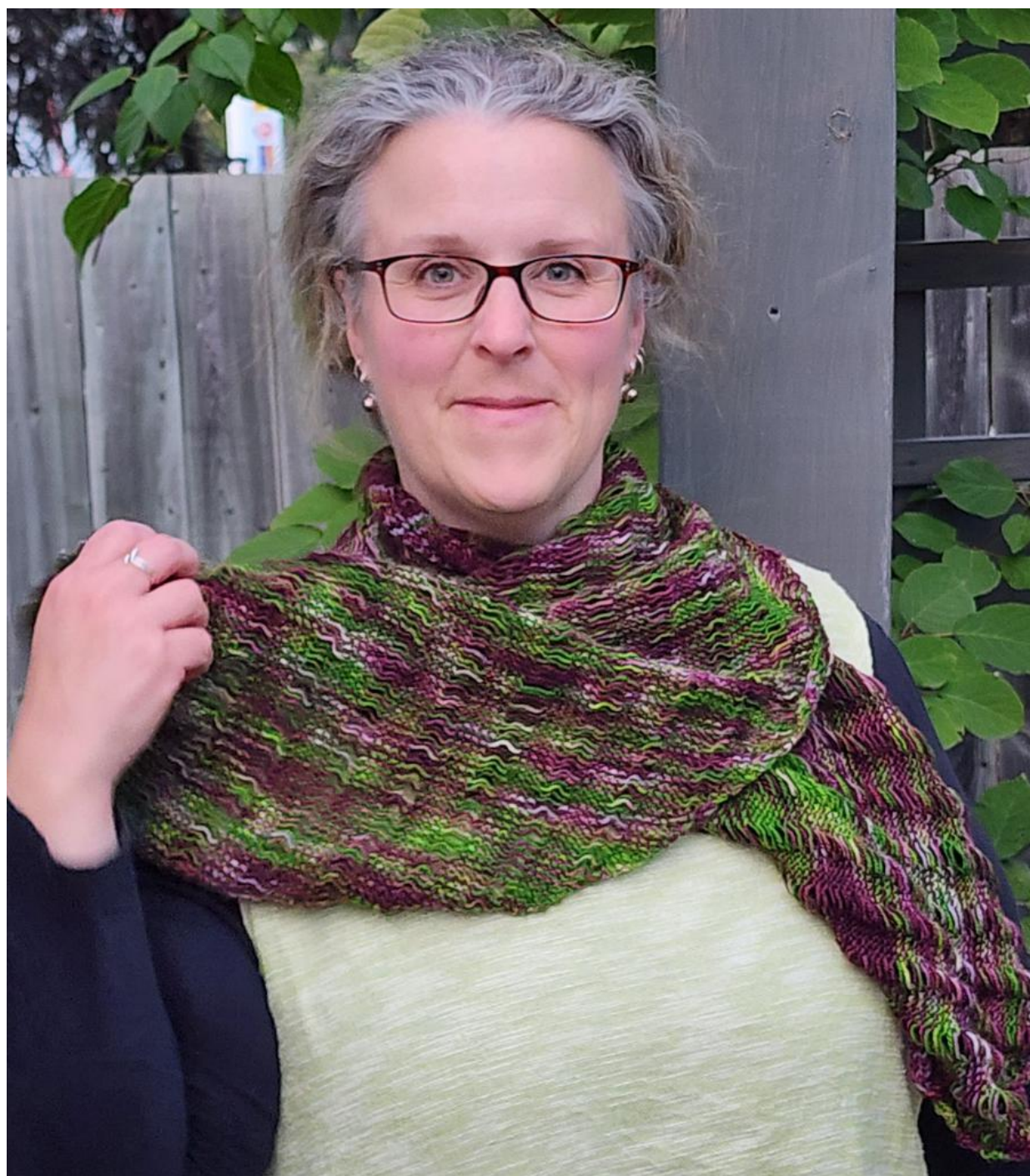
Cloud 9 Fiberworks | Cumulus Sock | Color: Hedge Witch 2 skeins