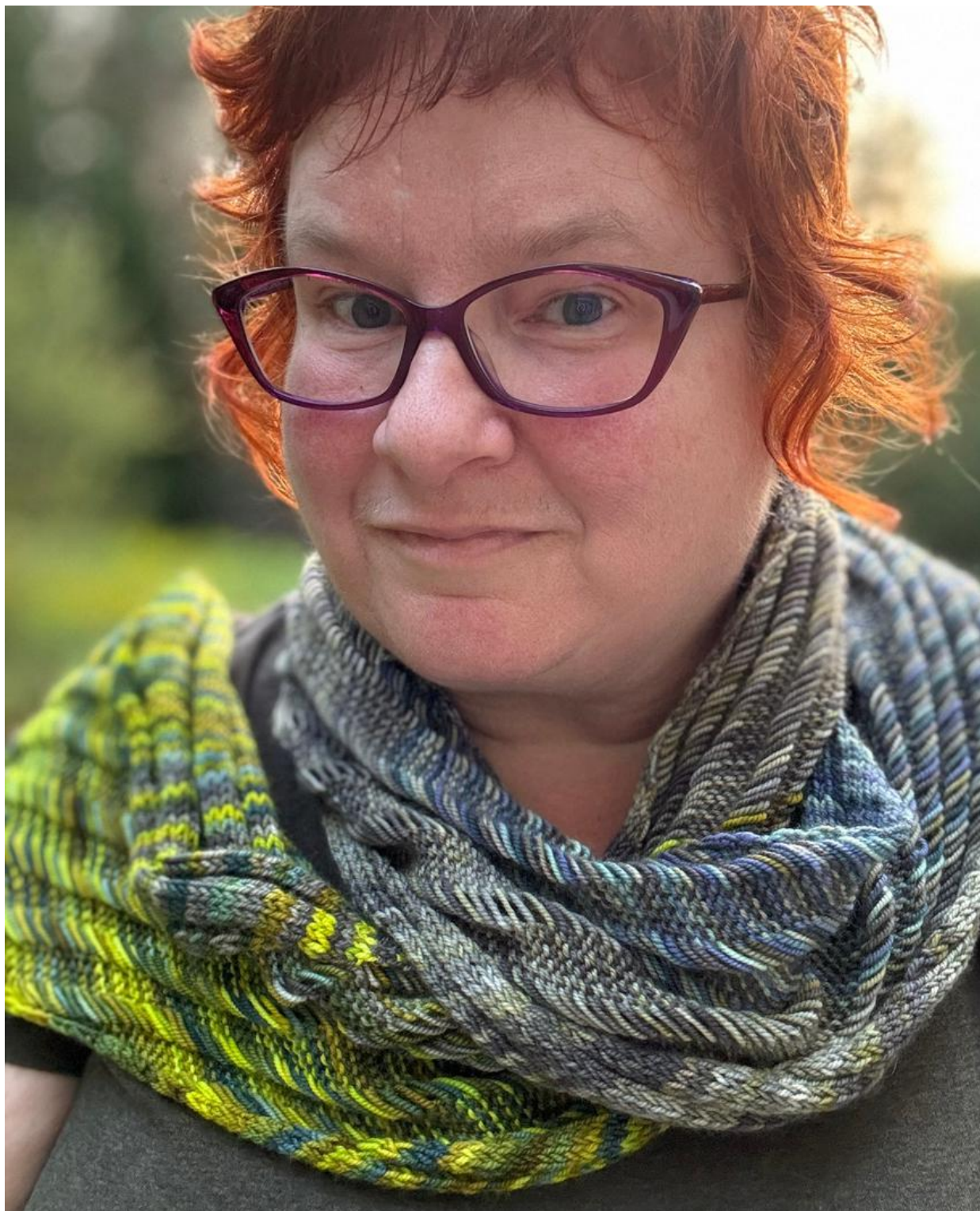
Indigodragonfly | R.O.U.Sport Color: Trees and Rocks and Water | 3 skeins