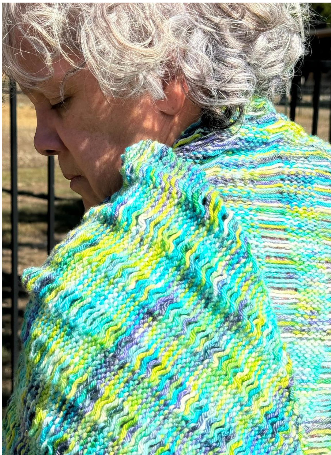
Chicken Coop Dyeworks | Crown Feathers | Color: Peacock 4 skeins