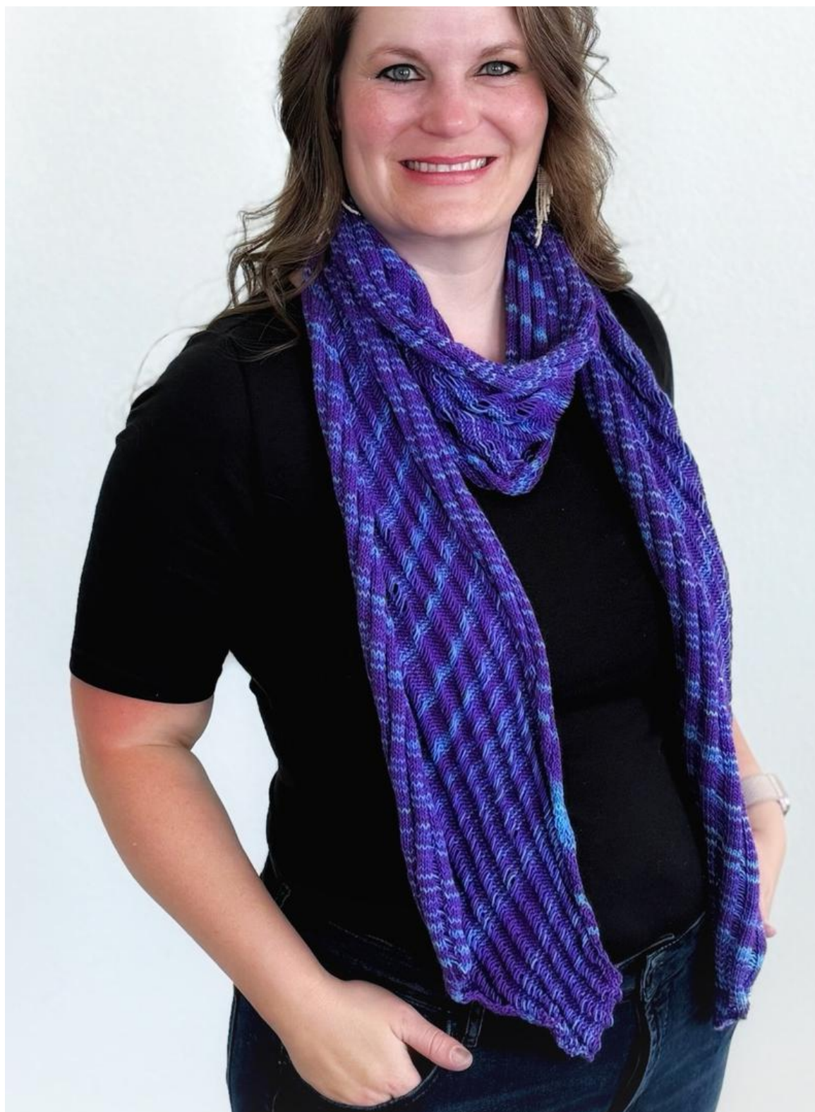
Breaking Yarn | Breaking Yarn Sock | Color: Breaking Violet 2 skeins