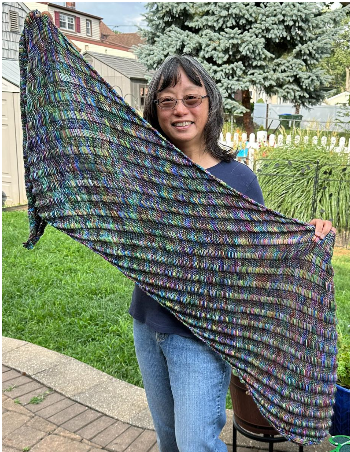
Marianated Yarns | Playtime worsted | Color: Marsh Lights 3 skeins