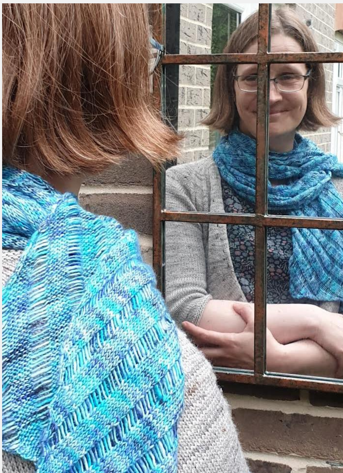
Skein Queen | Selkino fingering | Color: Lulworth Cove 1 skein