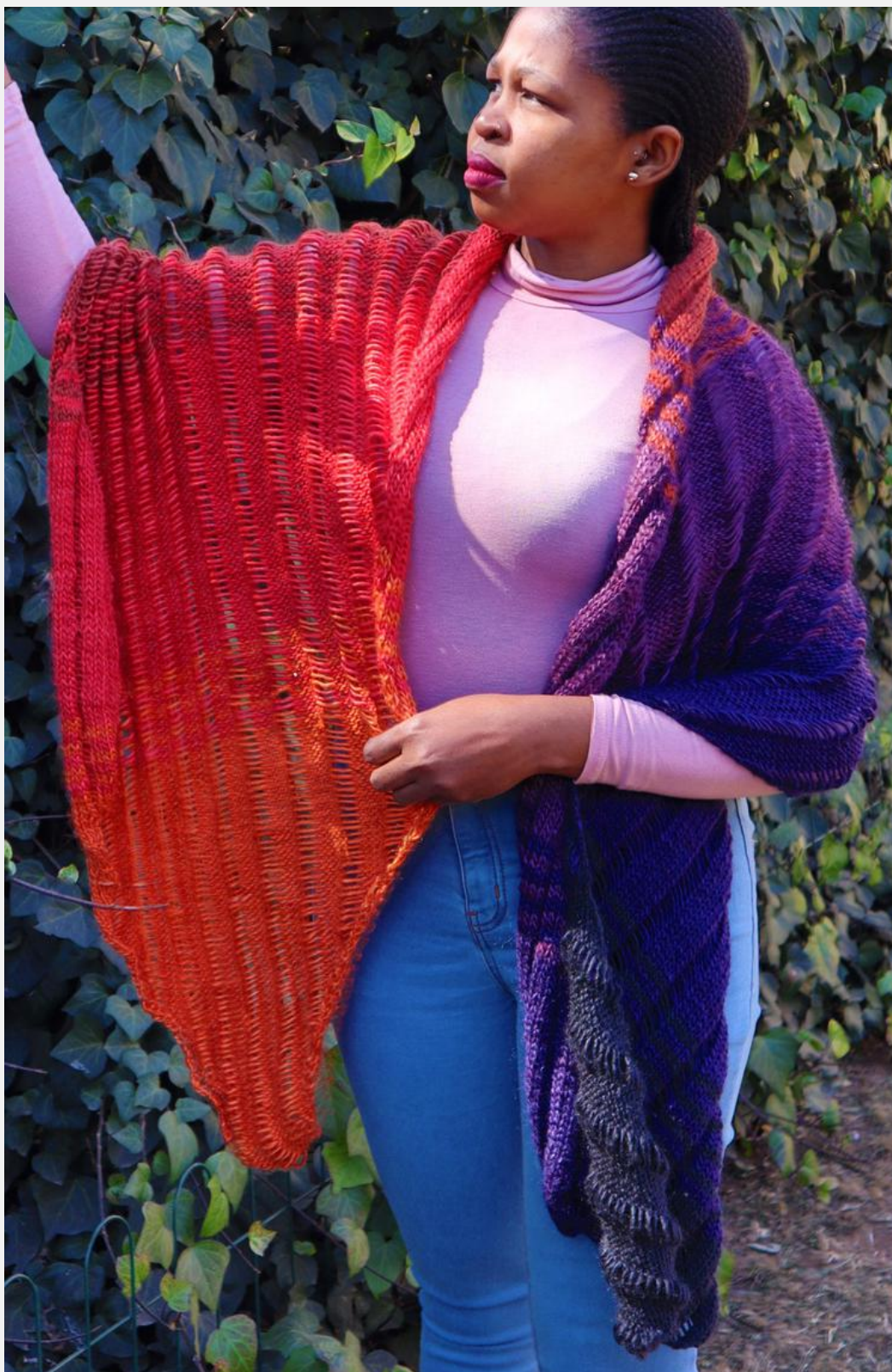
Colourspun | Pastiche Luxury Blends Colour Stack - Aran Color: Tiger Lily | 1 color stack (6 cakes)